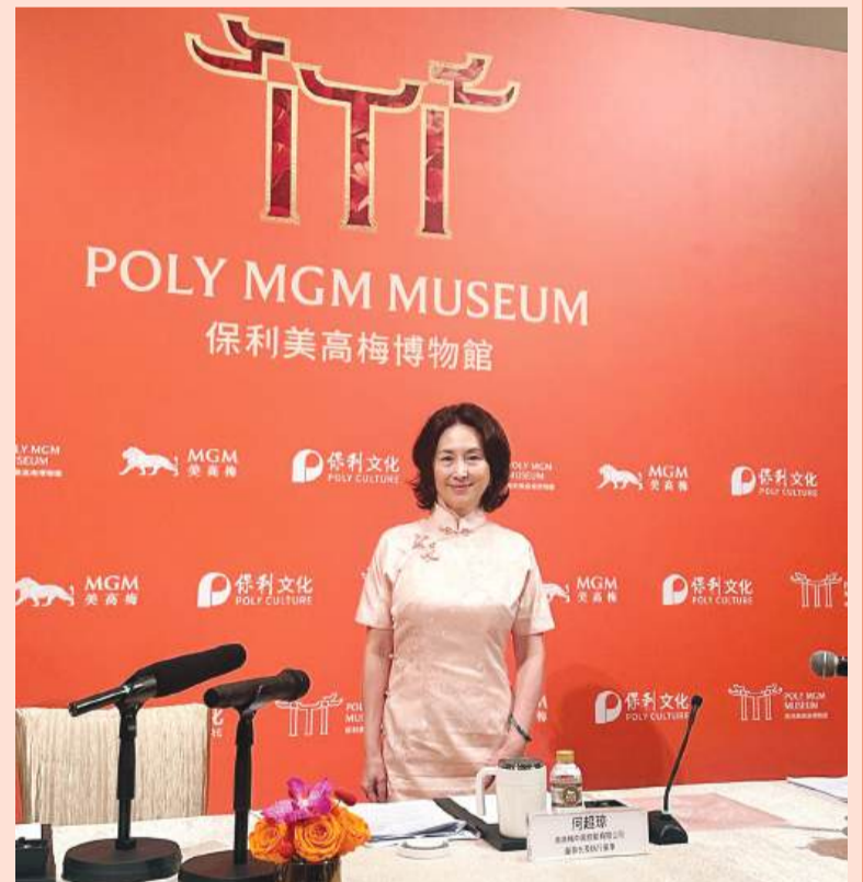
MGM China Holdings Limited Chairperson & Executive Director Pansy Ho Chiu King poses during yesterday's press conference held at MGM MACAU in Nape.

Ho pointed out that Beijing-based Poly Culture Group Corporation Limited has organised a number of shows and exhibitions, which have been shown to help extend tourists' length of stay in Macau, adding she hoped that in the future, Macau can continue to develop the role, potential and advantages of its unique "One Centre, One Platform, One Base" development concept, especially in cooperating with the Greater Bay Area (GBA), and strive for more high-quality MICE exhibitions to be held in Macau.