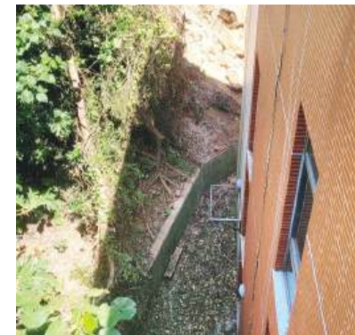
This undated handout photo released by the Public Works Bureau (DSOP) on Wednesday shows its ongoing project to consolidate a hillside slope next to the Macau Public Security Forces Academy (ESFSM) in Coloane.

posing a medium risk. No slope was classified as posing a high risk. ■