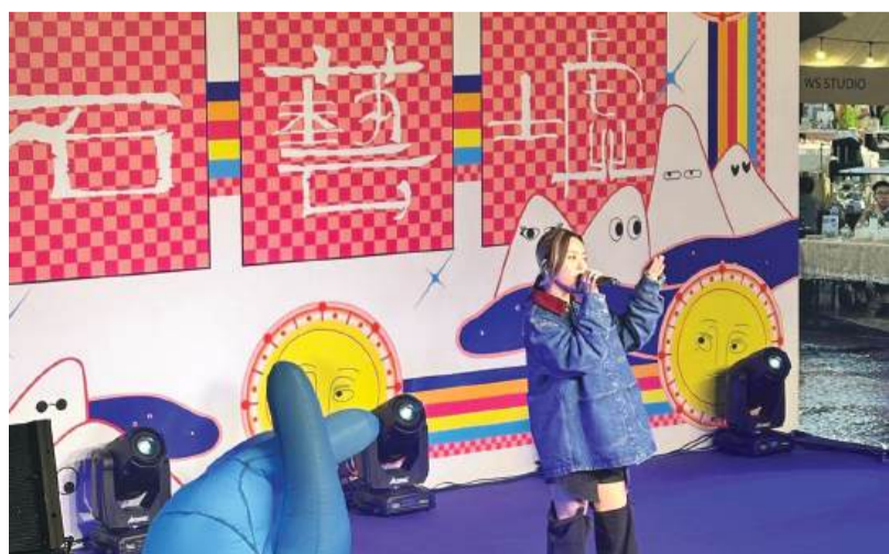
Hong Kong singer Kiri.T performs during the opening ceremony of the Tap Siac Craft Market yesterday in Praça do Tap Seac. – Photo: Ginnie Liang

For more information, one can visit the event's website at https://www.craftmarket.gov.mo . ■