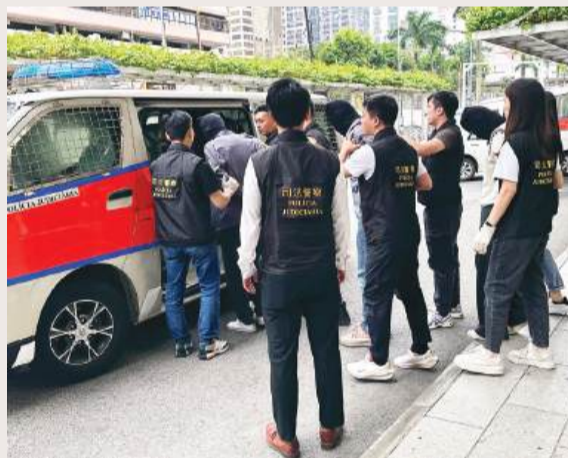
The hooded illegal currency exchange suspects are escorted in two separate groups, one comprising four and the other two suspects, by Judiciary Police (PJ) officers to PJ vehicles outside the PJ headquarters in Zape.