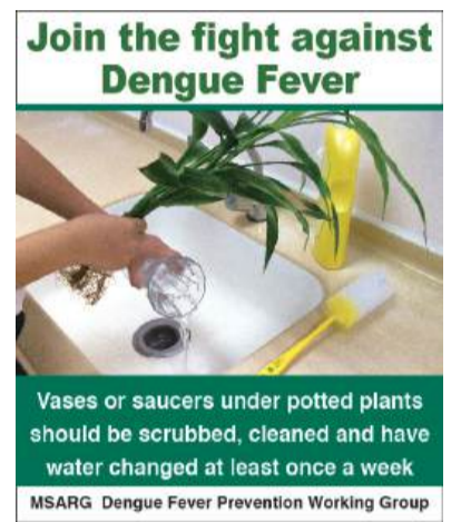
Join the fight against Dengue Fever Vases or saucers under potted plants should be scrubbed, cleaned and have water changed at least once a week MSARG Dengue Fever Prevention Working Group

With the ageing of the population, diabetes, like other chronic diseases, will gradually increase in incidence and the burden