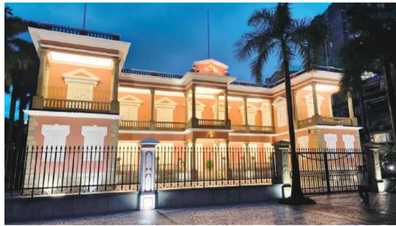
This file photo taken earlier this year shows a man walking past Government Headquarters on Avenida da Praia Grande in Nam Van.

According to the 2025 budget bill, the government expects its