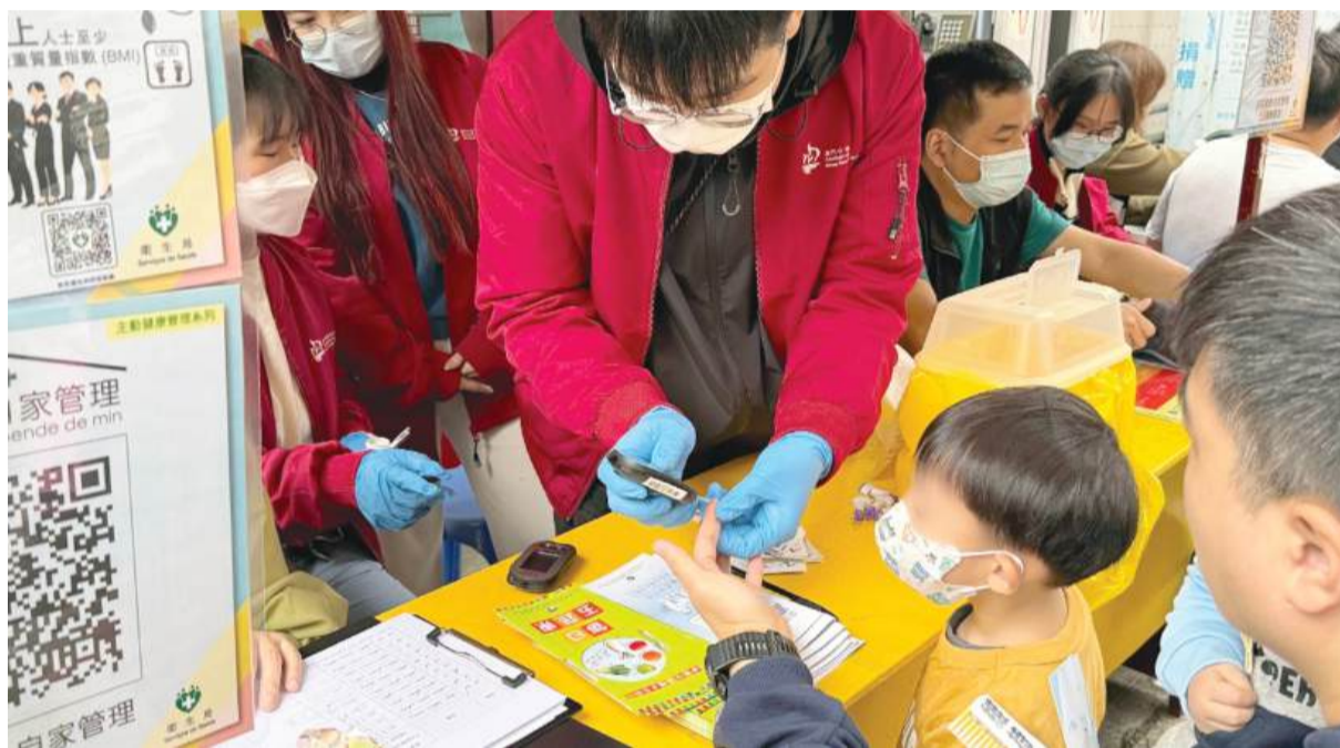
This undated handout photo released by the Health Bureau (SSM) on Wednesday shows a local resident undergoing a blood glucose test.