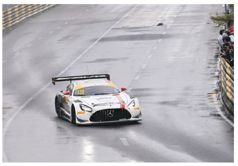
Engel racing round the Macau Grand Prix's Guia Circuit in a Mercedes-AMG GT3 (Evo).

Climbing into second place, Fuoco tried to snatch the first place from Marciello during the rest of the race until the remaining two laps, when Fuoco who was driving a Ferrari and Marciello in a BMW ran off the track at Lisboa Bend after the latter failed to stop