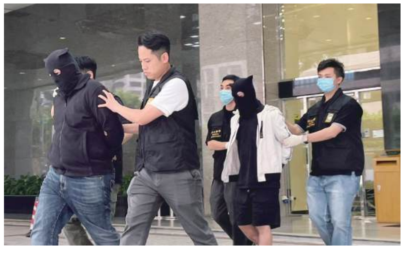
The two hooded local fraud suspects are escorted by Judiciary Police (PJ) officers to a PJ vehicle from the PJ headquarters in Zape.

In contrast, a male spectator from Foshan, surnamed Zhang, shrugged off the discomfort, suggesting that having a canopy would have made it even hotter. He felt the weather didn't significantly impact the viewing experience, except for the heavy morning rain. Zhang enjoyed the vibrant atmosphere of the Grand Prix, particularly praising the thrilling performances of the top international drivers. ■