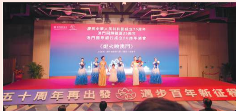
A group of staff and family members perform a show during yesterday's reception.