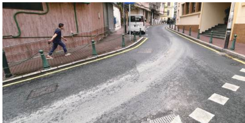
This handout photo provided by the Municipal Affairs Bureau (IAM) yesterday shows cement slurry left on Rua da Imprensa Nacional (官印局街).

In addition to facing penalties under relevant traffic regulations, drivers responsible for these spills will be held accountable for the costs associated with the clean-ups and road repairs. ■