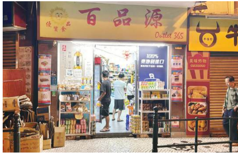
Residents shop at a 24-hour convenience store on Rua dos Mercadores (營地大街) late last night.

Private consumption expenditure sustained solid growth, driven by an increase in the income of residents amid the positive local economic situation and the improving job market. In the first three quarters, private consumption expenditure rose by 5.8 percent year-on-year, with household final consumption expenditure in the domestic market and abroad rising by 4.8 percent and 13.6 percent respectively. On the other hand, government final