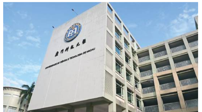
This photo taken yesterday shows the private Macau University of Science and Technology (MUST) campus in Taipa.