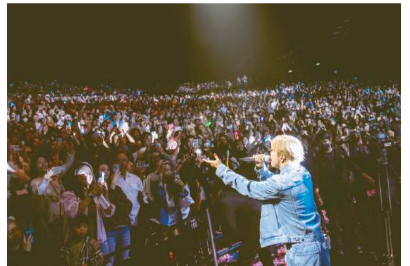
This undated handout photo taken and provided by integrated resort operator The Londoner Macao shows Hong Kong singer-songwriter Hins Cheung King-hin performing during one of his concerts.

The statement said that a total of 171,350 tickets were sold, while fans from Macau, Hong Kong, mainland China, Southeast Asia,