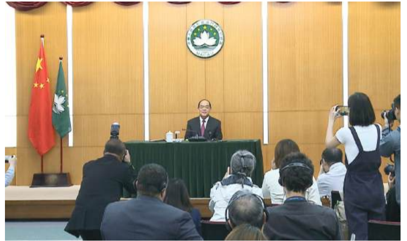
Chief Executive Ho Iat Seng poses for press photographers at the start of his press conference at Government Headquarters yesterday afternoon.

In pre-pandemic 2019, Macau recorded 39.4 million visitor arrivals, according to official statistics.