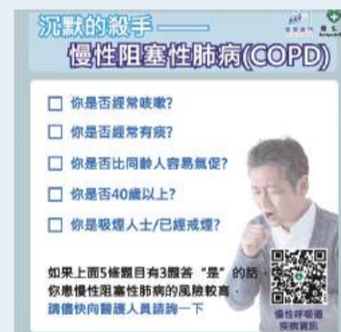
This poster provided by the Health Bureau (SSM) yesterday aims to raise residents' awareness of chronic obstructive pulmonary disease (COPD).

According to the Statistics and Census Bureau (DSEC), COPD