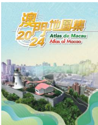
This image provided by the Mapping and Land Registry Bureau (DSCC) yesterday shows the cover of the "Atlas of Macao - 2024".

Moreover, special topics like "Roaming Along the Macao Coastline", which explores Macau's coastal routes and seaside attractions, and displays the latest topographic data of the local coastline and surrounding environment through aerial images and topographic maps captured by drones, and the "Review of Macao's