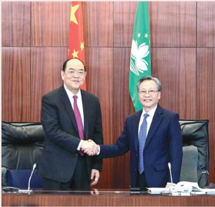
Chief Executive Ho Iat Seng (left) shakes hands with Legislative Assembly (AL) President Kou Hoi In after presenting his government's work report for this year, including a summary of his five-year governance, and a brief proposal for next year's budget to lawmakers during yesterday's plenary session in the legislature's hemicycle, where he announced that the government's 2025 budget proposes the continuation of its annual cash handout scheme with the amount to remain unchanged at 10,000 patacas for each permanent resident and 6,000 patacas for each non-permanent residents.

He also pointed out that when he took office in late 2019, Macau's financial reserves stood at 579 billion patacas, while now they amount to over 600 billion patacas, despite a four-year-long budget deficit, i.e., from 2020 through 2023. Ho, a former president of the local legislature, business community leader and member of the elite Standing Committee of the National People's Congress (NPC), said the fact that Macau's financial reserves have continued to grow despite the pandemic and budget deficit was the result of "good investment performance". ■