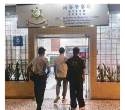
This undated handout photo provided by the Public Security Police (PSP) yesterday shows a PSP officer escorting the sexual harassment suspect to the Nam Van Police station.