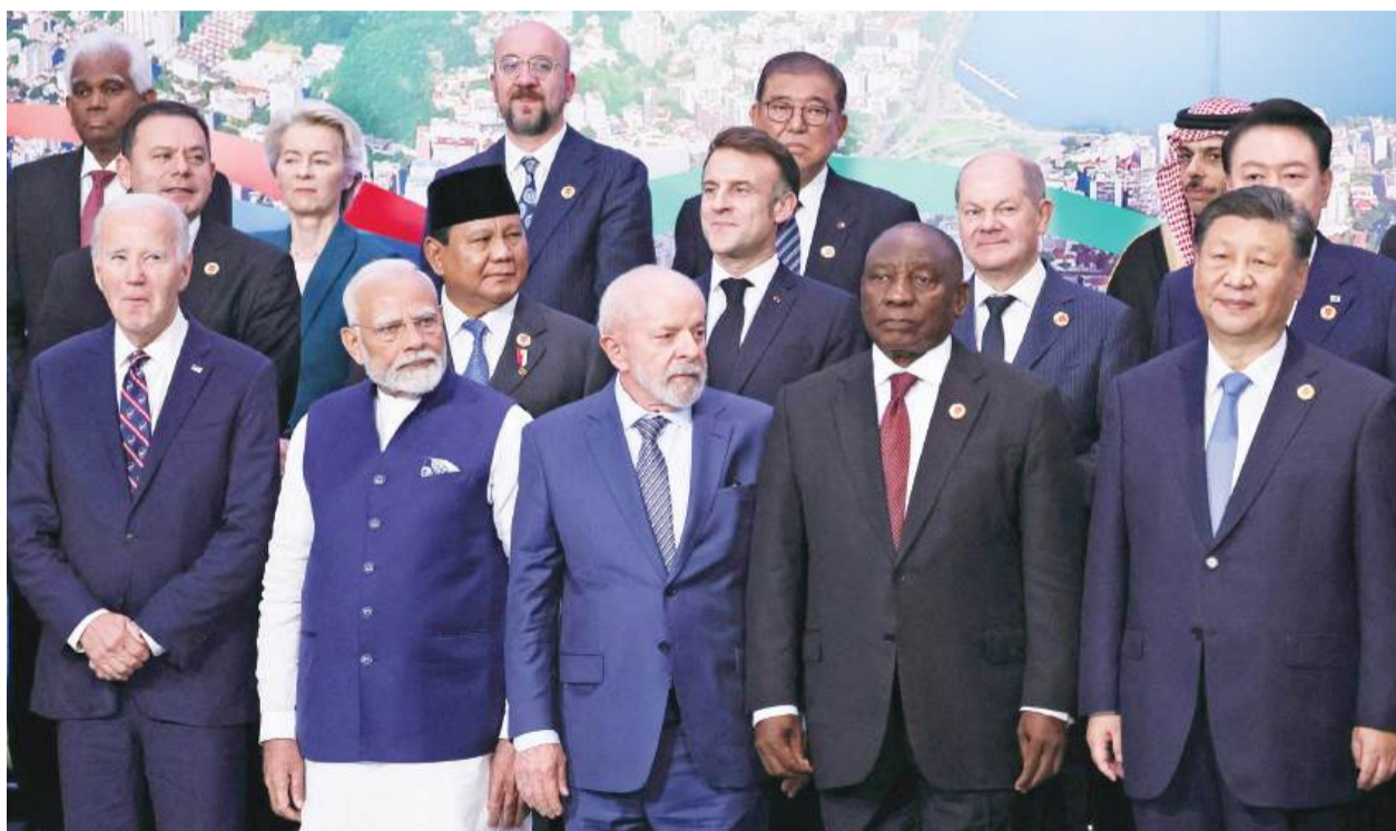
US President Joe Biden (from left to right front row), Indian Prime Minister Narendra Modi, Brazilian President Luiz Inácio Lula da Silva, South African President Cyril Ramaphosa, Chinese President Xi Jinping, German Chancellor Olaf Scholz (from right to left second row), French President Emmanuel Macron, Indonesian President Prabowo Subianto, and other world leaders gather for a group photo on the second day of the G20 Summit in Rio de Janeiro, Brazil, yesterday.