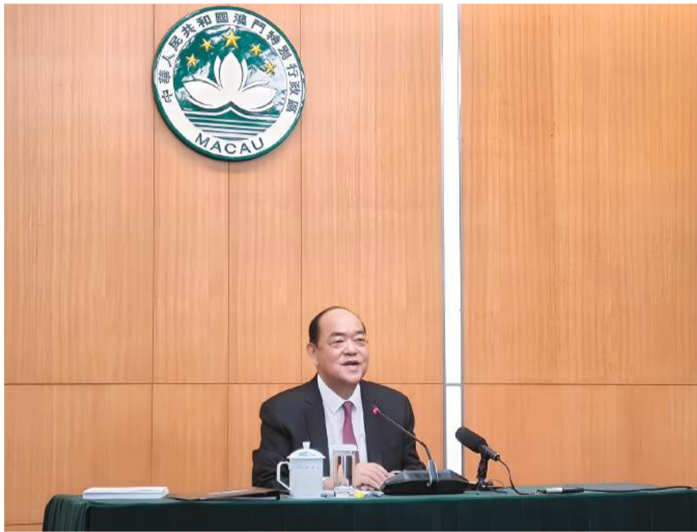
Chief Executive Ho Iat Seng addresses yesterday’s press conference at Government Headquarters about his five-year administration.

Ho announced in a statement on August 21 that he decided not to seek re-election as “my health has still not fully recovered”.