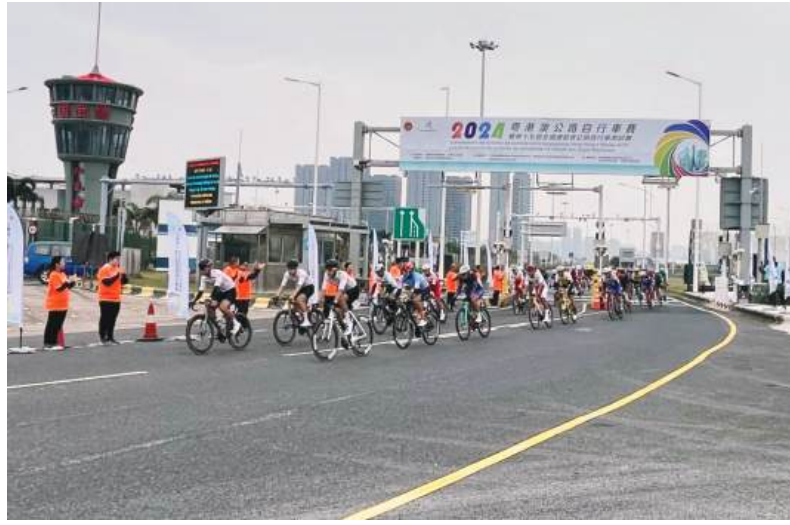
Cyclists cross the Macau-Zhuhai border at the Hong Kong-Zhuhai-Macau Bridge (HZMB) yesterday morning.

Despite encountering light rain and wet roads, all cyclists safely completed the local segment of the race, according to the Preparatory Office for the Organisation of the Macau Competition Zone of the 15 th National Games and the 12 th National Games for People with Disabilities. They noted that the local race predominantly ran across both bridge sections, leading to the decision not to install spectator stands for the official race next