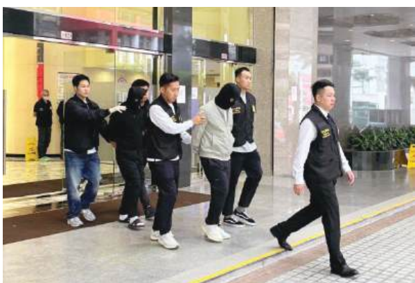
Judiciary Police (PJ) officers escort the two hooded fraud suspects to a PJ vehicle outside the PJ headquarters in Zape yesterday.

The Judiciary Police (PJ) have arrested two illegal currency exchange dealers from the mainland for defrauding a gambler, PJ spokesman Lou Chan Fai said during a special press conference on Friday.