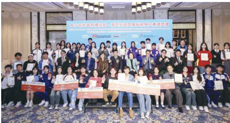
This photo shows winners posing with guests and judges on the sidelines of Saturday's prize giving ceremony for the "Youth Hospitality Activities - Macao Tourism Courtesy Short Video Contest".

The contest was co-launched by MGTO and MGM and coordinated by the Macao New Chinese Youth Association, with the full list of winners available on https://ep.macaotourism.gov.mo/contest-macao-courtesy-2024/?lang=en ■