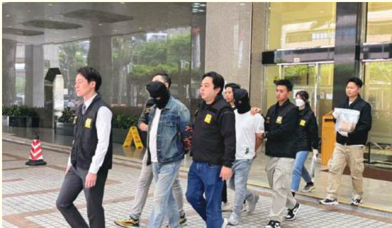
Judiciary Police (PJ) officers escort the two hooded fraud suspects to a PJ vehicle outside the PJ headquarters in Zape yesterday.

The two suspects have been transferred to the Public Prosecutions Office (MP), facing fraud and illegal currency exchange charges, Lou said. ■