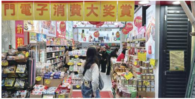
A pedestrian walks past a shop popular with tourists in the city centre on Friday.

In the third quarter, the value of retail sales fell by 15.5 percent year-on-year, with decreases in the