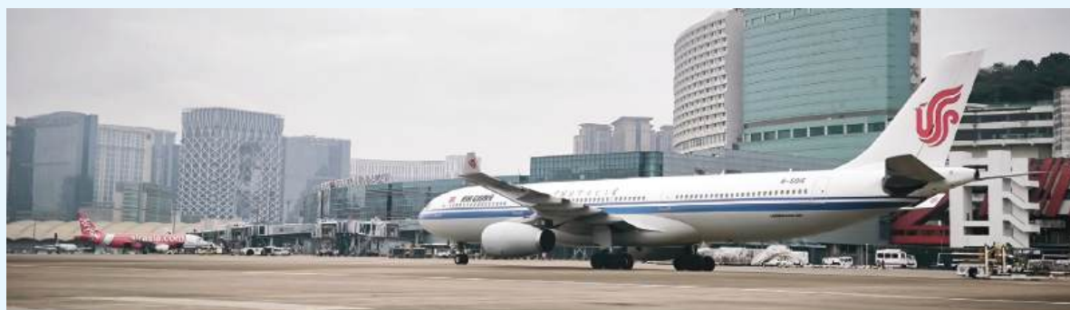
An Air China Airbus A330 aircraft arrives at the local airport on Friday from Hangzhou. The wide-body aeroplane has been leased to Air Macau since earlier this year for operating its regular passenger flights between Macau and Hangzhou and between Macau and Beijing.

The airport's designed maximum capacity had been six million passengers per year since it started operating in November 1995, before its passenger terminal building was expanded in 2018 when the maximum capacity was raised to 7.8 million passengers per year. The terminal building underwent another expansion in 2020 and it was completed in 2022, raising the capacity to 10 million. ■