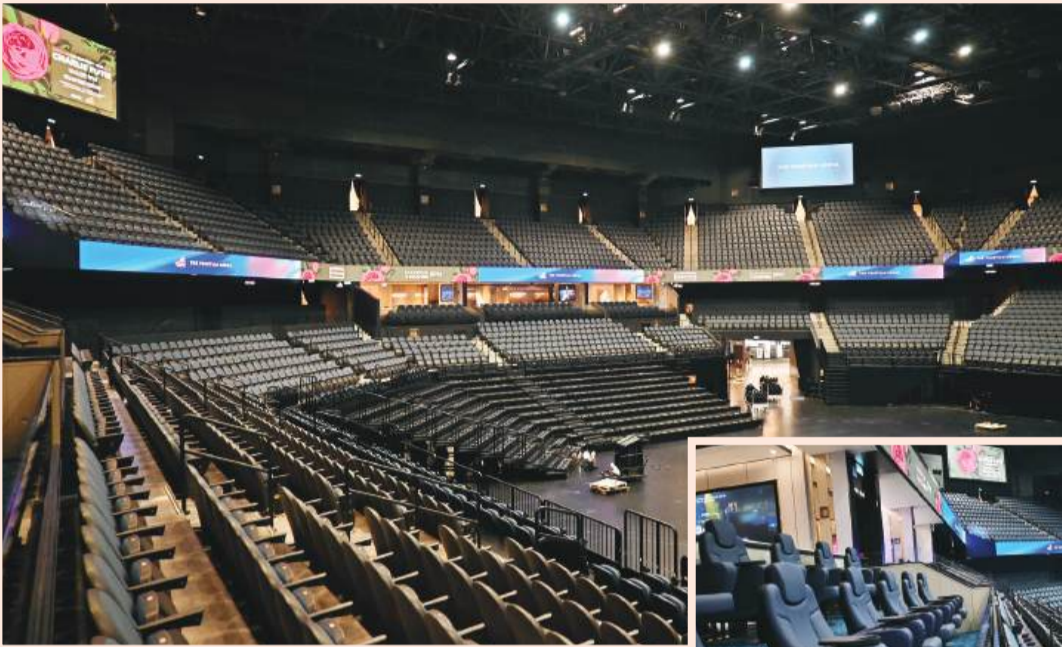
These photos taken yesterday show the revamped The Venetian Arena in Cotai.