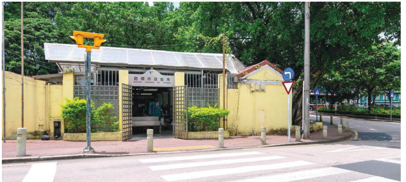
This undated handout photo released by the Municipal Affairs Bureau (IAM) yesterday shows Coloane Market in Coloane Village.

The new list published yesterday consists of eight wet markets comprising seven in the Macau peninsula and one in Taipa, namely (by