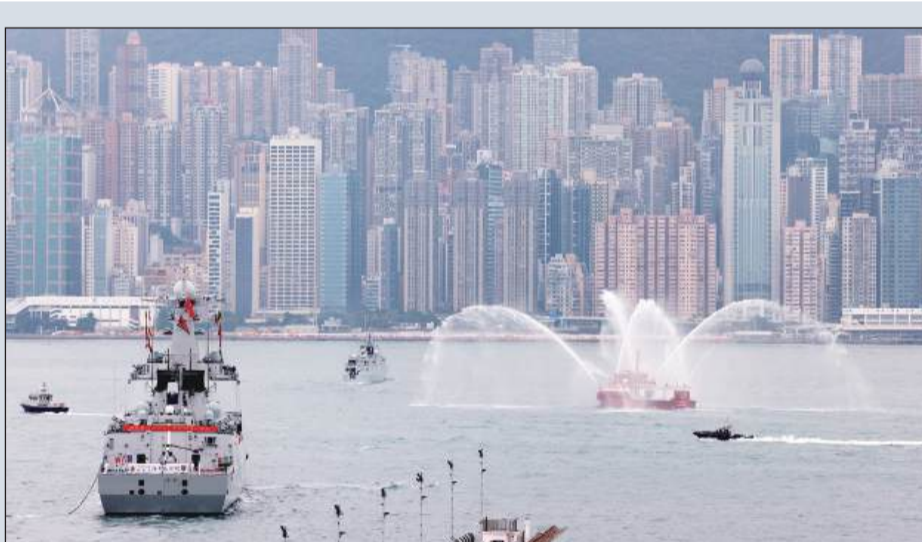
A fireboat of the Hong Kong Special Administrative Region (HKSAR) Government performs a water gate ceremony for the Chinese People's Liberation Army (PLA) Navy fleet in Hong Kong's Victoria Harbour yesterday. The fleet comprising the Hainan amphibious assault ship and the Changsha missile destroyer visited Hong Kong from Thursday to yesterday.

The statement also said that four other social housing projects under construction in the Zone A land reclamation area will provide 4,088 flats. ■