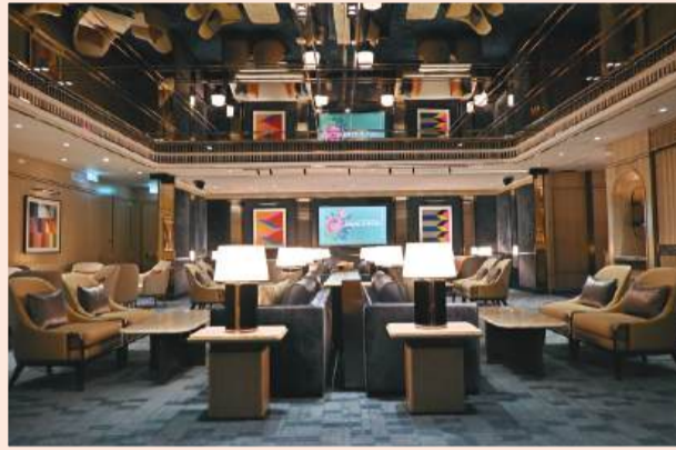
These photos show two of the VIP areas of The Venetian Arena.