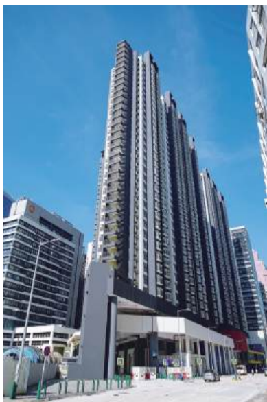
These two handout photos taken and released by the Housing Bureau (IH) on Friday shows the new Mong Son social housing estate and one of its flats.

The plot where the social housing estate is located covers 11,443 square metres, located next to the Macao Daily News Building on Avenida de Venceslau de Morais and the CEM headquarters on Estrada de D. Maria II.