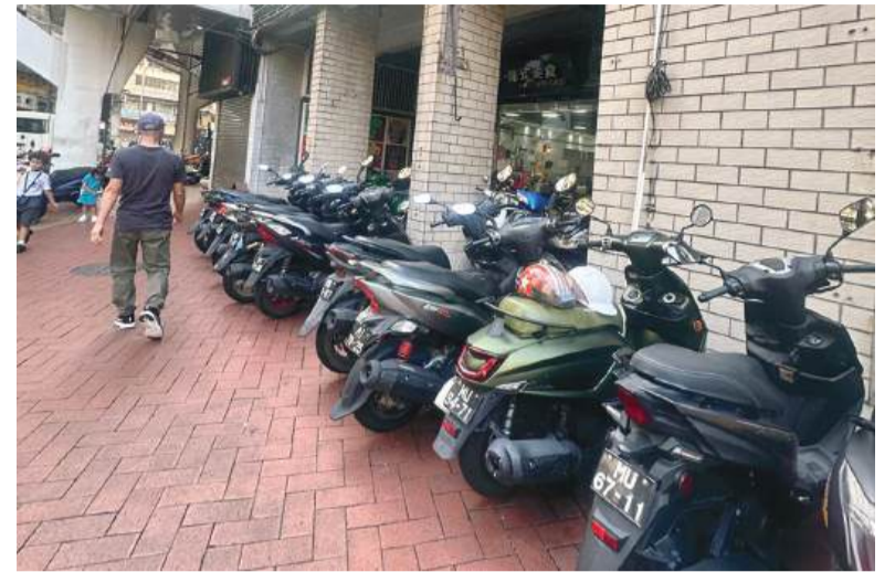
This photo taken in September shows motorcycles parking on a pavement in Toi San district.