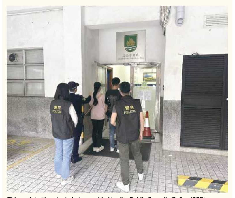
This undated handout photo provided by the Public Security Police (PSP) yesterday shows police officers escorting the two theft-by-finding suspects to a police station in Taipa for questioning.