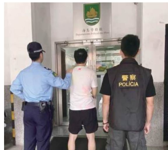
This undated handout photo provided by the Public Security Police (PSP) on Wednesday shows two PSP officers escorting the aggravated theft suspect to a police station in Taipa.