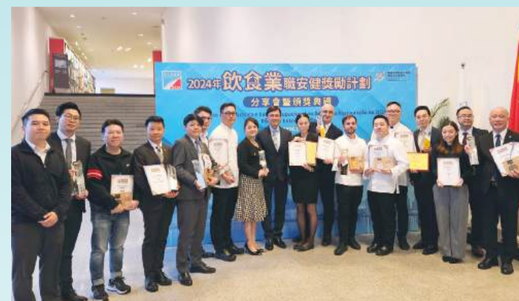
This undated handout photo provided by SJM Resorts on Wednesday shows members of its team holding their awards during the recent "Award Ceremony for Catering Occupational Safety and Health Awarding Scheme 2024".

Lastly, SJM Resorts earned two "OSH Improvement Items Silver Award".