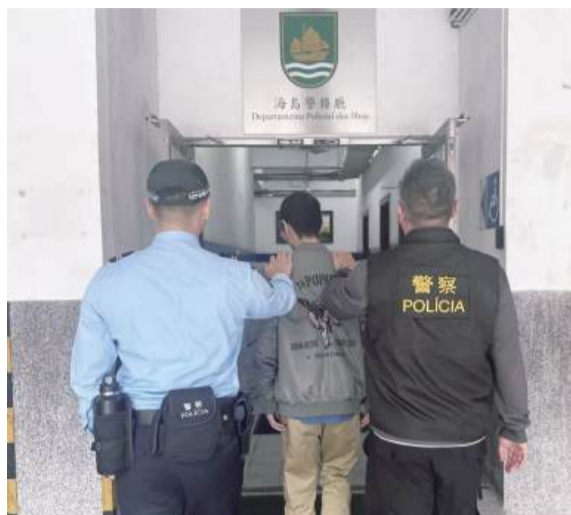
This undated handout photo provided by the Public Security Police (PSP) yesterday shows two PSP officers escorting the theft suspect to a police station in Taipa.