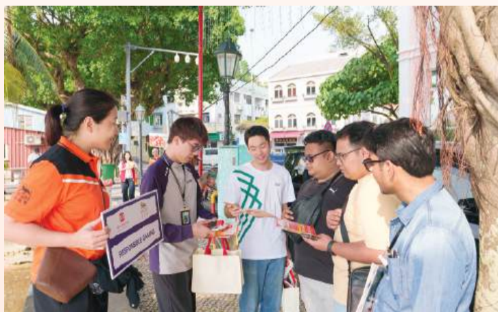
This undated handout photo provided by MGM on Wednesday shows ambassadors from the "Responsible Gaming Campus Ambassador" Programme promoting responsible gaming information in Coloane Village.

Integrated resort operator MGM said in a statement on Wednesday that its "Responsible Gaming Campus Ambassador" programme, which it co-organised with City University of Macau (CityU), has recently concluded with a certificate award ceremony for nearly 40 "ambassadors" from different majors such as Social Work and International Tourism and Management.