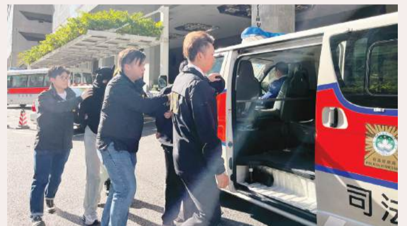
Judiciary Police (PJ) officers escort the two hooded fraud suspects to a PJ vehicle outside the PJ headquarters in Zape yesterday.

The follow-up PJ investigation showed that one of the fake chips