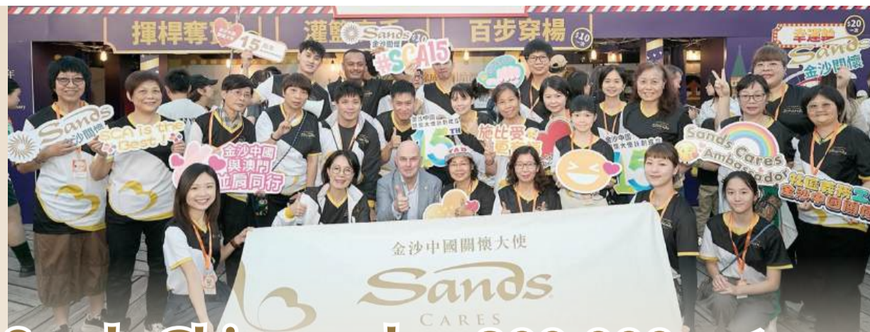
shows members of its Sands Cares Ambassadors posing in front of their booth during the 55th Caritas Macau Charity Bazaar.