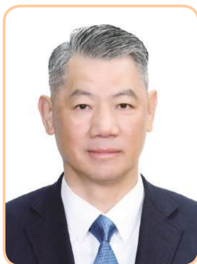
Unitary Police Service Commissioner-General (reappointed) Leong Man Cheong