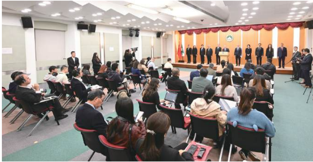
Journalists attend yesterday's press conference when Sam presented the 10 top officials of his incoming administration.

The Central People's Government shall appoint or remove the MSAR's chief executive, principal officials and chief prosecutor, according to Article 15 of the MSAR Basic Law.