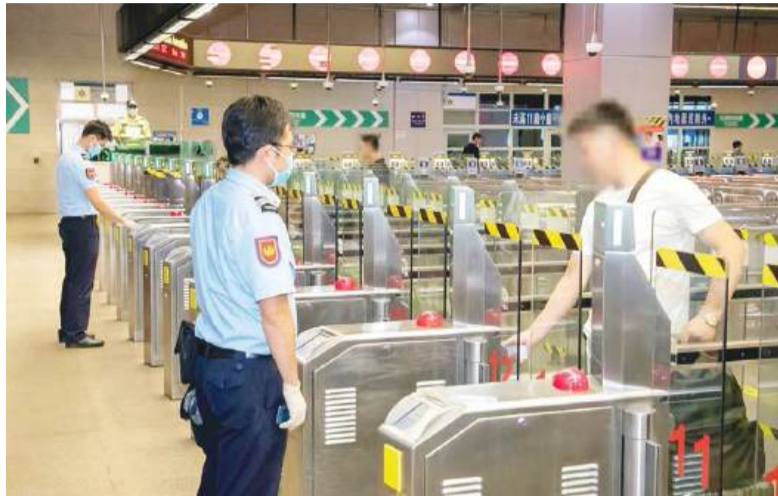
This undated pixelated handout photo provided by the Public Security Police Force (PSP) recently shows a traveller passing through the e-channels at Macau's Barrier Gate checkpoint, the main land border checkpoint between the Macau Special Administrative Region (MSAR) and Zhuhai City's Gongbei Port (checkpoint).

The measures are seen as the central government's latest efforts to enhance mobility and foster deeper