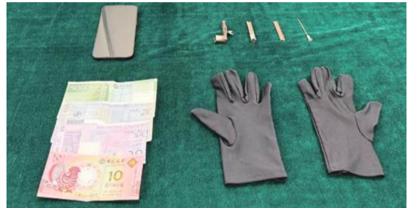
Evidence seized from the mainland burglary suspect including burglary tools is displayed during Friday's press conference at the Judiciary Police (PJ) headquarters.

Under questioning, Mo refused to cooperate, and was transferred to the Public Prosecutions Office (MP), facing aggravated theft charges, the spokesperson said. ■