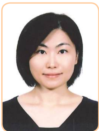
Commissioner Against Corruption-designate Ao Ieong Seong