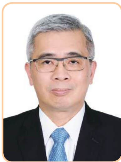
Secretary for Security (reappointed) Wong Sio Chak