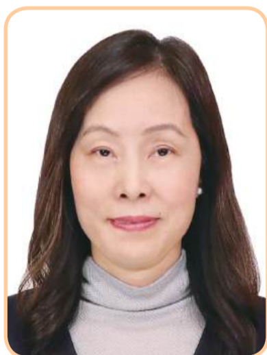
Commissioner of Audit-designate Elsie Ao Ieong U