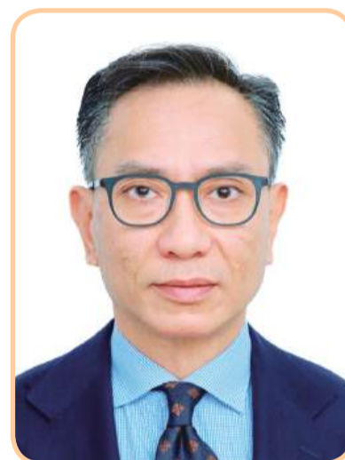
Prosecutor-General-designate Chan Tsz King