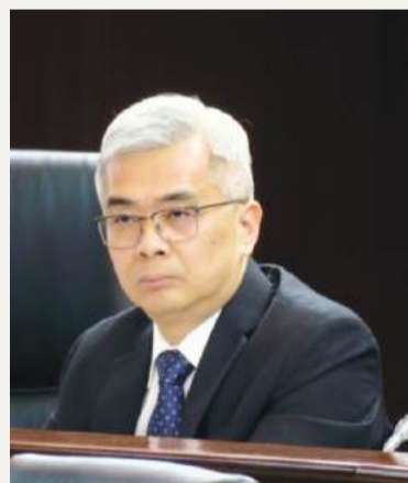
Secretary for Security Wong Sio Chak addresses yesterday's plenary session in the Legislative Assembly's (AL) hemicycle.

Wong concluded by stressing the importance of a collective effort in enhancing cybersecurity awareness among service providers and users alike. In response to suggestions for a government-operated cloud computing centre to assist small and medium-sized enterprises (SMEs) in data protection, he clarified that such measures would involve personal privacy issues, making it impractical for the government to intervene in all private domains. ■