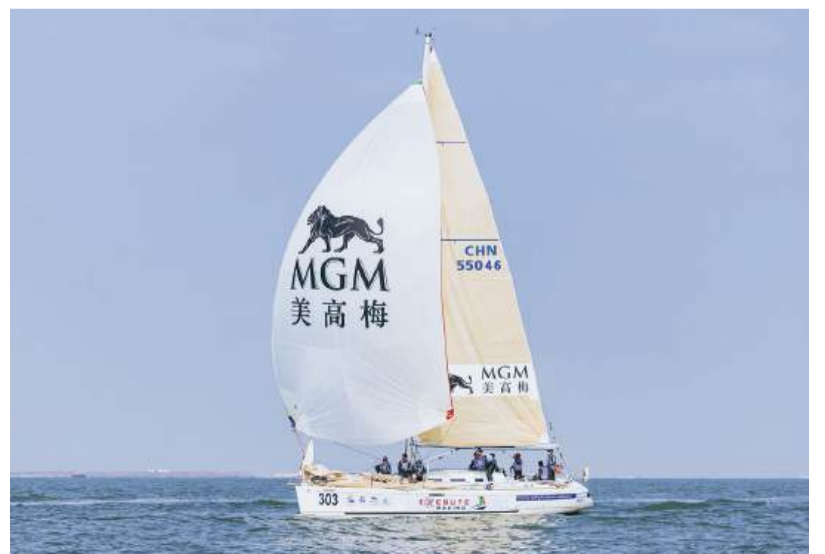
This undated handout photo provided by the Sports Bureau (ID) yesterday shows a team participating in a previous edition of the MGM Macao International Regatta.

More information can be found on www.macaoregatta.com or on the bureau's social media pages. ■