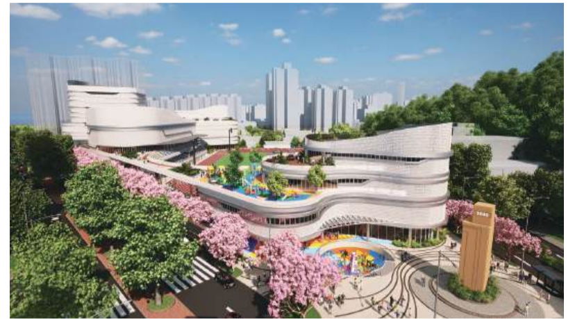
This artist's rendition released by the government last year shows the design of the future sports park in Fai Chi Kei.

The Lin Fong Sports Centre, next to the now-defunct greyhound racetrack, comprises a pavilion and a running track plus a football field. The pavilion situated at the area's southern tip includes various facilities such as swimming pools, table tennis tables, a gym, and areas