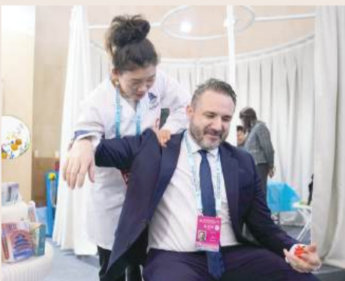
A British delegate tries out traditional Chinese medicine (TCM) therapy at the 2024 World Conference on Traditional Medicine in Beijing yesterday.

BEIJING – Vice Premier Liu Guozhong said yesterday that China is ready to work with the rest of the world to integrate traditional medicines into the global health system.