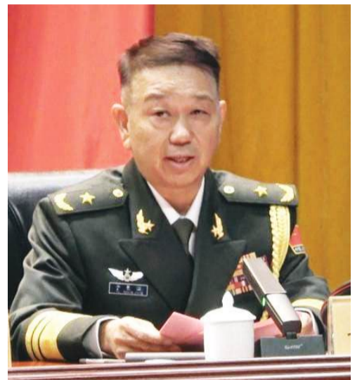
Chief Executive Ho Iat Seng (left), Director of the Liaison Office of the Central People's Government in the Macau Special Administrative Region (MSAR) Zheng Xincong (centre) and PLA Macau Garrison Commander Yu Changjiang address a celebratory event at the PLA garrison barracks in Taipa yesterday morning which marked the 25 th Anniversary of stationing of the garrison in Macau.

the troops have diligently adhered to the Basic Law, local laws and regulations, fulfilling their defence responsibilities in Macau, and that they have firmly shouldered the responsibility of protecting the nation's sovereignty, security, and development, and have consistently supported the chief executive and the MSAR government in governing according to law.