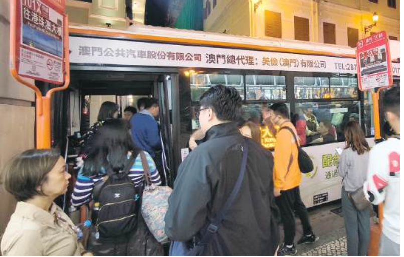
Passengers get on a No. 101X bus on Avenida de Almeida Ribeiro, the city's main thoroughfare, yesterday.

Meanwhile, Macau Pass released details about its newly