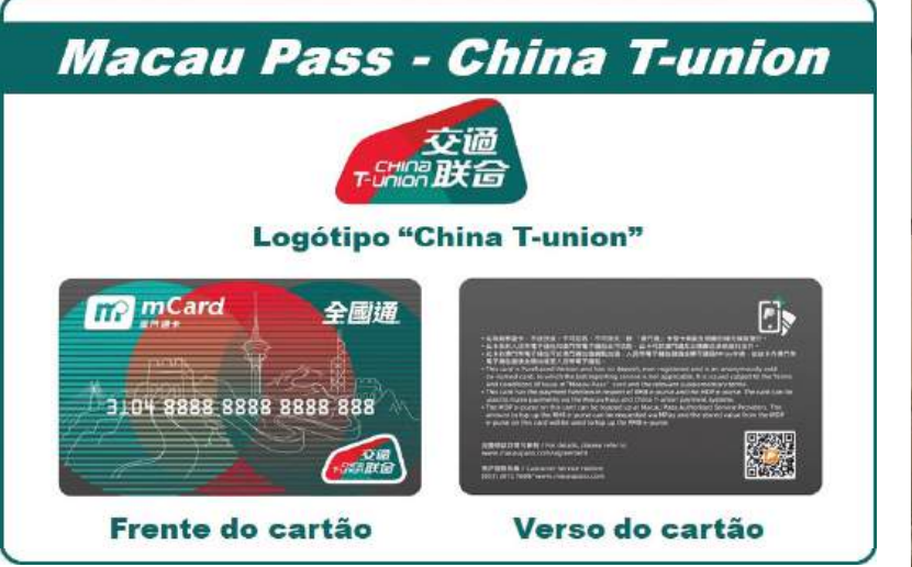
This image released by the Transport Bureau (DSAT) yesterday shows the front and back of the new Macau Pass – China T-Union mCard.

Hong Kong joined the China T-Union system earlier this year