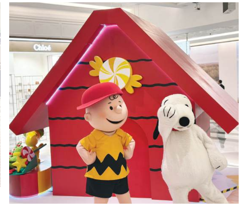
Charlie Brown and Snoopy, iconic characters from the Peanuts comic book, show up at Grand Lisboa Palace in Cotai yesterday.

earlier this year to respond to the lack of foreign language tour guides in Macau with text input enquiry functions, apart from traditional and simplified Chinese characters, also in English, Korean and Thai: "In fact, in our past practice, we have always allowed travel agencies to formally apply to the government to import tour guides speaking certain languages, but we have been very cautious in approving these applications".