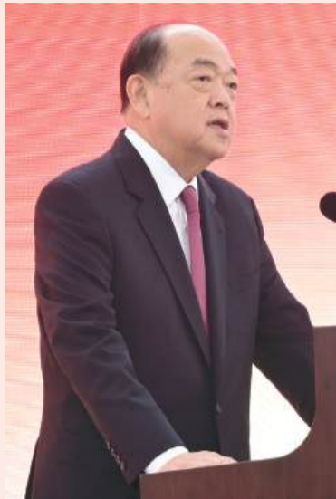
Chief Executive Ho Iat Seng delivers a speech during yesterday's groundbreaking ceremony.

The four new key industries listed by the Master Plan of the Development of the Guangdong-Macau In-depth Cooperation Zone in Hengqin, published in September 2021, and the Overall Development Plan for the Guangdong-Macau In-depth Cooperation Zone in Hengqin, published in December last year, are 1) scientific and technological research and high-end manufacturing industries, 2) Macau branded traditional Chinese