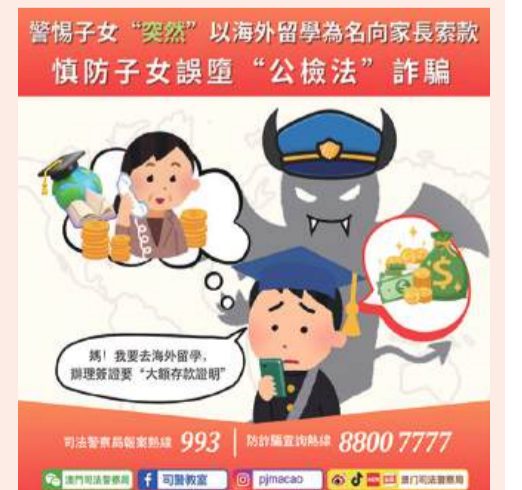
This poster released by the Judiciary Police (PJ) yesterday warns residents of a “deposit proof” scam involving “fake police calls”.

If they have any suspicions about certain financial matters involving their children studying abroad, parents are advised to use the PJ anti-fraud programme to check risk indices or call the police’s anti-fraud enquiry hotline on 8800 7777 or the reporting hotline 993 for assistance. ■