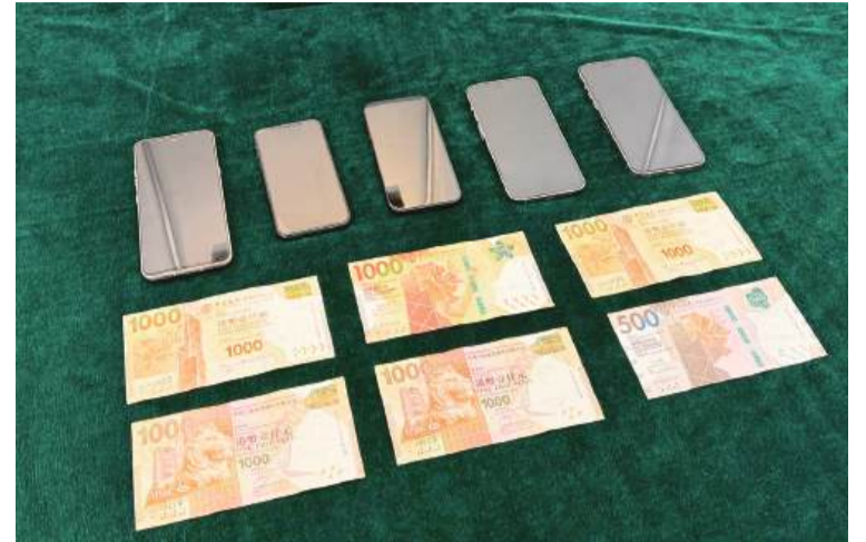
Evidence such as Hong Kong dollars in cash, smartphones is displayed at a PJ press conference room on Friday during a special press conference about the case.

However, Judiciary Police officers received another report on Thursday in which