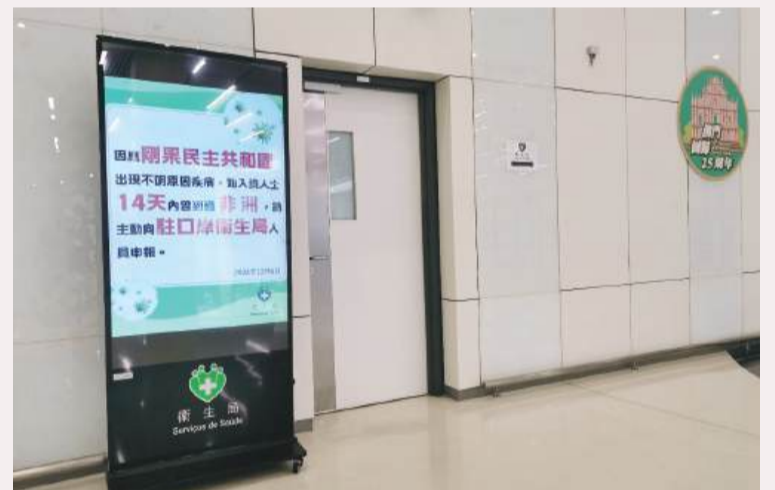
This photo provided by the Health Bureau (SSM) on Friday calls on residents who had travelled in Africa in the past 14 days to report to the bureau.

If travel is necessary, individuals should pay close attention to personal and food hygiene, wear masks in crowded places, and refrain from visiting local hospitals or coming into contact with sick individuals, the statement said, adding that upon returning to Macau, anyone experiencing discomfort should seek medical help promptly and provide a detailed travel history to their doctor. ■