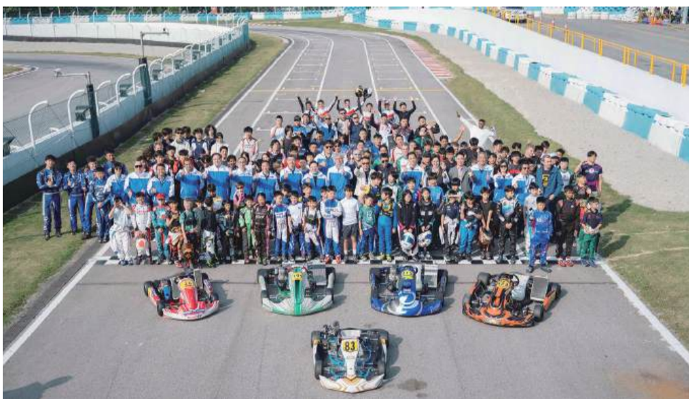
This handout photo taken and provided on Sunday by the Sports Bureau (ID) shows the participating drivers and guests posing at the Coloane Karting Track.