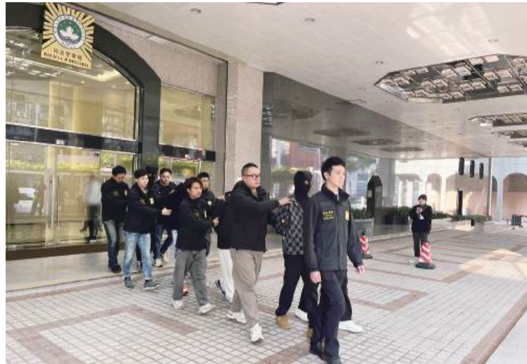
The four hooded mainland fraud suspects are escorted by Judiciary Police (PJ) officers to a PJ vehicle from the PJ headquarters in Zape.

The victim was also asked by one of the scammers to contact a wheelchair supplier in Hong Kong to assist the school in ordering 30