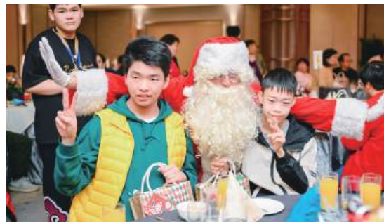
These photos taken on Saturday and recently provided by the Rotary Club of Macau show the “Joy to the World ‘Magic Xmas Garden’”, which featured performances from the co-organisers’ service users and Santa Clause interacting with participants, taking place at the Macau Tower Convention and Entertainment Centre.