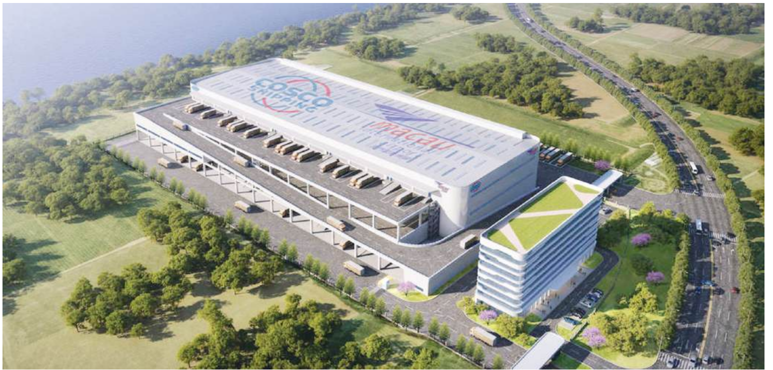
This artist's rendition released on Monday by local airport operator CAM shows its future upstream cargo terminal in Hengqin.

The upcoming upstream cargo terminal project will be developed by the joint venture