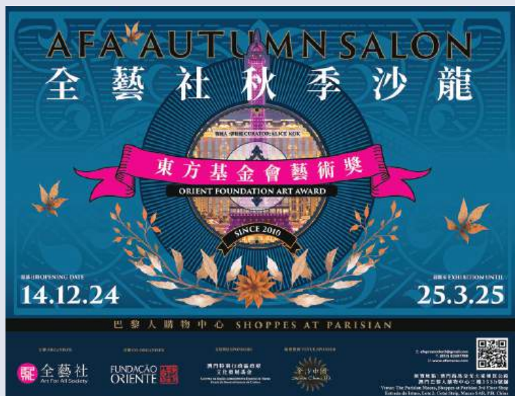
This poster provided by Sands China on behalf of the organisers promotes the "AFA Autumn Salon 2024".

The exhibition at The Parisian Macao will be on through March 25 next year. ■