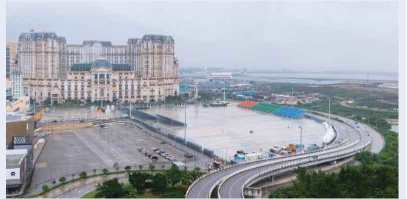
This undated handout photo downloaded from the Cultural Affairs Bureau's (IC) website yesterday shows the new Macau Open-Air Performance Venue in south-east Cotai.

28, in the run-up to the official commencement of the facility's trial operation period which will start on January 1. ■