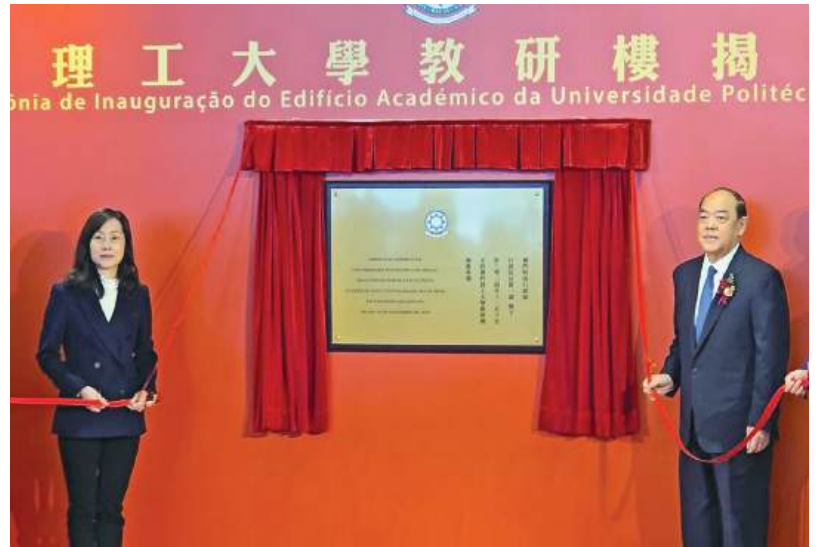
Chief Executive Ho Iat Seng (right) and Secretary for Social Affairs and Culture Elsie Ao Ieong U pose after unveiling the inauguration plaque of the MPU Academic Building in Zape yesterday.