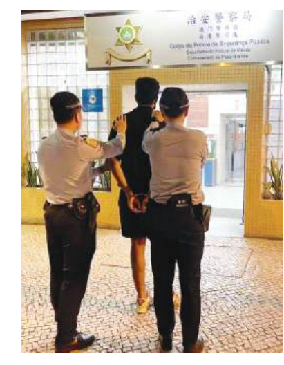
This undated handout photo provided by the Public Security Police (PSP) yesterday shows two PSP officers escorting the theft suspect to the police station in the Nam Van district.

The case has been transferred to the Public Prosecutions Office (MP), facing theft, drug abuse and possession of drug-taking paraphernalia charges. ■