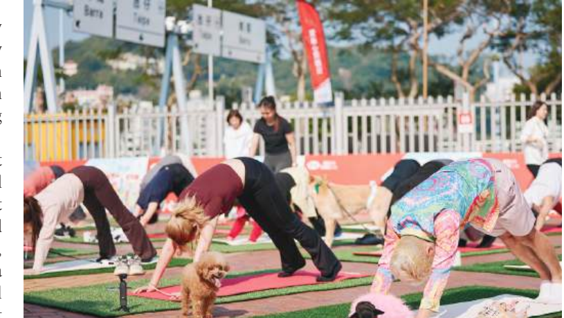
This handout photo taken last Saturday and provided by HSBC Life on Wednesday shows two- and four-legged "pet yoga" participants of the Furry "Pawsome" Day at the Macau Tower Convention and Entertainment Centre, which was part of the "HSBC Life presents: Living in Full Wellness Series".