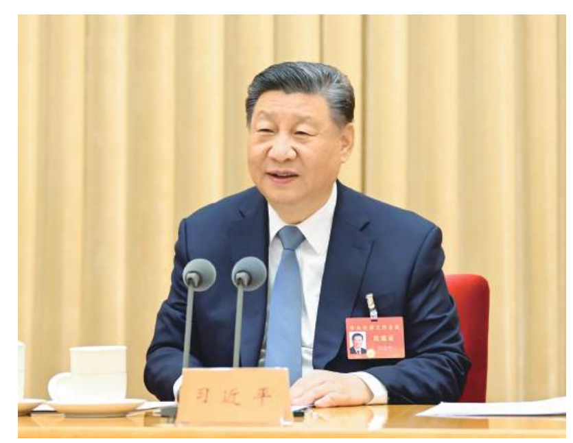
President Xi Jinping, general secretary of the Communist Party of China Central Committee, chairman of the Central Military Commission, delivers an important speech at the annual Central Economic Work Conference in Beijing. The two-day conference ended vesterday.

China should take steps to make scientific and technological innovation drive the development of new quality productive forces