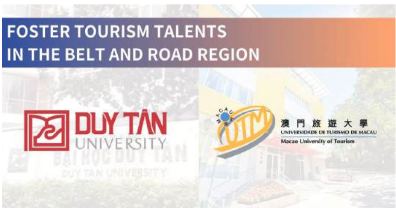
This image provided by the Macao University of Tourism (UTM) on Wednesday shows its official logo (right), alongside Vietnam's Duy Tan University (DTU).

Upon meeting the requirements, the statement said that the students