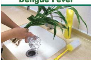
Vases or saucers under potted plants should be scrubbed, cleaned and have water changed at least once a week

MSARG Dengue Fever Prevention Working Group