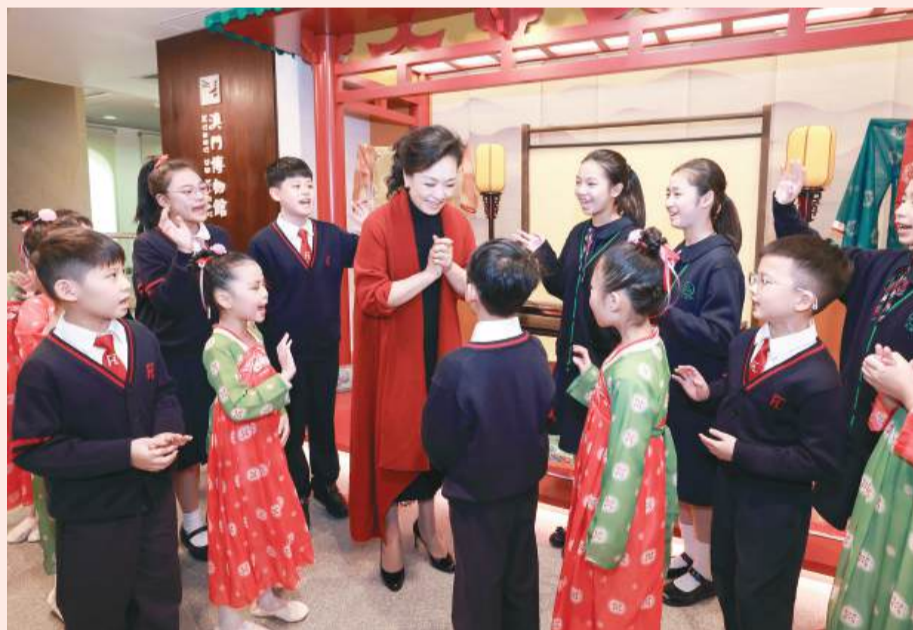
President Xi Jinping's wife, Peng Liyuan, talks with students who had just finished visiting the Macau Museum on Monte Fort yesterday morning.