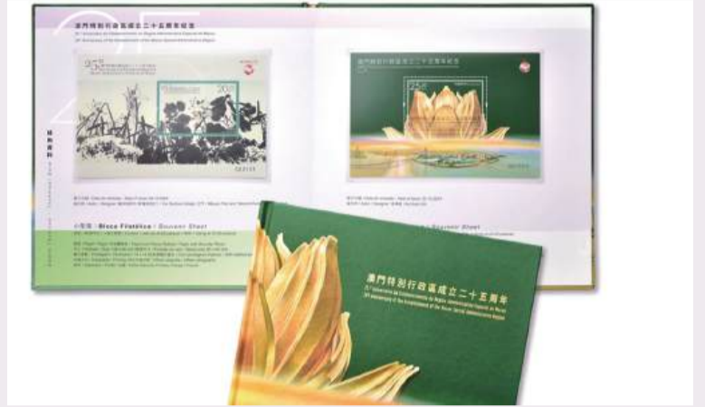
This handout photo released by the Post and Telecommunications Bureau (CTT) yesterday shows the thematic pack "25 th Anniversary of the Establishment of the Macao Special Administrative Region" that will be issued today.

at 330 patacas and will be available for sale at the Philatelic Shop of the General Post Office (GPO) and the Communications Museum from today, and the Rua do Campo (水坑尾) Post Office from December 26.