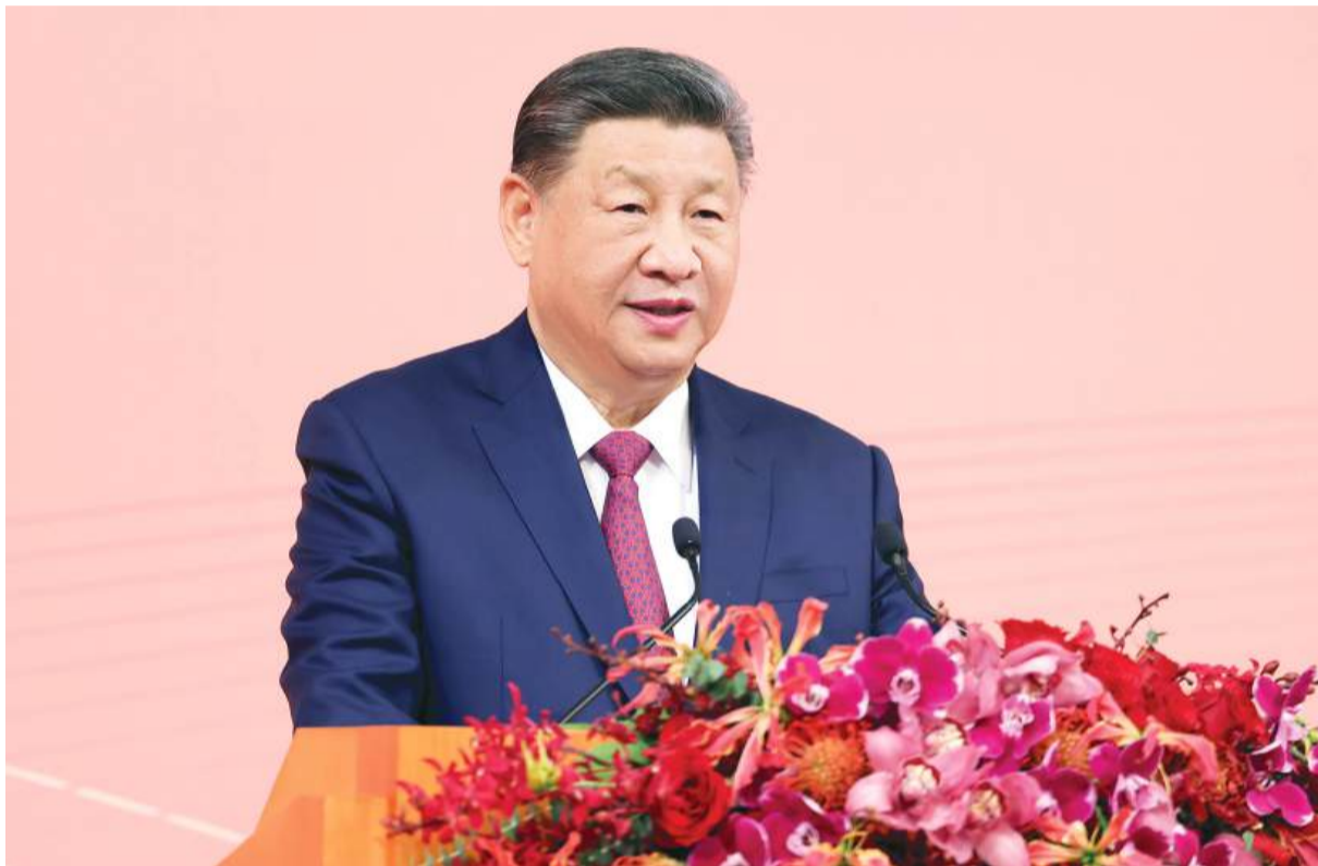
President Xi Jinping delivers a speech during yesterday evening's banquet hosted by the local government at the Macau East Asian Games Dome in Cotai.

Ho is succeeded by Sam Hou Fai today who alongside his principal officials and chief public prosecutor will be sworn in by Xi this morning.