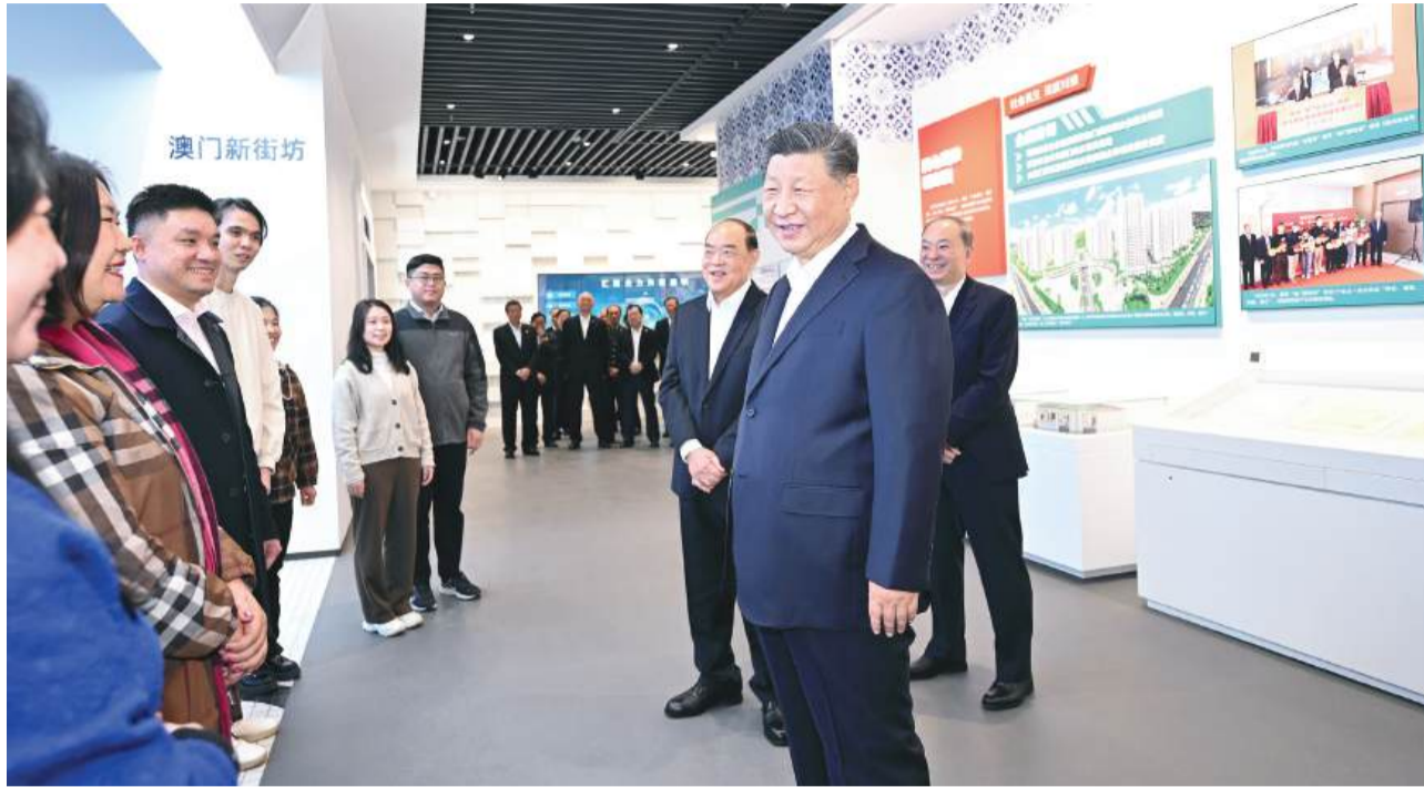
President Xi Jinping (center, front), also general secretary of the Communist Party of China (CPC) Central Committee and chairman of the Central Military Commission talks with Macau residents living in Hengqin during an inspection of the Guangdong-Macau In-Depth Cooperation Zone in Hengqin, yesterday. Xi, accompanied by Ho Iat Seng, the outgoing chief executive of the Macao Special Administrative Region (SAR), inspected the cooperation zone yesterday.

He was briefed on the joint initiative of Guangdong and Macau to build a high-level scientific and technological platform for traditional Chinese medicine (TCM). The