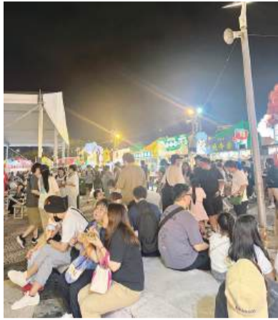
This photo taken last month shows locals and tourists at the annual Macao Food Festival in Sai Van Lake Square.

Analysed by checkpoints, the number of visitor arrivals by land grew by 10.3 percent year-on-year to 2,268,471 in November, among whom 48.5 percent arrived through the Border Gate checkpoint (1,101,007), 33.1 percent came via the Hong Kong-Zhuhai-Macao