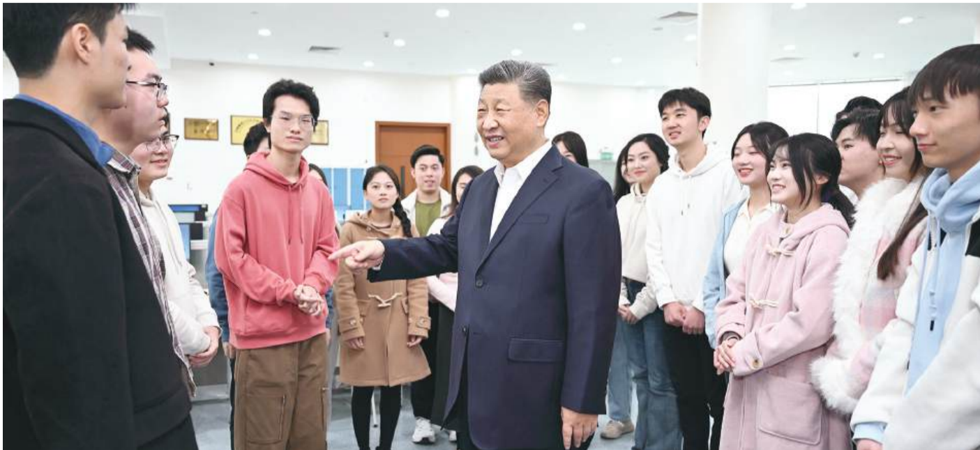
President Xi Jinping (center), also general secretary of the Communist Party of China Central Committee and chairman of the Central Military Commission, talks with students in the library of Macau University of Science and Technology (MUST) in Taipa yesterday.

President Xi Jinping visited the Macau University of Science and Technology (MUST) yesterday morning.