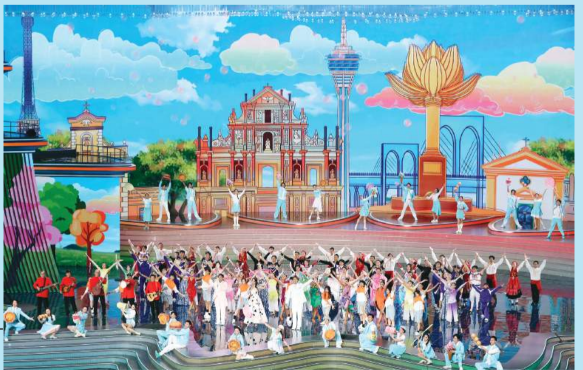
Singers, dancers and musicians perform during last night's gala show at the Macau East Asian Games Dome.

Macau's most popular English-language newspaper - Your trustworthy source of news & views