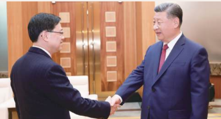
President Xi Jinping (right) shakes hands with HK Chief Executive John Lee Ka-chiu in Macau yesterday.

President Xi Jinping yesterday urged Hong Kong and Macau to strive for greater accomplishments and achieve better development, as the practice of "One Country, Two Systems" has entered a new stage.