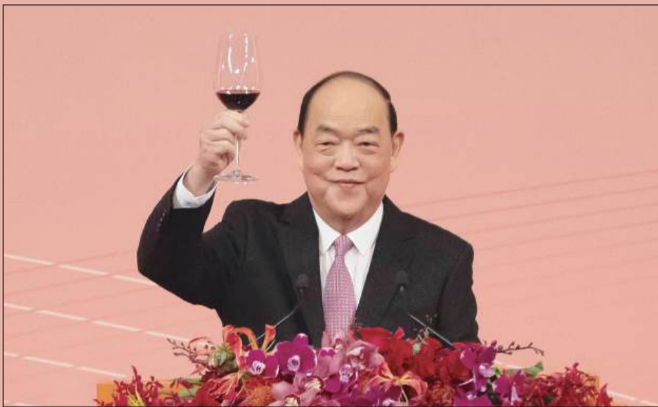
Outgoing Macao Chief Executive Ho Iat Seng offers a toast during a gala banquet on the eve of celebrations for the 25 th Anniversary of Macao's return to the motherland, at the East Asian Games Dome in Cotai yesterday evening.