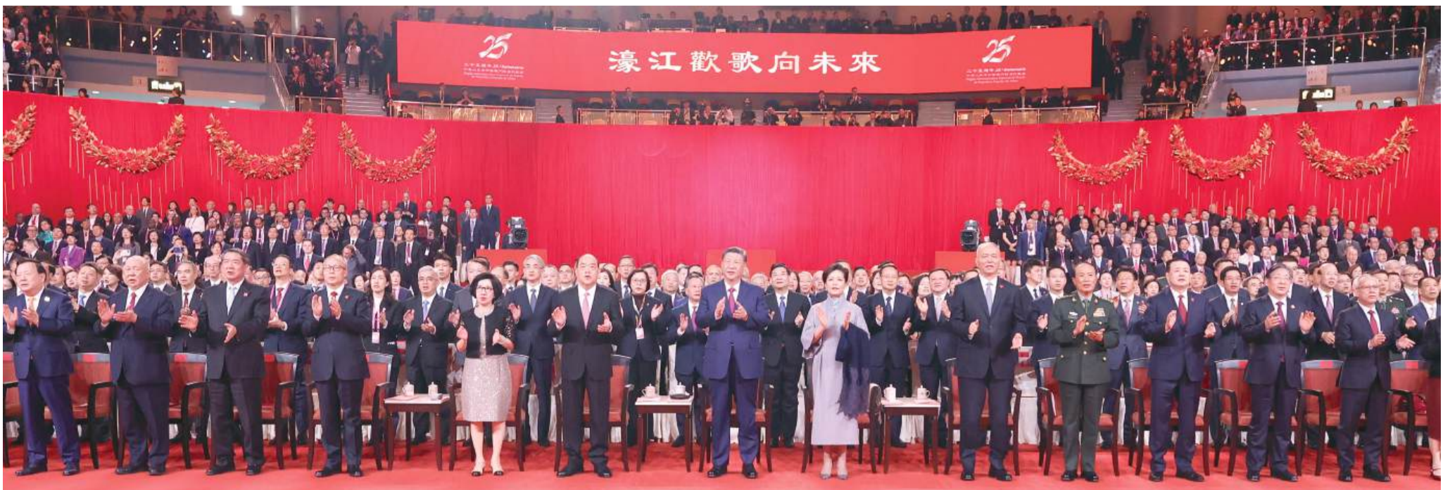
President Xi Jinping (center, front) joins the audience in singing "Ode to the Motherland" at the end of a gala marking the 25 th Anniversary of Macao's return to the motherland at the Macao East Asian Games Dome in Cotai last night.

President Xi Jinping gestures during a welcoming dinner at the East Asian Games Dome in Cotai on the eve of celebrations for the 25 th anniversary of China's resumption of its exercise of sovereignty over Macau. Portugal handed its temporary administration back to China at midnight on December 19, 1999, resulting in the establishment of the Macau Special Administrative Region (MSAR) on December 20, 1999.