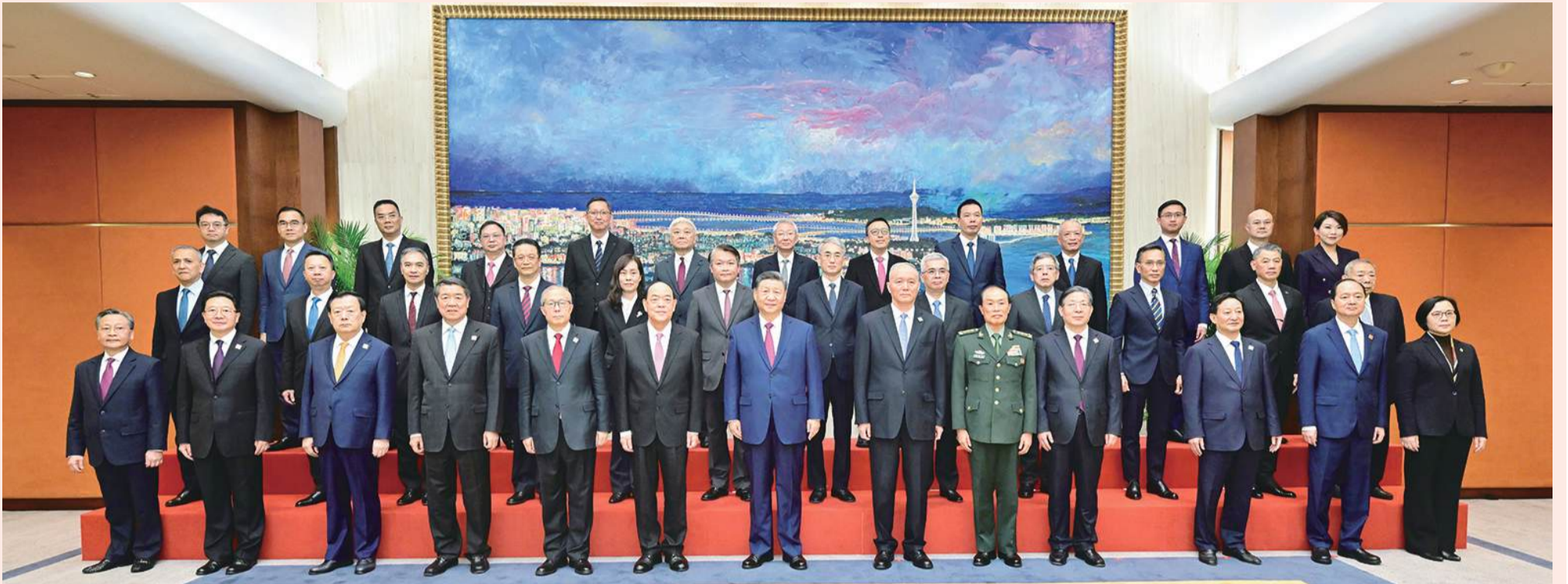
President Xi Jinping (front, centre) poses for group photos with officials of the executive, legislative and judicial organs of the Macao Special Administrative Region (SAR) yesterday on the sidelines of their meeting.

President Xi Jinping said yesterday that the executive, legislative and judicial organs of the Macao Special Administrative Region (SAR) have comprehensively, accurately and unwaveringly implemented the “One Country, Two Systems” policy.