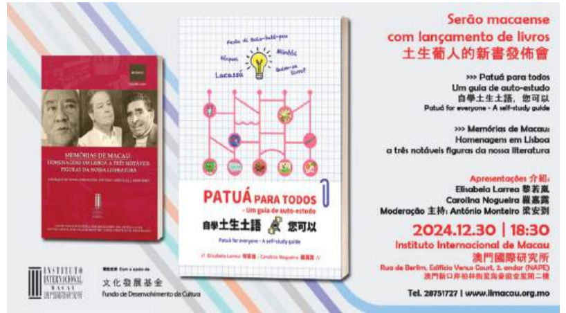
This poster recently provided by the International Institute of Macau (IIM) promotes the upcoming launch of "Patuá for everyone – A self-study guide" (right) and "Memories of Macau: Homage in Lisbon to three notable figures of our literature".

"Unchinho di Língua Maquista" is Patuá for "A Bit of the Macanese Language".