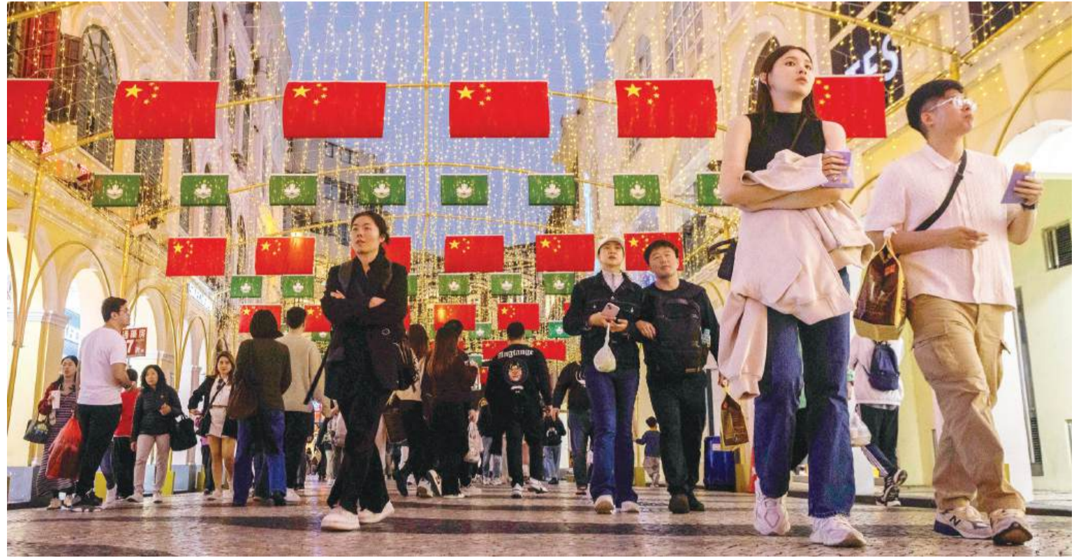
Pedestrians walk underneath national and regional flags displayed at the city's main square, Largo do Senado ("Senate Square") last week. The PRC and MSAR flags symbolise the most fundamental principle for the existence of the Macao Special Administrative Region – the "One Country, Two Systems" policy. The MSAR celebrates the 25 th Anniversary of its establishment today.

Social stability has been maintained in Macao, and its per capita GDP is among the highest in Asia. It has a high Human Development Index and the world's second-highest life expectancy (after Hong Kong). According to the World Bank, life expectancy