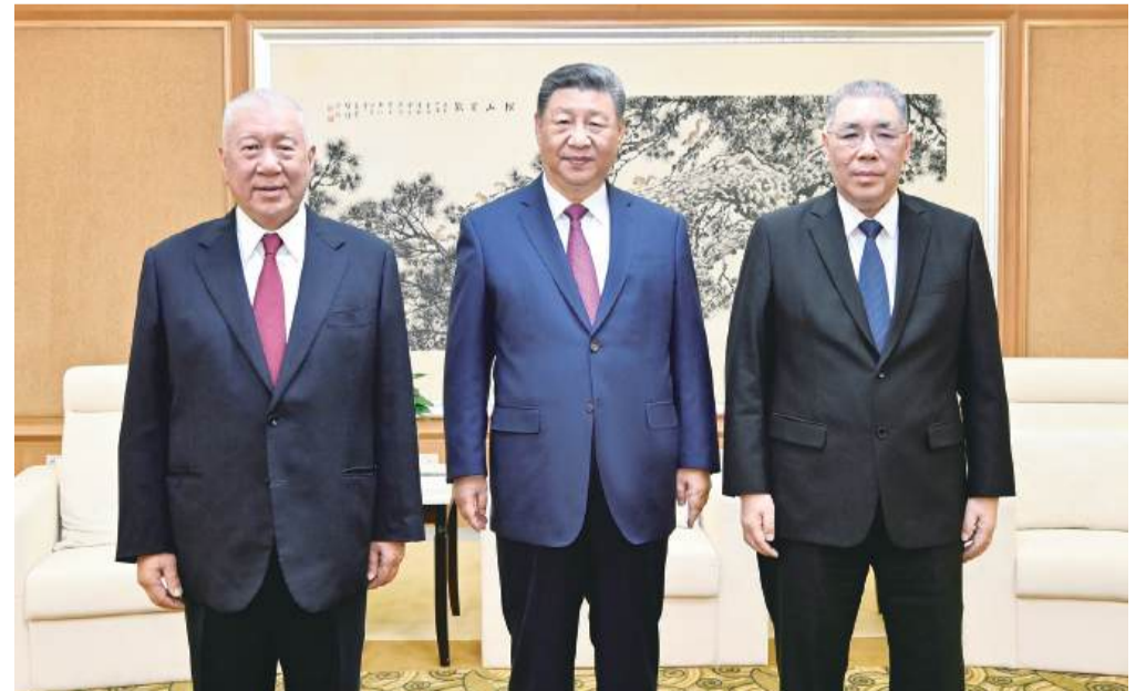
President Xi Jinping (center) poses with Edmund Ho Hau Wah (left) and Fernando Chui Sai On, former chief executives of the Macao Special Administrative Region (SAR) during a meeting at the “New Bamboo Mansion” guesthouse on Penha Hill yesterday.

Senior officials including Cai Qi and Xia Baolong were present at the meeting.