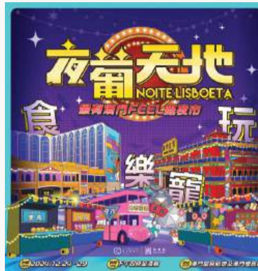
This poster provided by Lisboaeta Macau yesterday promotes the upcoming "Noite Lisboaeta – the Night Market with the Most Macanese".

night market also aims to leverage "the synergies of the 'Macao Outdoor Performance Venue', stimulating community economic development and immersing visitors in a distinctive blend of traditional culture and modern innovation, showcasing the essence of Macanese and Portuguese inspired culture, further enhancing Macau's night economy".