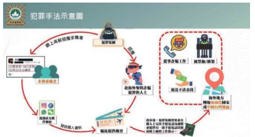
This graphic provided by the Judiciary Police (PJ) in a press conference on Friday explains the fraudster's modus operandi.

The spokesperson said that PJ officers are urging residents to look for jobs in legal employment agencies and to avoid giving personal information to strangers, and refuse to assist in receiving and transporting unidentified money, and do not trust the network or strangers' recruitment messages. ■