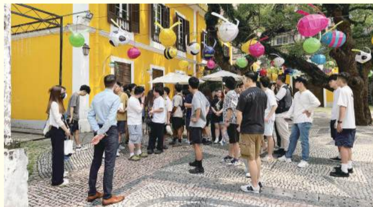
shows students standing outside the ALBERGUE 1601 Restaurant operated by Portuguese Restaurants & Retail Concepts (PRRC) in the São Lázaro district.