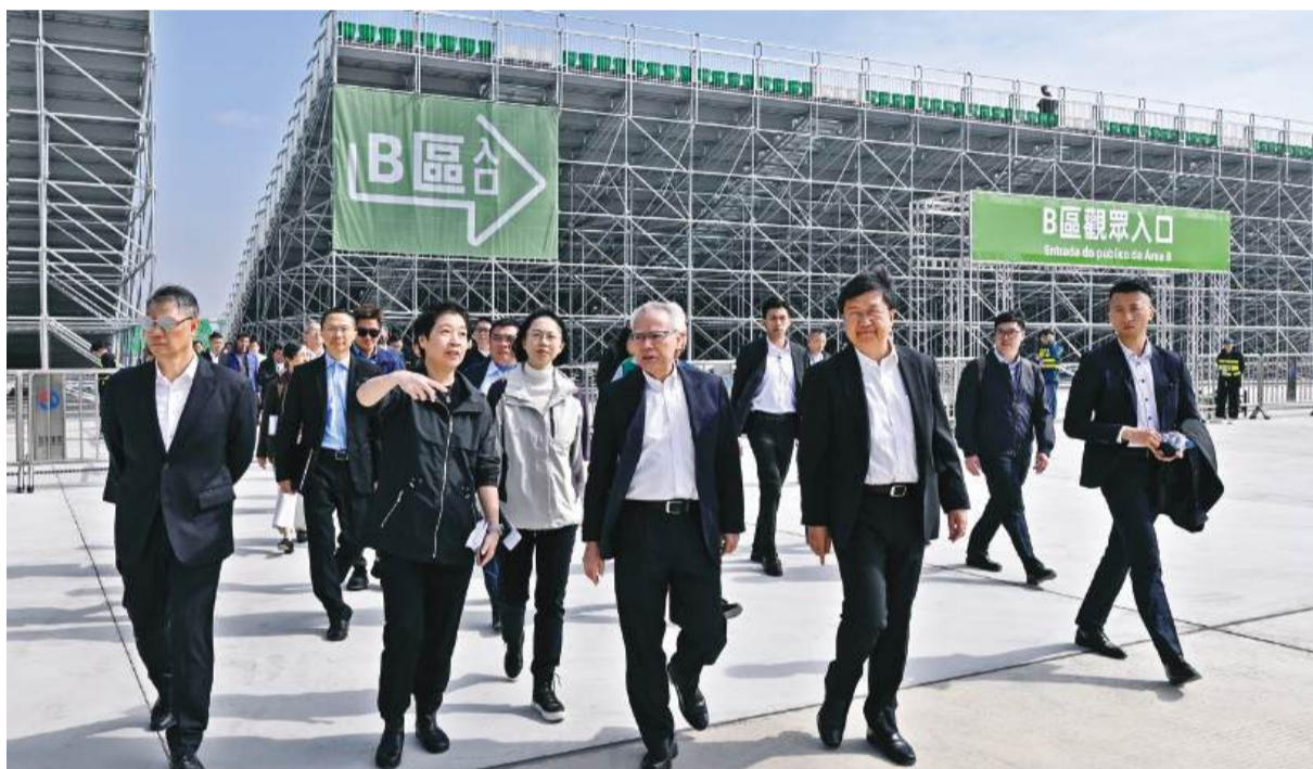
Chief Executive Sam Hou Fai (centre) pays a visit on Thursday last week to the government's newly-built Macau Open-Air Performance Venue in Cotai, before the facility's first trial concert was held on Saturday, which drew around 11,000 spectators.

According to the statement, Sam ordered members of his team