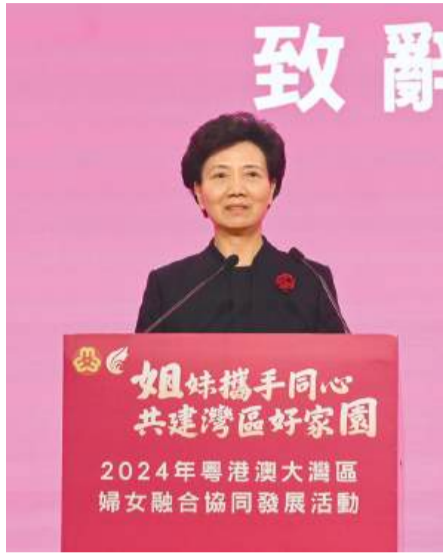
State Councillor Shen Yiqin, who also chairs the All-China Women's Federation (ACWF), delivers a speech during yesterday's opening ceremony of a one-day conference on promoting women's development in GBA, at Macau Tower.

In her speech, according to the statement, Shen pointed out that President Xi Jinping has noted that women are important drivers of human civilisation and social progress, achieving extraordinary accomplishments in various fields. For many years, Shen said, women and women's organisations in the GBA have kept Xi's instructions in mind, engaging in practical exchanges across