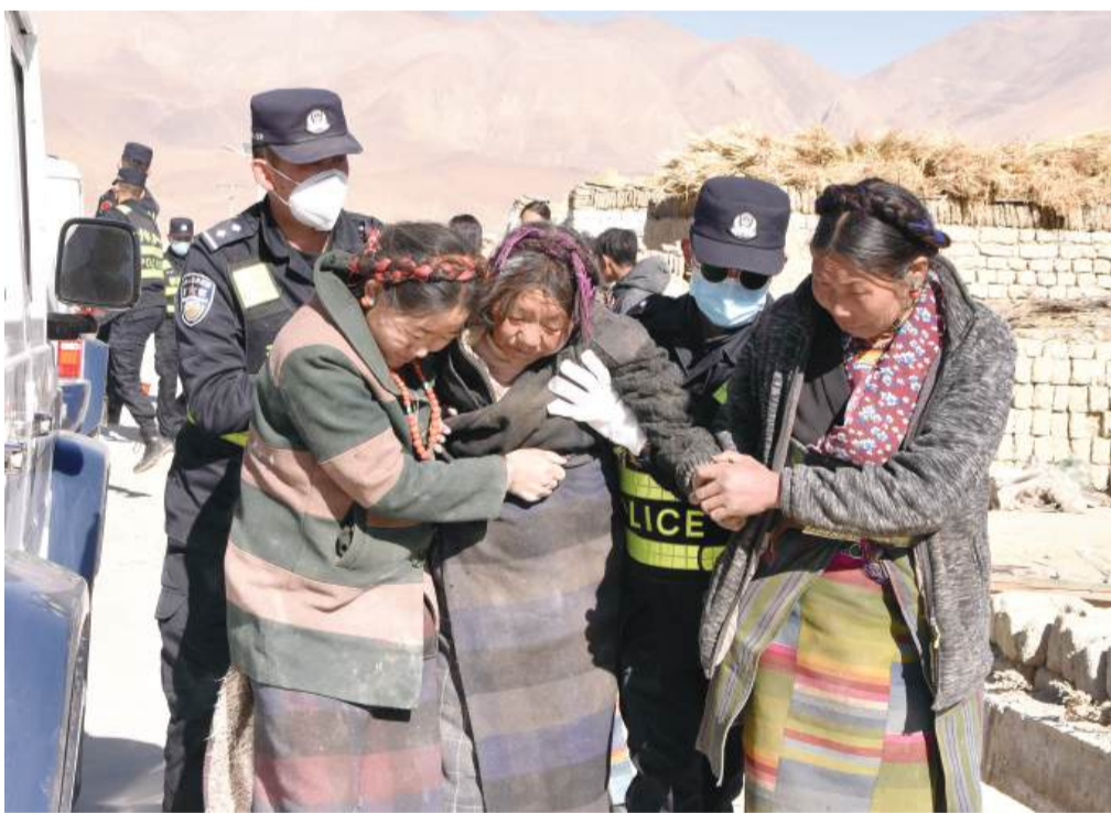
Rescuers transfer the injured at Zhacun Village of Dingri County in Xigaze, Xizang Autonomous Region, yesterday. A total of 126 people have been confirmed dead and 188 others injured, after a 6.8-magnitude earthquake jolted the region at 9:05 a.m. yesterday. (More on p.7)

The press conference also noted that the current waste treatment capacity of the city’s incinerator is 3,000 tonnes per day, which was sufficient for waste treatment over the next 30 years. ■