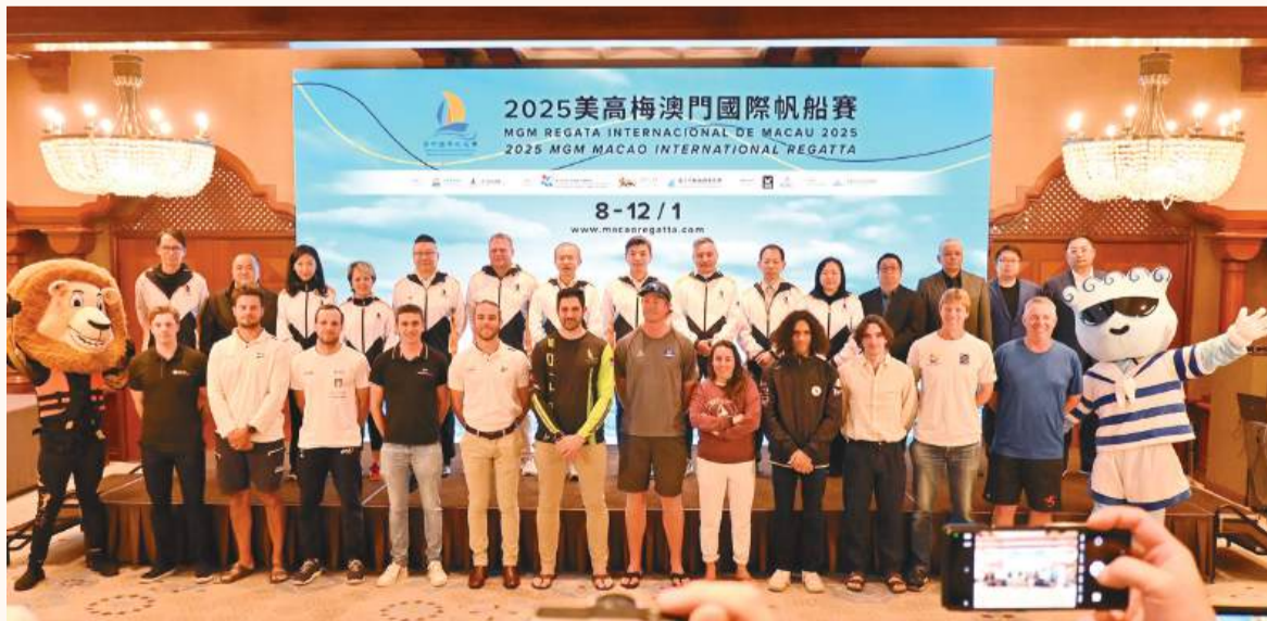
Guests and competing sailors pose for a group photo during yesterday's press conference at Artyzen Grand Lapa Macau hotel in Nape.

More details are available on the bureau's social media pages or by visiting www.macaoregatta.com . ■