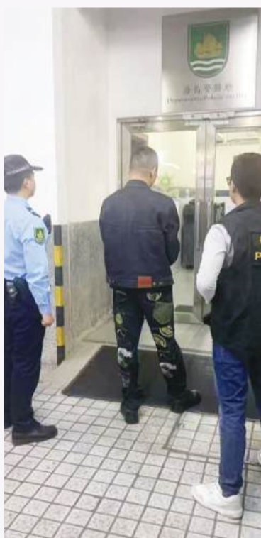
This undated photo provided by the Public Security Police (PSP) yesterday shows PSP officers escorting the mainland theft-by-finding suspect to a police station in Taipa.

The two suspects have been transferred to the Public Prosecutions Office (MP), facing theft-by-finding charges, Kong said. ■