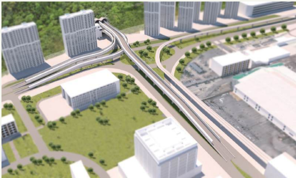
The artist's rendition downloaded from the Public Works Bureau's (DSOP) website yesterday shows the future Big Taipa Hill Tunnel's flyovers on its south side.

The bureau announced the five companies with the highest scores in the Official Gazette (BO) on