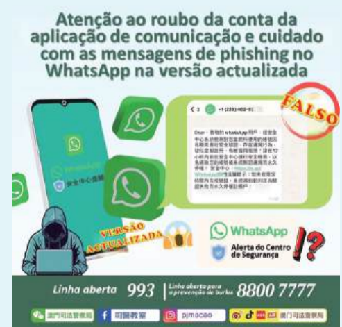
This poster provided by the Judiciary Police (PJ) yesterday shows details about the scam messages.

The bureau clarified that it has nothing to do with such calls and that they will be reported to the police for further investigation, the statement said, urging members of the public, businesspeople in particular, to remain highly vigilant, and to doublecheck any messages appearing to have been sent by the bureau, in order to prevent fraud. ■