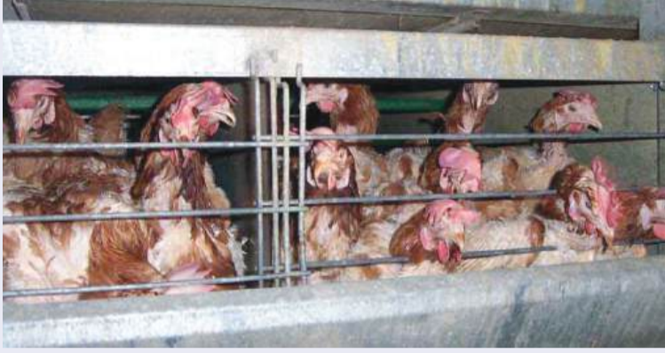
This undated file photo show hens in battery cages.