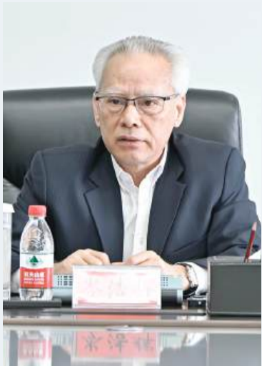
This file photo taken last Thursday shows Chief Executive Sam Hou Fai posing during his inspection visit to the Guangdong-Macau In-Depth Cooperation Zone in Hengqin.

The statement listed the members of the delegation as Secretary for Administration