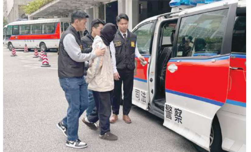
The 19-year-old suspect is being escorted by Judiciary Police (PJ) officers to a PJ vehicle outside the PJ headquarters in Zape yesterday.