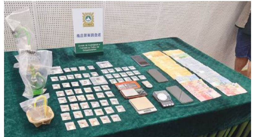
Evidence seized from the three drug suspects including drugs, electronic scales and drug-taking paraphernalia is shown during yesterday's special press conference at the Judiciary Police (PJ) headquarters.