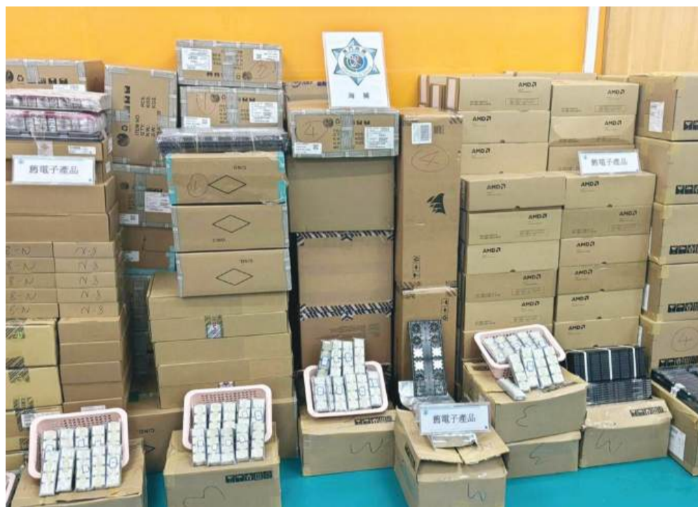
Boxes of old computer parts and other electronic products are displayed by the Macau Customs Service in the raided parallel-trading den at Keck Seng Industrial Centre on Avenida de Venceslau de Morais last night.

The den was located at Keck Seng Industrial Centre (激成工業中心) on Avenida