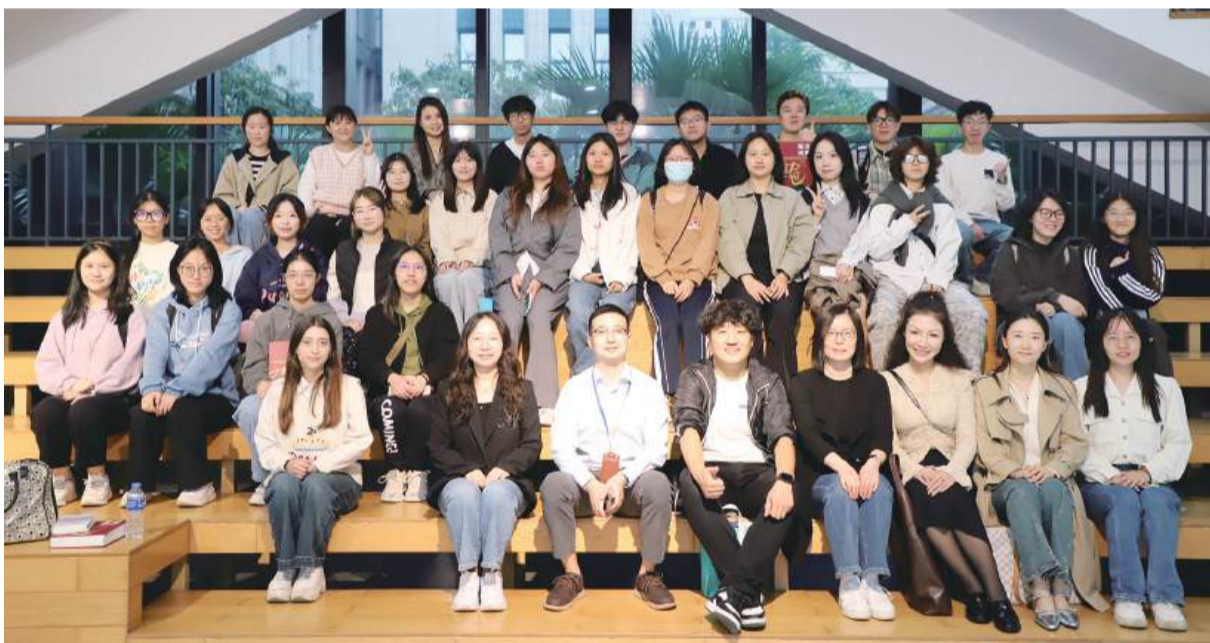
This undated handout photo provided by the public University of Macau (UM) shows the contestants and their supervisors.