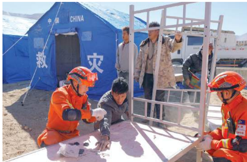
Rescuers assemble beds for quake-affected residents at a resettlement site in a village in Dingri County in Xigaze City, Xizang Autonomous Region, yesterday.

In response to the deadly temblor, Xi Jinping, general secretary of the CPC Central Committee and president of the People's Republic of China (PRC), stressed on Tuesday that he attached great importance to the matter