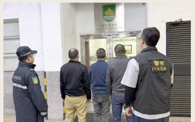
This undated photo provided by the Public Security Police (PSP) yesterday shows PSP officers escorting the mainland theft suspects to a police station in Taipa.