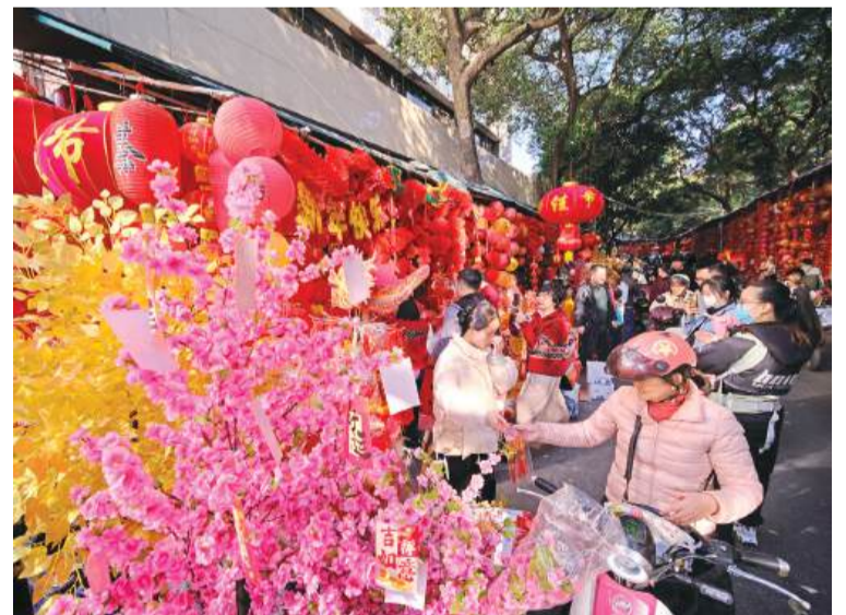
Shoppers browse for Chinese Lunar New Year decorations at a fair in Nanning, capital of the southern Guangxi Zhuang Autonomous Region, yesterday. — Xinhua

The synthesis process of m-Li 2 ZrF 6 nanoparticles is simple and scalable, providing a solution for the widespread application of lithium metal batteries. — Xinhua