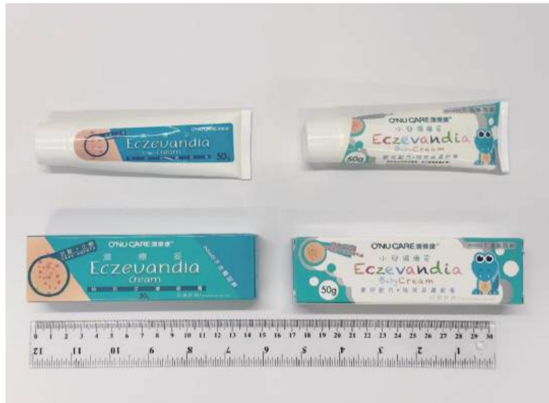
This undated handout photo provided by the Pharmaceutical Supervision and Administration Bureau (ISAF) on Friday shows two topical ointment products that were found to contain unapproved pharmaceutical ingredients Mometasone furoate and Miconazole.

Mometasone furoate can cause a range of side effects, including high blood pressure, elevated