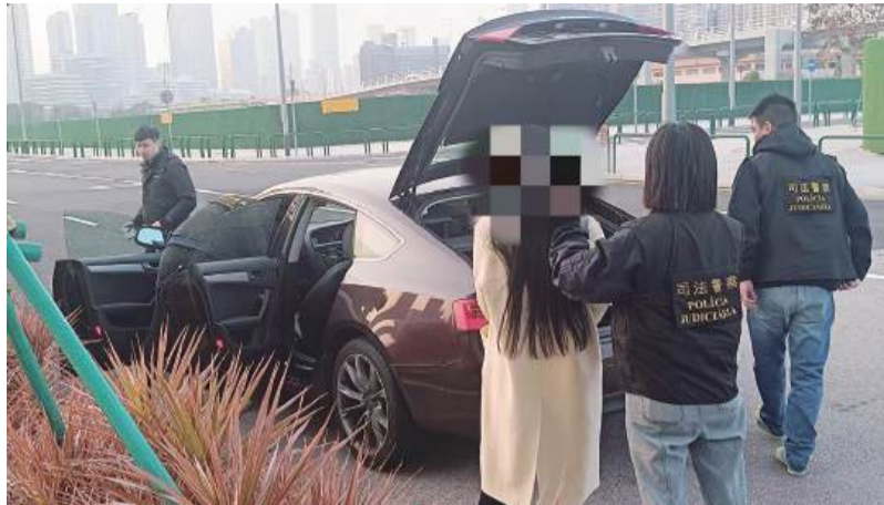
This undated pixelated handout photo provided by the Judiciary Police (PJ) on Friday shows PJ officers escorting the female suspect from the mainland in Cotai.