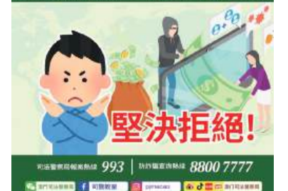
This poster released by the Judiciary Police (PJ) on Friday warns residents of "overseas job" scams colloquially known as "KK Park".