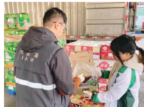
Two Municipal Affairs Bureau (IAM) inspectors check foreign fruit re-exported by the mainland to Macau, upon their delivery to here on Friday.

The statement said that with the signing of the agreement, Guangdong and Macau have jointly established a liaison mechanism for ensuring the implementation of the mainland's re-export of fruit to Macau. The statement said that through meetings, exchanges and joint assessments between both sides, their respective regulatory resources can be integrated to strengthen supervisory cooperation on product packaging, transportation, and documentation, enabling fruit imported from foreign countries into the mainland that have passed its inspection and quarantine procedures to be supplied to Macau. ■