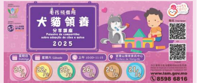
This poster provided by the Municipal Affairs Bureau (IAM) on Friday promotes the upcoming "Sharing Talk on Adoption of Dogs and Cats".

Meanwhile, the statement said that one can follow the "Pet Preparatory Class" Facebook and Instagram pages, which promote the "Trap, Neuter and Adopt" (TNA) model and find long-term care for stray animals, while photos and videos of animals up for adoption are posted daily on dedicated webpages, along with common adoption terms and knowledge about veterinary care of cats and dogs. ■