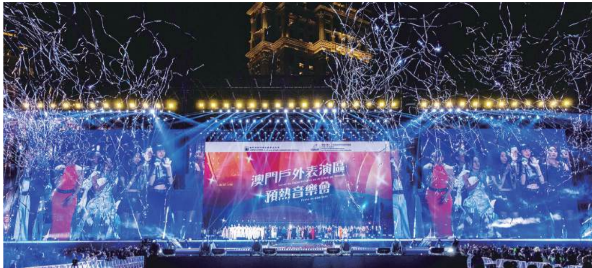
This handout photo provided by the bureau shows the trial concert held at the open-air performance venue in Cotai on December 28.