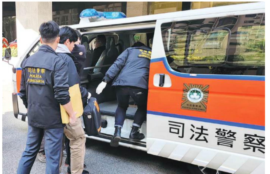
Judiciary Police (PJ) officers escort the hooded Russian drug smuggling suspect to a PJ vehicle outside their headquarters in Zape after yesterday's special press conference about his case.

Macau's prison term for drug traffickers ranges from six to 16 years, according to Law No.10/2016. ■