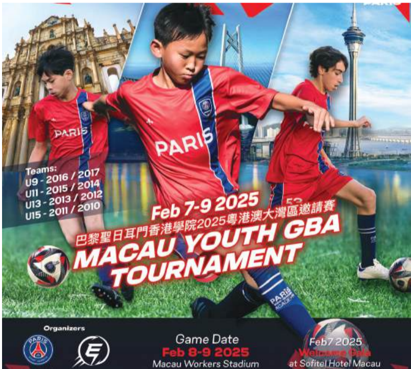
This poster provided by the Paris Saint-Germain (PSG) Academy Hong Kong & Macau shows details of its Macau Youth GBA Tournament slated for next month.