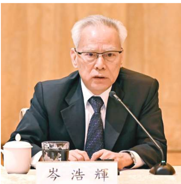
This handout photo released by the Government Information Bureau (GCS) last night shows Chief Executive Sam Hou Fai addressing yesterday's meeting with representatives from several community associations.