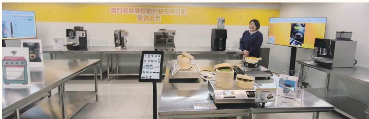
A representative shows reporters samples of smart kitchen equipment at the CPTTM Fashion Lab after yesterday's press conference.

The Hang Seng China Enterprises Index dipped 0.79 percent to end at 6,843.71 points, while the Hang Seng Tech Index dropped 0.91 percent to end at 4,221.92 points. – Xinhua