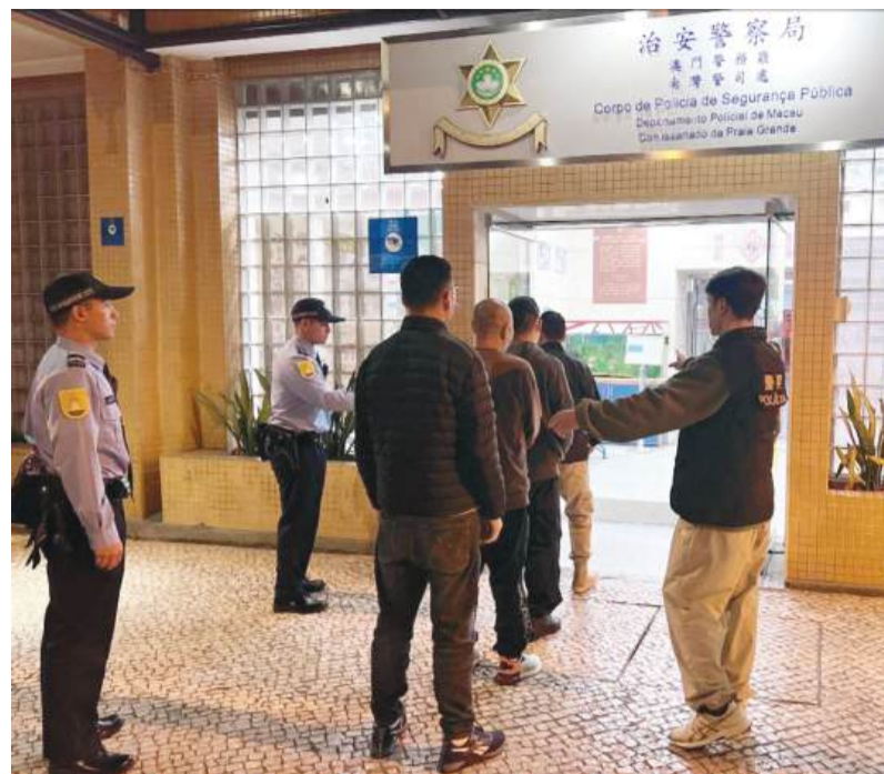
This undated photo provided by the Public Security Police (PSP) yesterday shows PSP officers escorting the four Mongolian theft suspects to a police station.

The four suspects were transferred to the Public Prosecutions Office (MP) last Wednesday, facing a charge of aggravated theft, while one of them faces additional charges of drug use and possession of drug-taking paraphernalia. ■