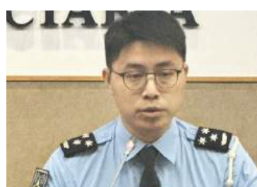
A Public Security Police (PSP) spokesperson reports during yesterday's regular press conference at the Judiciary Police (PJ) headquarters.

According to the spokesperson, the three staff members suffered bruises on the chest and contusions on their hands, but were conscious and in stable condition when they were taken to hospital for outpatient treatment. ■