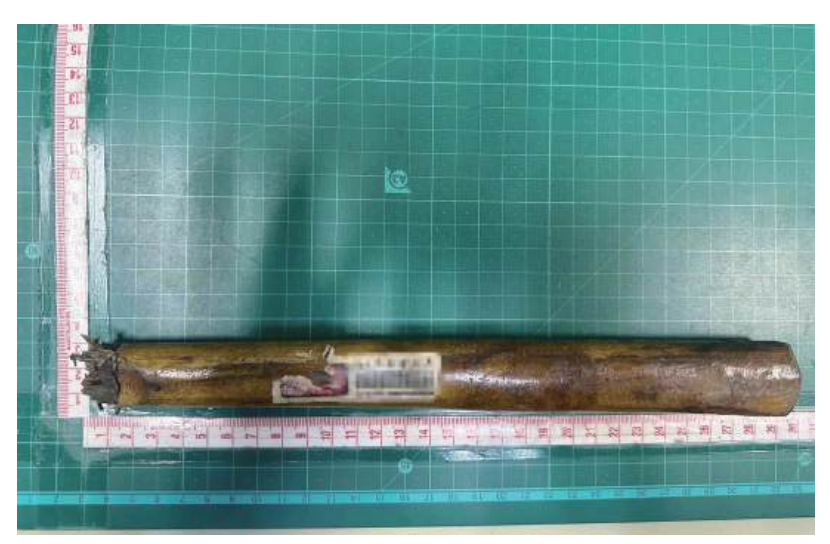
These two undated handout photos provided by the Public Security Police (PSP) yesterday show the broken hammer.