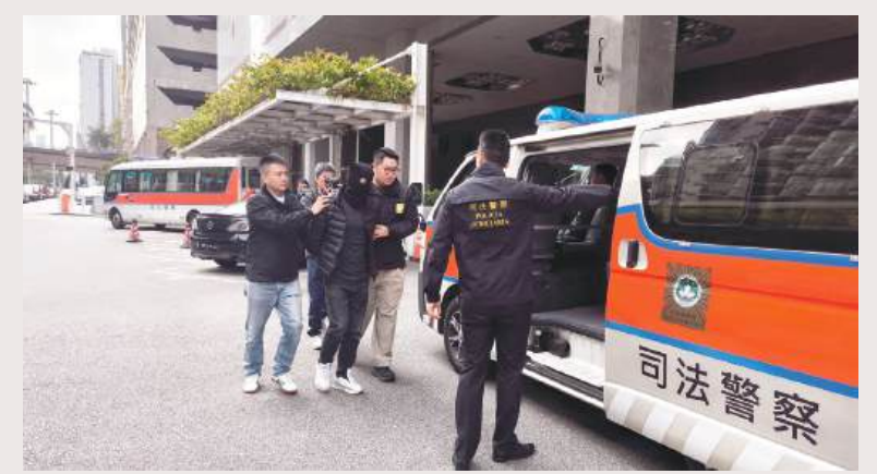
Judiciary Police (PJ) officers escort the hooded robbery suspect arrested in Macau to a PJ van outside the PJ headquarters in Zape yesterday.