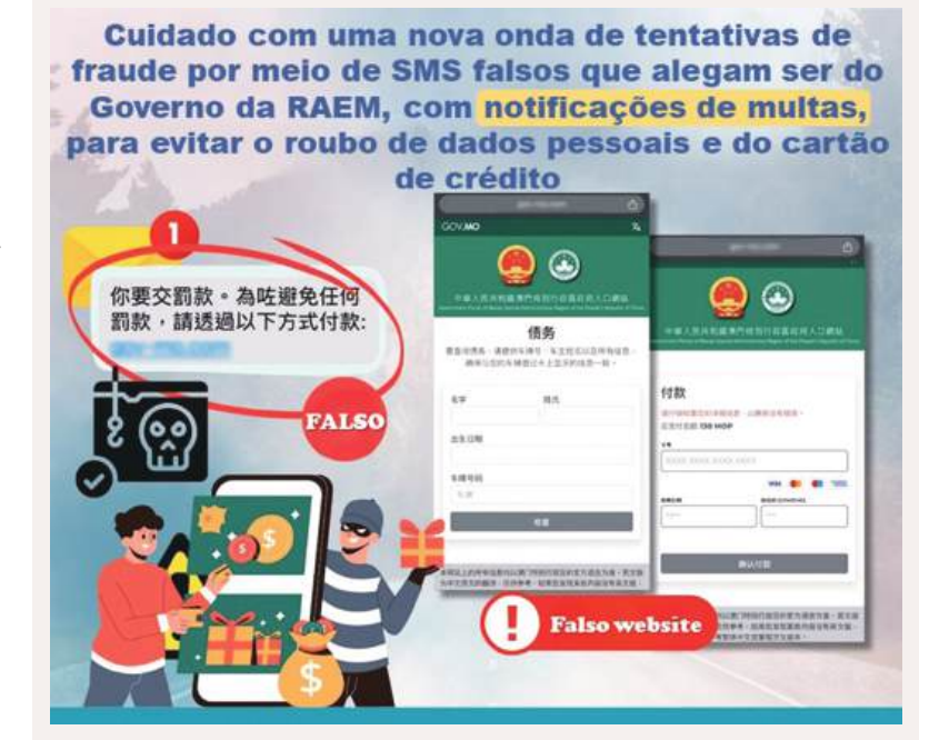
This poster provided by the Judiciary Police (PJ) yesterday warns members of the public of the fake "pay fines for 'traffic offences'" phishing SMS.

The statement pointed out that if there are doubts about the authenticity of an SMS, one can call the actual entities to verify it, while those suspecting they have been scammed should immediately call the Judiciary Police's Anti-Fraud hotline on 8800 7777 or the crime report hotline on 993.