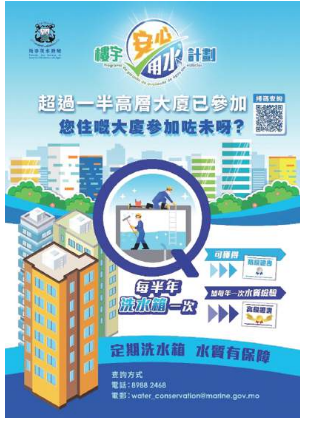
This poster provided by the Marine and Water Bureau (DSAMA) yesterday promotes its "Safe Water Use in Buildings" programme.

Meanwhile, in order to deepen students' understanding of water resource management, the bureau has recently organised a field trip for 126 students and teachers to the Sha Tin Sewage Treatment Works in Hong Kong.