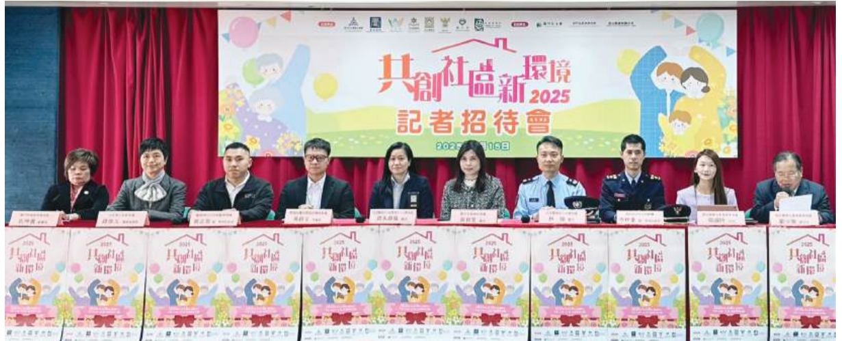
Representatives of the co-organisers of this Saturday's "Jointly Creating a New Environment for the Community" carnival pose during yesterday's press conference at the Kai Fong headquarters in Toi San district.