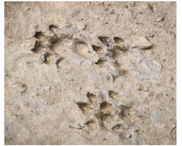
This undated file photo taken by the “Chief of Macau Ecology” Facebook group shows footprints of a Eurasian otter discovered along Macau’s coastline.

otter belongs to the genus Otter of the Weasel family of the order Carnivora, which is the most widely distributed otter species in the world, and is one of the three species of otter in China. It belongs to the second level of the national wildlife protection, and is rated as Endangered (EN) in the Red List of China’s Biodiversity: Vertebrates. The post highlighted the fact that Eurasian otters used to be found almost everywhere in China, the population of which, however, declined “precipitously” due to the massive hunting and killing of the animals for the fur trade in the 1950s-80s and the loss of their habitat.