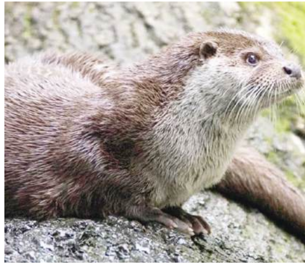
This undated file photo shows a Eurasian otter.