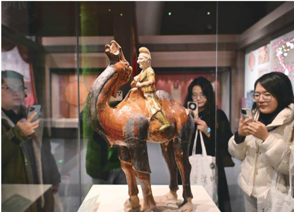
Exhibitiongoers take photos of a tri-colored glazed pottery work, which depicts a nomadic camel rider, at the National Maritime Museum of China in the northern municipality of Tianjin, yesterday. An exhibition featuring the highlights of Tang Dynasty (618-907 AD) cultural relics in Shaanxi Province kicked off at the museum yesterday. The exhibition brings together about 120 pieces (sets) of cultural relics from eight cultural institutions across Shaanxi Province.

GEG is the second integrated resort operator to announce a wage hike for staff after Sands China, which made its announcement late last month and will be effective from March 1. ■