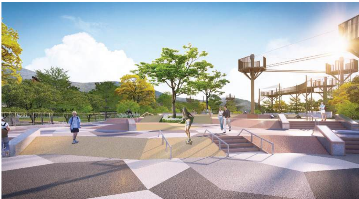
This artist's rendition provided by the Municipal Affairs Bureau (IAM) shows an area for adventure sport including a skatepark in the future youth adventure camp near Coloane's Hac Sa Beach.

In his written interpellation, Lei pointed out that the bureau was aiming in late 2023 to complete the final design of its youth adventure camp project, covering 100,000 square metres, in the first half of 2024 after which its construction could start.