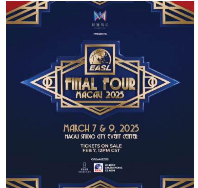
This poster provided by Melco Resorts & Entertainment yesterday on behalf of the East Asia Super League (EASL) promotes next month’s “EASL Final Four 2025”.