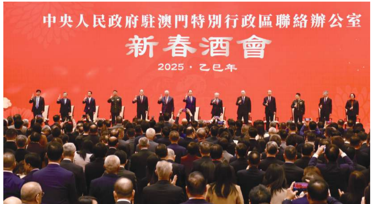
Senior central and local government, legislative and judicial representatives, as well as Chinese People's Liberation Army (PLA) officers from the local garrison offer a toast at yesterday's Spring Festival reception in the presence of 1,200 attendees including senior local government officials, Executive Council members, lawmakers, foreign consuls accredited to Macau, local business and community leaders, and senior media representatives.

Sam also pledged that his government would pro-actively build Macau into a "high-level talent highland", making concerted efforts to jointly build an "essential bridgehead" for the country's high-level opening-up as well as an "important window" for exchanges and mutual understanding between the Chinese and Western civilisations. ■