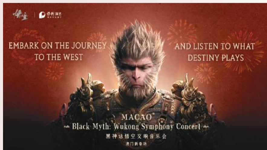
This poster provided by integrated resort operator MGM yesterday promotes the “Black Myth: Wukong” Symphony Concert slated to take place at MGM Theatre in MGM COTAI.