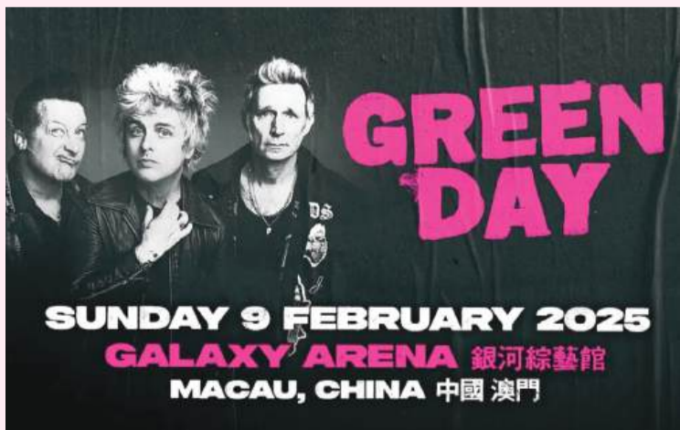
This poster downloaded from Galaxy Macau's website yesterday promotes Green Day's concert in Macau next month for their "The Saviors Tour".

* "Listen" can be used as a noun, similar to "streaming." In this context, it typically refers to the act of listening, particularly in relation to audio content.