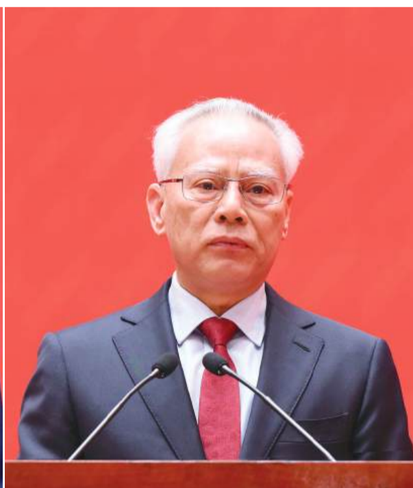
Liaison Office of the Central People's Government in the Macau Special Administrative Region (MSAR) Director Zheng Xincong (left) and Chief Executive Sam Hou Fai deliver speeches during yesterday's Spring Festival reception at the Complex for Commercial and Trade Cooperation Platform for China and Portuguese-speaking Countries (aka Forum Macao Complex) in Nam Van.