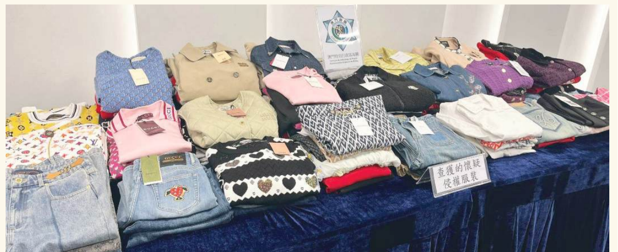
A total of 138 bogus items of clothing seized on Wednesday are displayed at the Macau Customs Service (SA) headquarters in Barra.

The spokesperson said that the suspects have been transferred to the Public Prosecution Office (MP). According to the Industrial Property Code Decree-Law No 97/99/M, the suspects face a hefty fine and up to six months in jail. ■