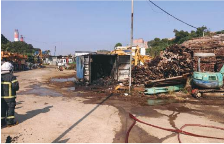
A fireman (left) looks at a container at a recycling centre in Coloane's Ka Ho Village (九澳村) yesterday, after firefighters had extinguished a blaze inside the storage container.

The cause of the incident is still under investigation. ■