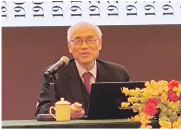
Hong Kong's economist Lawrence Lau Juen-ye yesterday speaks in the University of Macau (UM) and to reporters afterwards.

Lau started to teach in Stanford University's Department of Economics in 1966 where he was promoted to professor of economics in 1976.