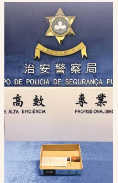
This undated handout photo released by the Public Security Police (PSP) yesterday shows the cleaver seized from the mainland suspect on Monday.