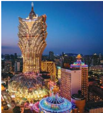
This photo shows Grand Lisboa and Hotel Lisboa next to each other on the peninsula.