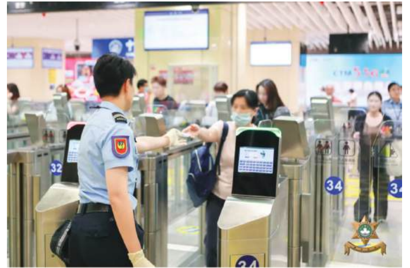
This undated handout photo released by the Public Security Police (PSP) early this month shows a border crosser passing an e-channel with the assistance of a PSP officer when entering Macau in the Qingmao checkpoint.

Likewise, border crossers en route to Macau are only required