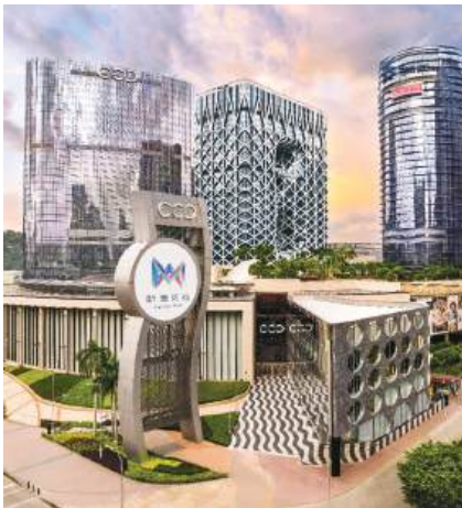
This photo recently provided by Melco Resorts & Entertainment shows its City of Dreams complex in Cotai.

Entertainment announced in their statement that its eligible non-management staff in Macau and Hong Kong will be receiving a wage hike.