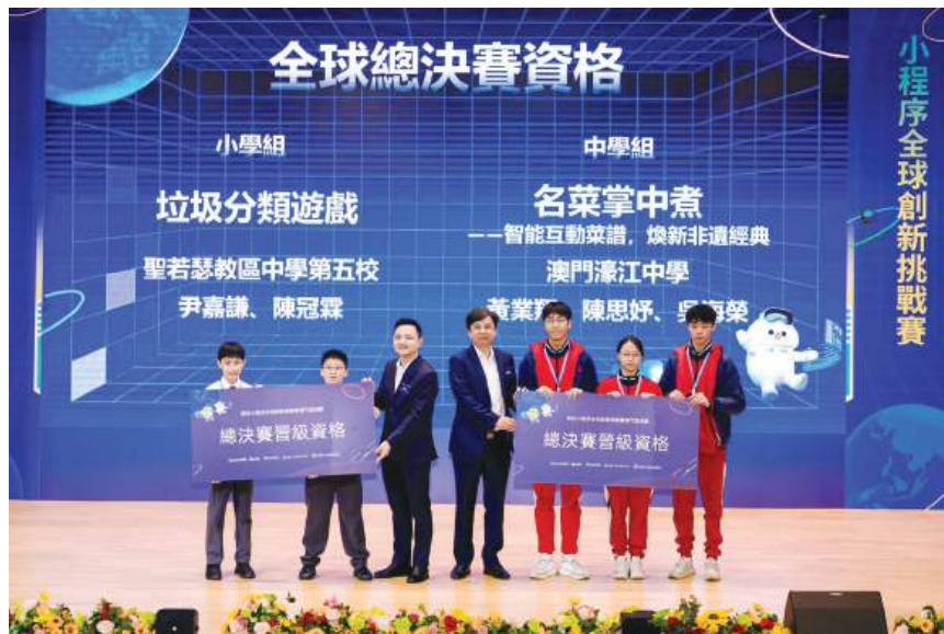
This handout photo provided by the organiser of the WeChat Mini Programme Global Innovation Challenge Macau Region Competition yesterday shows the two winning teams that will enter the Global Finals.

According to the statement, the WeChat team will continue to explore how to integrate technology with education to help teachers and students teach and learn more easily, adding that currently more than 1,000 schools are using the WeChat Mini Programme's education platform. ■