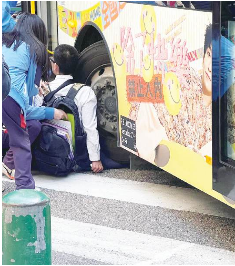
This photo circulating on social media platforms shows the 19-year-old student being run over by a Transmac bus in yesterday's accident on a zebra crossing in Iao Hon district.

Regarding the accident, the bus operator noted in a statement that