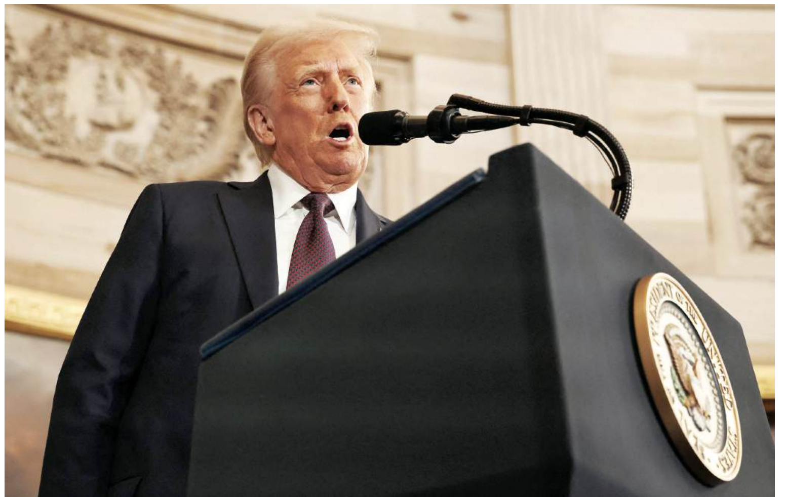
US President Donald Trump delivers his inaugural address after being sworn in as the 47 th president of the United States in the Rotunda of the US Capitol yesterday in Washington, DC.

Trump also vowed that the world’s biggest economy would again see itself as “a growing