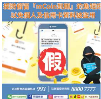
This image provided by the Judiciary Police (PJ) yesterday warns residents of the recent MPay phishing SMS scam.

The Judiciary Police (PJ) warned the public of MPay phishing SMS scams in a statement yesterday, in which residents are asked to click on