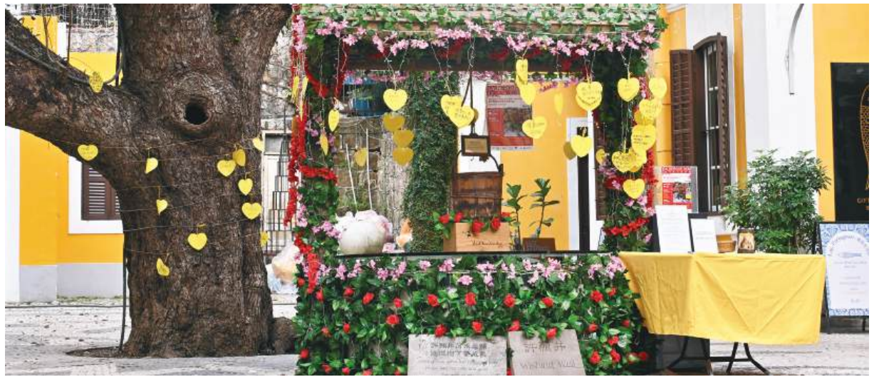
Messages are hung on the Albergue SCM Wishing Well and Love Tree.