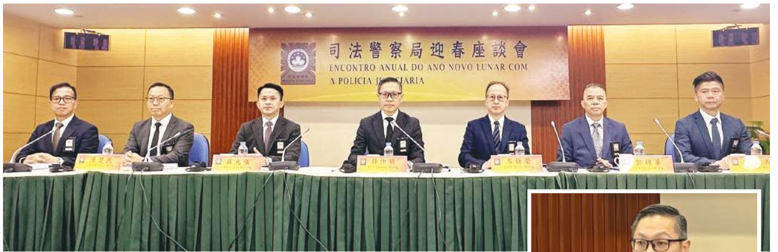
Senior Judiciary Police (PJ) officers address yesterday's press briefing at the PJ headquarters in Zape.

Sit reaffirmed that very few serious violent crime cases such as homicide – one case only – and grievous bodily harm – three cases only – were reported in the whole of last year, with the number of cases involving triad organisations, criminal gangs, domestic violence, arson, and blackmail decreasing year on year to, respectively, just 1, 25, 12, 43 and 169 cases. However, he added, the number of cases such as robbery, burglary and gaming-related crimes increased as a result of the growing number of visitor arrivals.