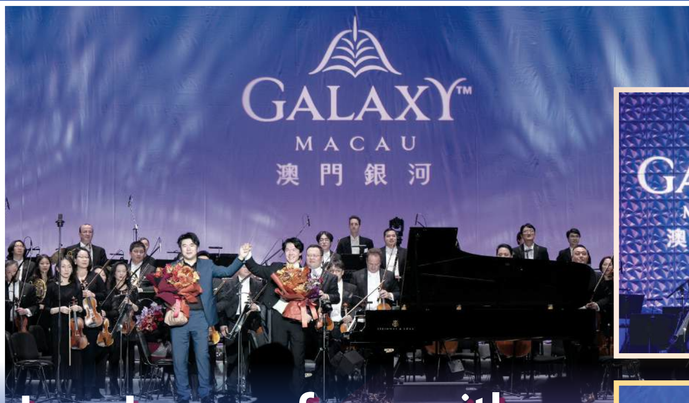
Lang Lang performs with the Macao Orchestra (OM) on Sunday at the Galaxy International Convention Centre.