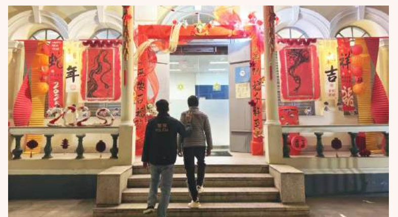
This undated handout photo provided by the Public Security Police (PSP) yesterday shows PSP officer escorting the suspect to a police station.