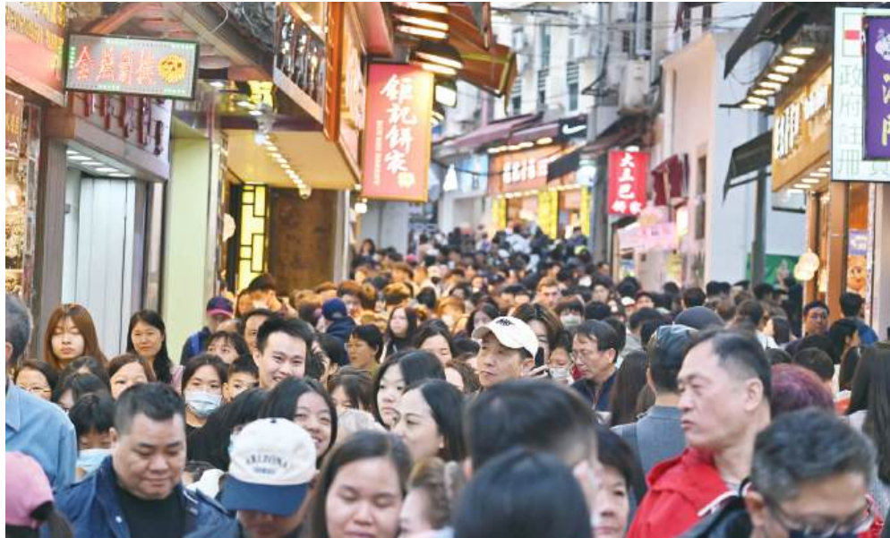
Crowds of tourists walk in both directions on the path leading to the UNESCO World Heritage-listed Ruins of St. Paul's yesterday afternoon.