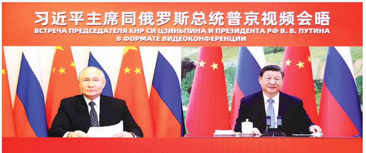
President Xi Jinping (right) talks with Russian President Vladimir Putin via video-link meeting at the Great Hall of the People in Beijing yesterday.

He called on the two sides to continue deepening strategic coordination, firming up mutual support, and safeguarding the legitimate interests of the two countries. China and Russia should consolidate and expand bilateral relations and push for in-depth development of practical cooperation, Xi added.