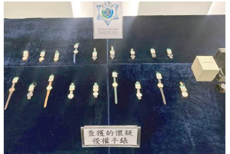
A total of 19 bogus watches seized on Monday are displayed at the Macau Customs Service (SA) headquarters in Barra yesterday.

The spokesperson said that the suspects have been transferred to the Public Prosecutions Office (MP). According to the Industrial Property Code Decree-Law No 97/99/M, the suspects face a hefty fine and up to six months in jail. ■