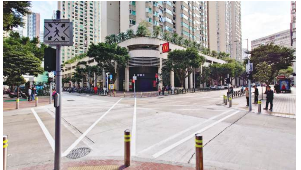
This handout photo provided by the Transport Bureau (DSAT) yesterday shows the diagonal crossing at the junction of Rua Nova da Areia Preta (黑沙環新街) and Rua de Ma Kau Seak (馬交石街).

Meanwhile, according to a separate statement by the bureau yesterday, Avenida da Ponte da Amizade (澳門橋大馬路) will partially open to traffic from Sunday, when motorists will no longer be allowed to enter the Hong Kong-Zhuhai-Macau Bridge checkpoint and the Macau Bridge via Avenida do Mar de Espelho (鏡海大馬路), except for access to the Zone A construction site, or for authorised vehicles. ■