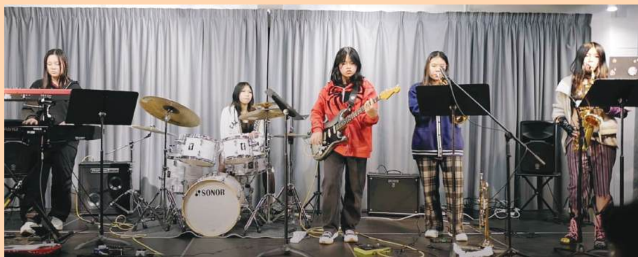
Local girl band Finger Biscuits performs as the opening act for Window Cleaning Service.

* https://www.macaupostdaily.com/news/23786