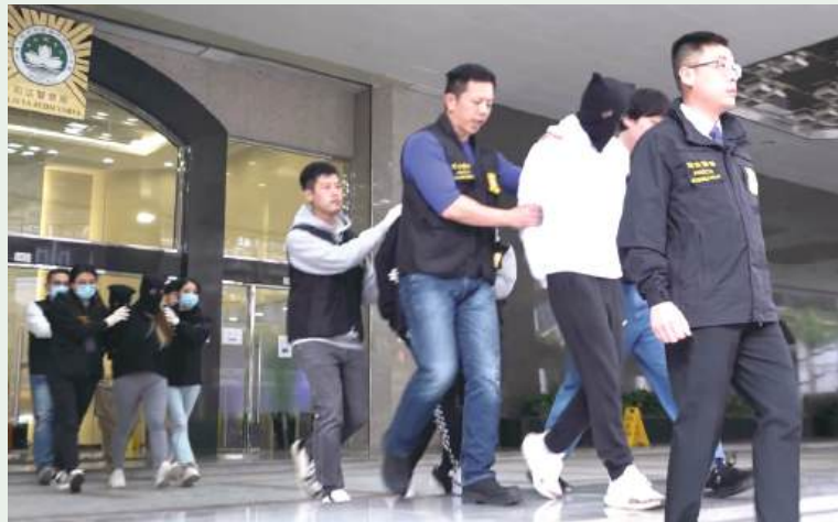
Judiciary Police (PJ) officers escort the four hooded fraud gang suspects from Hong Kong to a police vehicle outside the PJ headquarters in Zape yesterday.

The quartet were transferred to the Public Prosecutions Office (MP) yesterday, where they face charges of organised crime and fraud. ■