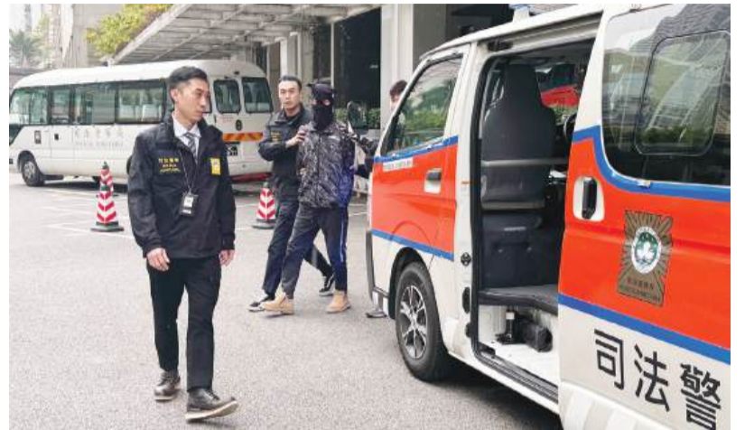
Judiciary Police (PJ) officers escort the suspect from the PJ headquarters in Zape to a PJ vehicle after yesterday's special press conference.

Fong was transferred to the Public Prosecutions Office (MP), facing a fraud charge, according to Chao. ■