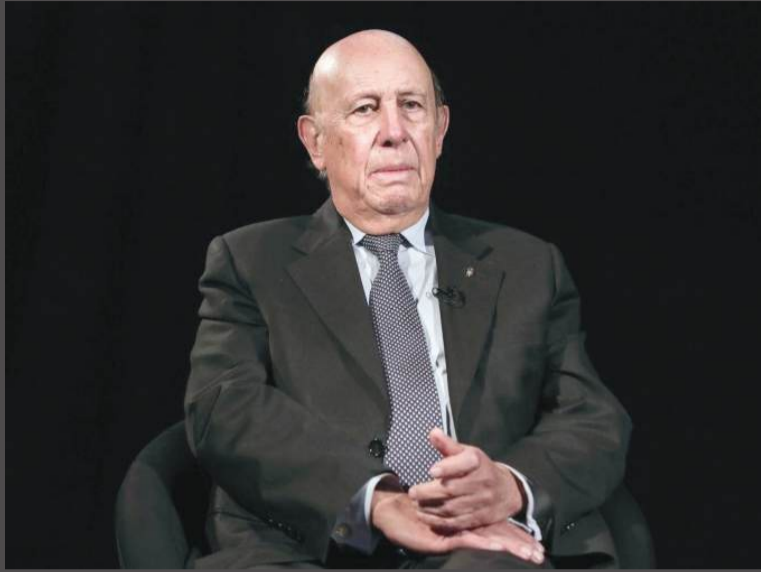
Undated file photo of Macau's last Portuguese governor, Vasco Rocha Vieira, who died in Portugal yesterday.