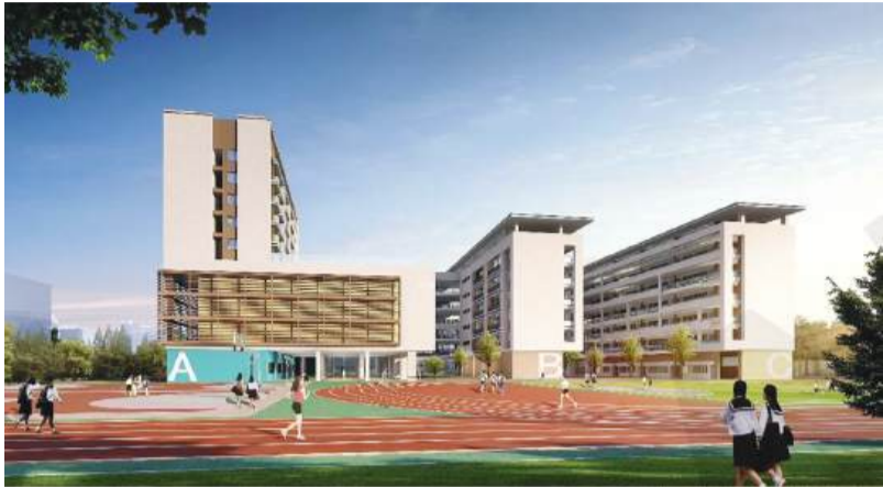
This artist's rendition provided by the Public Works Bureau (DSOP) shows the government's "School Village" in the Zone A land reclamation area.