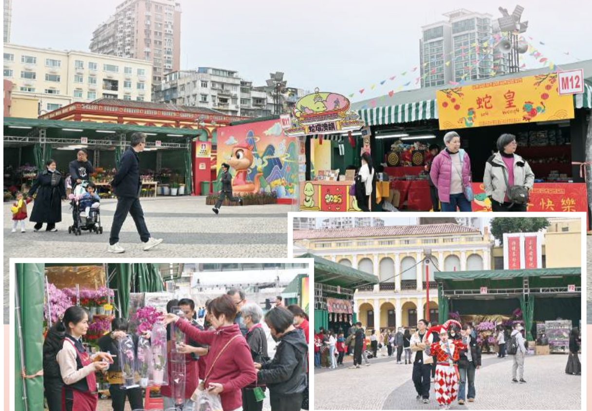
These photos taken yesterday show the Chinese New Year Market in Praça do Tap Seac.

market comprises 14 stalls selling Chinese New Year gifts, six selling flowers, and four selling light snacks. Performances are also set to take place throughout the event's run, along with a large-scale floral exhibition, the statement said. ■