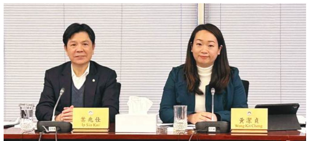
Lawmaker Ip Sio Kai (left) and the head of the Legislative Assembly's (AL) Follow-up Committee for Public Finance Affairs Wong Kit Cheng, pose before yesterday's press briefing at the Legislative Assembly Building.

Notably, 14 projects reported a budget usage rate of zero, involving a total of 160 million patacas. Among the 241 projects in the investment plan, the government has modified the execution period for 10 projects, with five anticipated to be delayed, including the light rail consulting and inspection services and the Macau Peninsula section of the light rail. ■