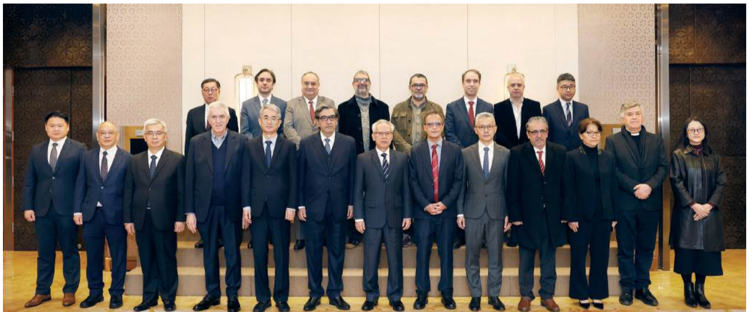
Chief Executive Sam Hou Fai (centre, front) poses with senior Portuguese- and English-language media representatives and government officials before a Chinese New Year dinner at the Mandarin Oriental Hotel in Nape last night.

Sam also said that he hoped that Macau's Portuguese- and English-language media will continue to grow and, together with the