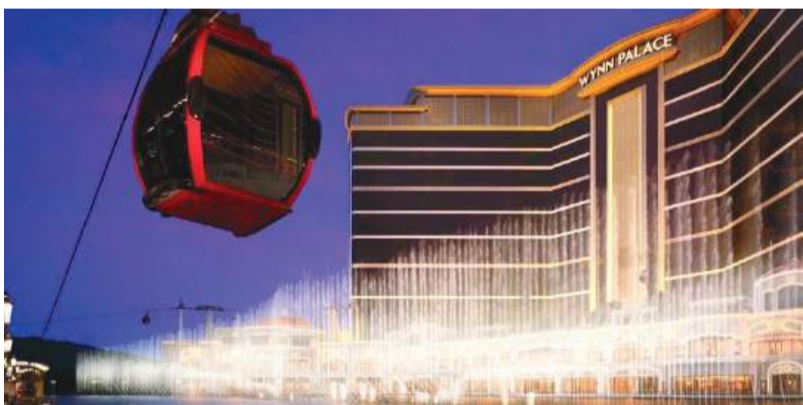
This undated photo downloaded from the Wynn Macau website shows Wynn Palace in Cotai.