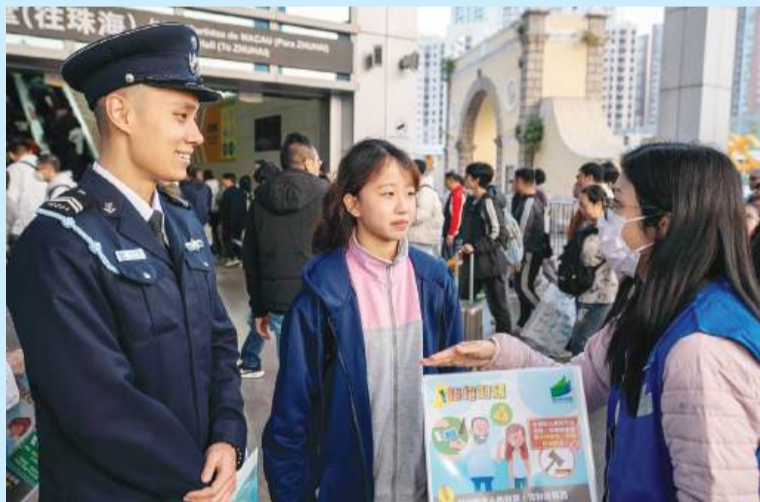
This undated handout photo provided by the Education and Youth Development Bureau (DSEDJ) yesterday shows its official (right) and a Macau Customs Service (SA) officer (left) trying to raise a student's awareness of lawfulness at the Barrier Gate checkpoint.

According to the statement, the bureau also urged young students to never believe in recruitment advertising from unknown platforms, especially those featuring promotion tactics such as promising "quick money". ■