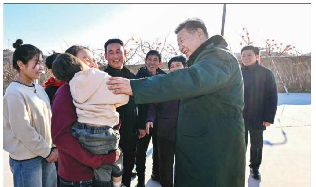
President Xi Jinping, also general secretary of the Communist Party of China (CPC) Central Committee and chairman of the Central Military Commission, talks with villagers in Zhujiagou Village, Suizhong County of Huludao City, northeastern Liaoning Province, during an inspection visit. Xi braved the cold to visit people affected by floods in the village. (More on page 7)

The Tesla boss and OpenAI chief executive Sam Altman, who was present at the White House on Tuesday, have been mired in a serious feud, with Musk opening repeated lawsuits against the company behind ChatGPT.