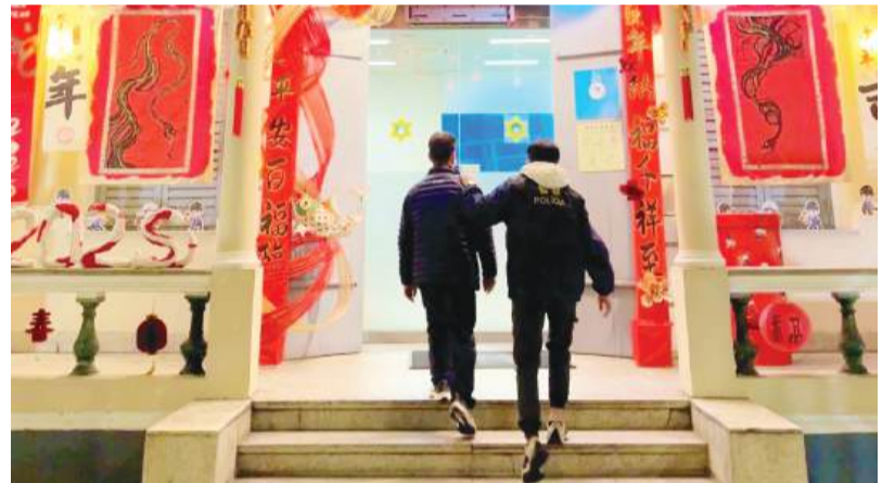
This undated handout photo provided by the Public Security Police (PSP) yesterday shows a PSP officer escorting the suspected thief to a police station.

The suspect was transferred to the Public Prosecution Office (MP) yesterday. Chio is facing aggravated theft charges. ■