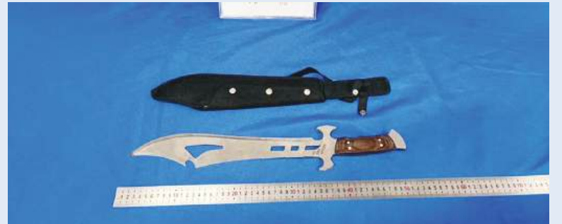
This undated handout photo provided by the Macau Customs Service (SA) on Friday shows the 40-centimetre-long knife seized at the Qingmao pedestrian border checkpoint last Wednesday.

As the man failed to explain why he was in possession of the