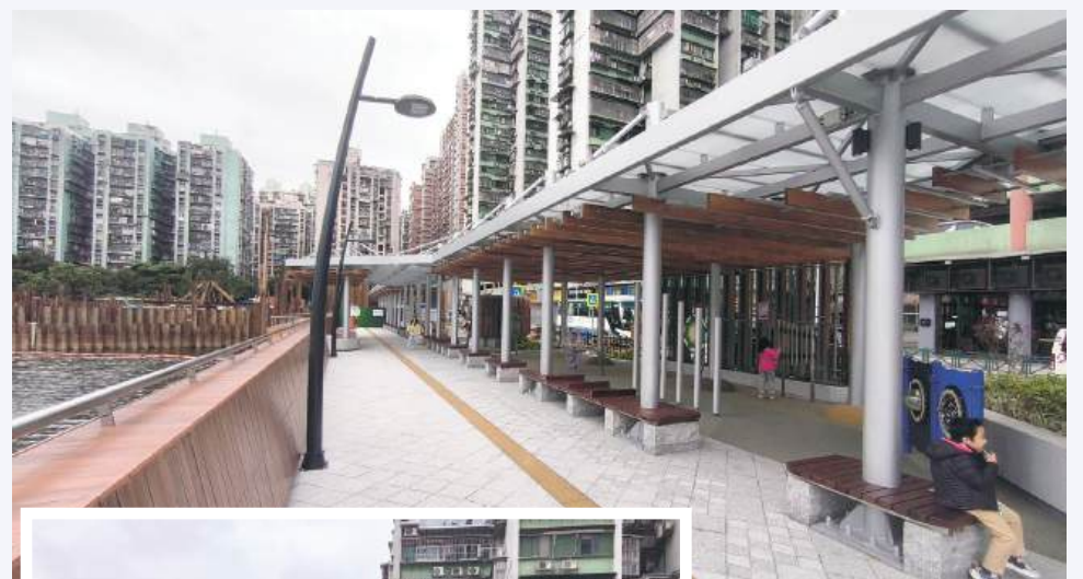
A boy sits in the new sitting-out area along the south-side waterfront of Patane North Bay yesterday, with the adjacent rainwater pumping station project (left) still underway.

The road running along the bay's south-side waterfront is known as Rua do Comandante João Belo (俾若翰街/筷子基北街).