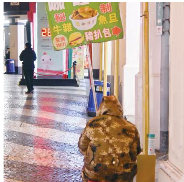
A sign carrier promoting a beef offal eatery tries to stay warm by wearing a thick jacket in Largo de S. Domingos in the city centre.

"Just let it be" added a local woman in her fifties who operates a stall in the city centre as she was braving the frigid weather last night. "Of course, I do feel the cold while I stand here, this is just the situation", adding that the wintry conditions comes with the CNY holiday. But working, she said, especially when it gets busy, does help her keep warm, along with the heat coming from her stall. In general, however, she said that there is no better way to stay warm than wearing more layers of clothing.