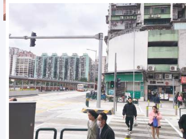
Pedestrians cross Rua da Doca Seca at the junction of Rua do Comandante João Belo yesterday where traffic lights came into use on Friday.