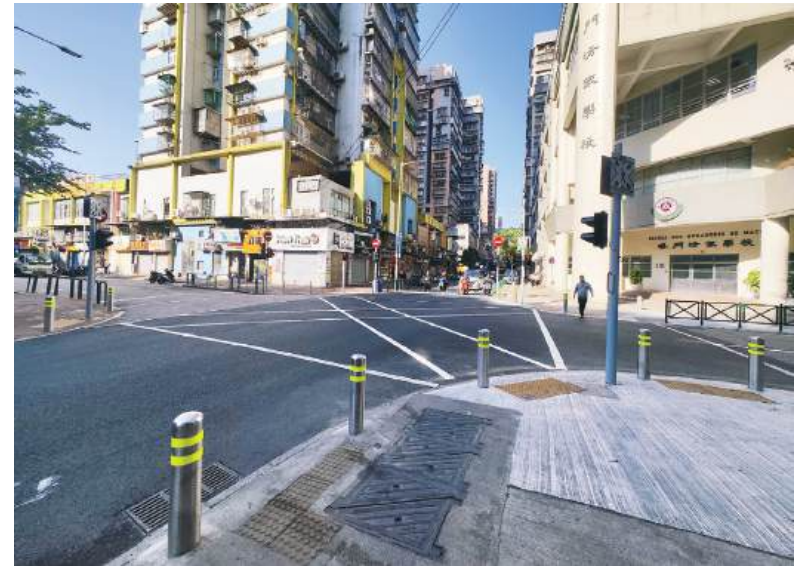
This handout photo provided by the Transport Bureau (DSAT) on Friday shows the multidirectional crosswalk at the junction of Avenida da Longevidade, Rua da Tribuna and Avenida do Hipódromo.

The statement noted that having assessed the factors of the road conditions and vehicular traffic pressure at Avenida da Longevidade, Rua da Tribuna and Avenida do Hipódromo (馬場大馬路) and after communication