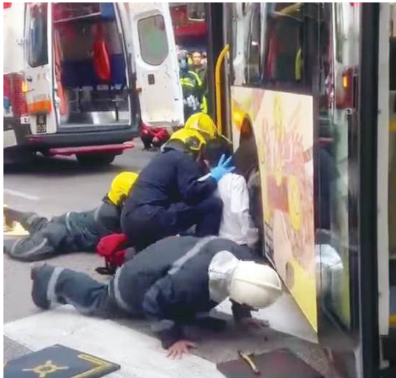
This photo circulating on social media platforms shows firefighters assisting the 19-year-old student run over by a Transmac bus in last Monday's accident on a zebra crossing in Iao Hon district.

Meanwhile, concerning the fact that a "parallel-trading" gang had employed school leavers aged 16-17 to smuggle items such as computer processors with a market value of about 700,000 patacas to the mainland, Kong said that according to the law, compulsory schooling ends at the age of 15. However, he said, his bureau has, in conjunction with nine local counselling organisations, been following up on school leavers who are over the age of compulsory education, with the aim of encouraging them to return to school. ■