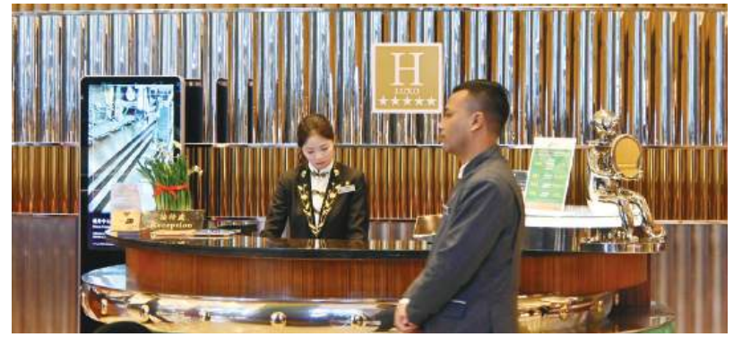
A receptionist and a bell boy wait for guests at a hotel in the city centre yesterday.

Meanwhile, Macau received 2.1 million package tour visitors last year, an increase of 63.8 percent. Mainland Chinese accounted for 88.77 percent of all package tour visitors. Among package tour visitors from foreign countries, those of South Korea (91,000) and India (24,000) grew by 226.4 percent and 302.2 percent respectively. ■