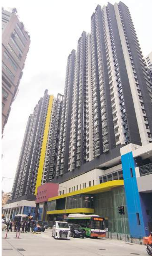
Vehicles drive past the new Mong Son Building on Avenida de Venceslau de Morais yesterday. An area on its podium will house the new Government Services Centre.

The Government Services Centre in Taipa, which opened in 2019, is also a private property leased out to the government, located on a podium floor of