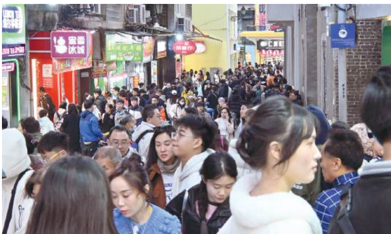
Tourists crowd Rua da Sé (大堂街) in the city centre yesterday.