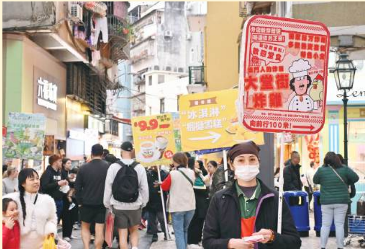
Promotional sign carriers work try to attract tourists' attention in Rua da Palha (賣草街) yesterday.

The median monthly employment earnings of the employed population in general and the employed residents in particular amounted to 18,000 patacas (US$2,240) and 20,500 patacas respectively, both up by 500 patacas year on year. ■