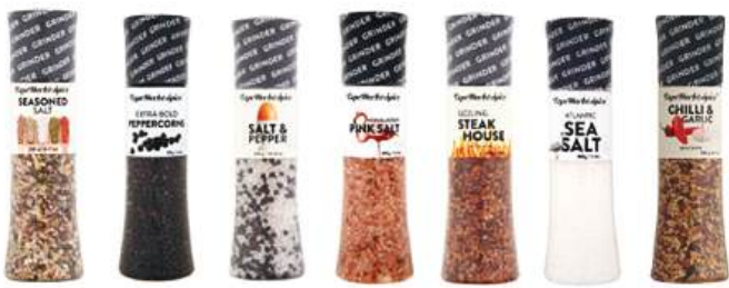
This file photo provided by the Municipal Affairs Bureau (IAM) yesterday shows the eight problematic "Cape Herb & Spice" seasoning products.

Anyone who has food-related enquiries may call the IAM's Food Safety Hotline on 2833 8181. ■