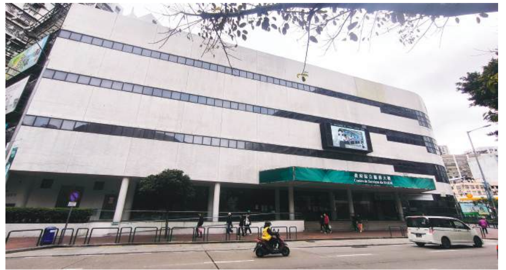
A car and a motorcycle drive past the current Government Services Centre on Rua Nova da Areia Preta (黑沙環新街) yesterday.

The new social rental housing estate comprising three blocks, built on the plot of the former CEM power station on Avenida de Venceslau de Morais, is known as Mong Son Building (望信樓), where tenants started to move into their flats late last year.