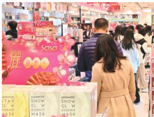
Shoppers browse for cosmetics in a store in the city centre yesterday.