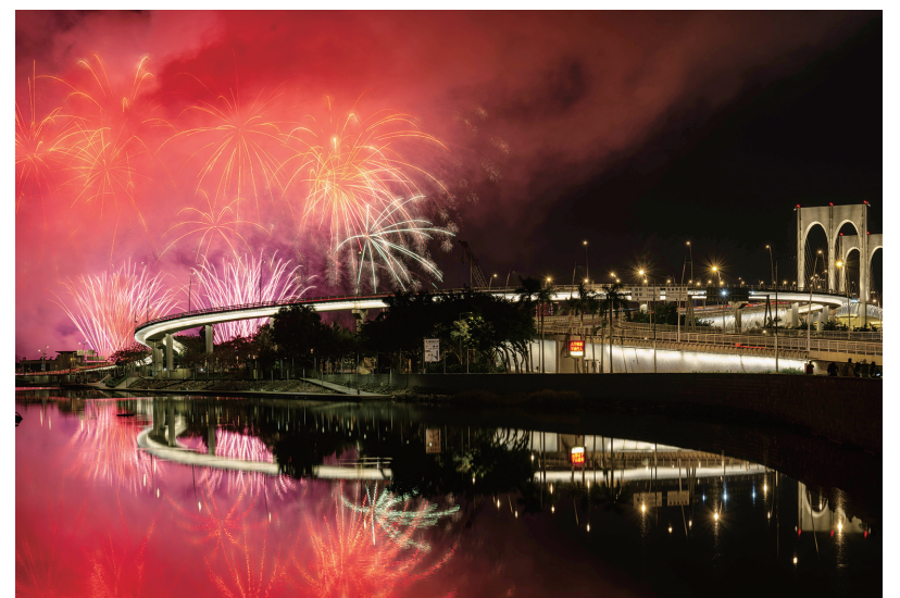
Fireworks in celebration of the Chinese New Year, aka Spring Festival, illuminate the sky over the southern tip of the Macau Peninsula last night.

Macau's most popular English-language newspaper – Your trustworthy source of news & views