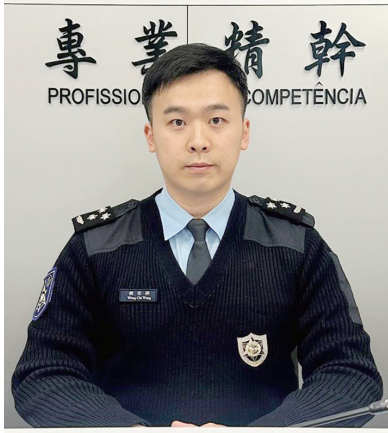
Public Security Police (PSP) spokesman Wong Chi Weng looks on during yesterday's regular press conference at the PSP pressroom in Zape.