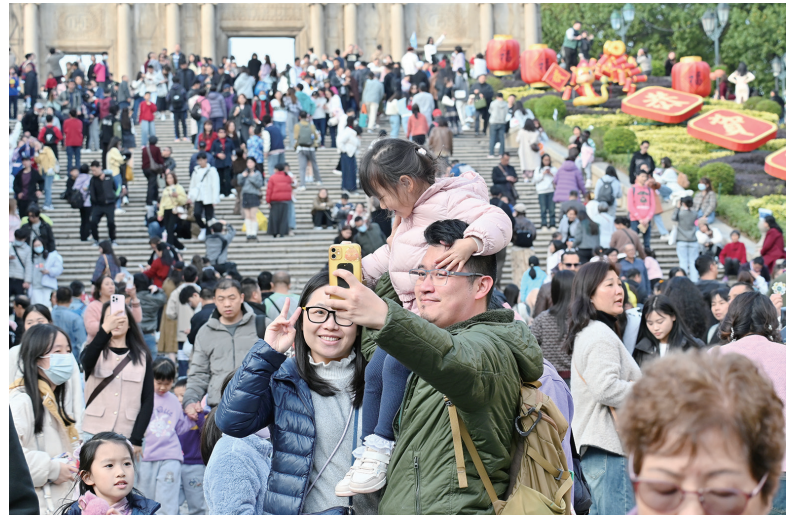
A family of visitors snap a selfie yesterday afternoon in front of the UNESCO World Heritage-listed Ruins of St. Paul's.