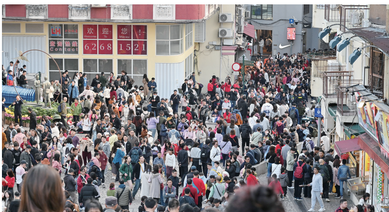
This photo taken yesterday shows the view from the UNESCO World Heritage-listed Ruins of St. Paul's crowded with Chinese New Year visitors.

Macau's highest single-day number of visitor arrivals was recorded on the third day of the Year of the Pig in pre-pandemic 2019, at some 226,000. ■