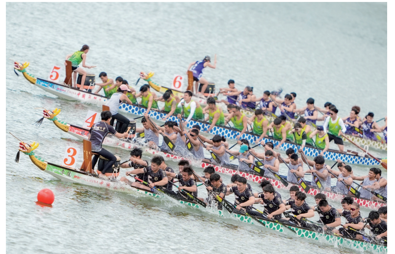
This undated handout photo provided by the Sports Bureau (ID) shows paddlers racing during a previous SJM Macao International Dragon Boat Races competition.

Interested associations or organisations can submit their entries via www.cmdragonboat.org.mo .