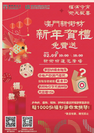
This poster provided by Macau Urban Renewal Limited (MUR) on Monday promotes its upcoming Lantern Festival event to be held this Sunday.

Moreover, CNY-themed installations and interactive attractions will also be set up there, the statement said. MNN homeowners can invite Macau residents not living there to participate in the event where they can get a "mystery welcome