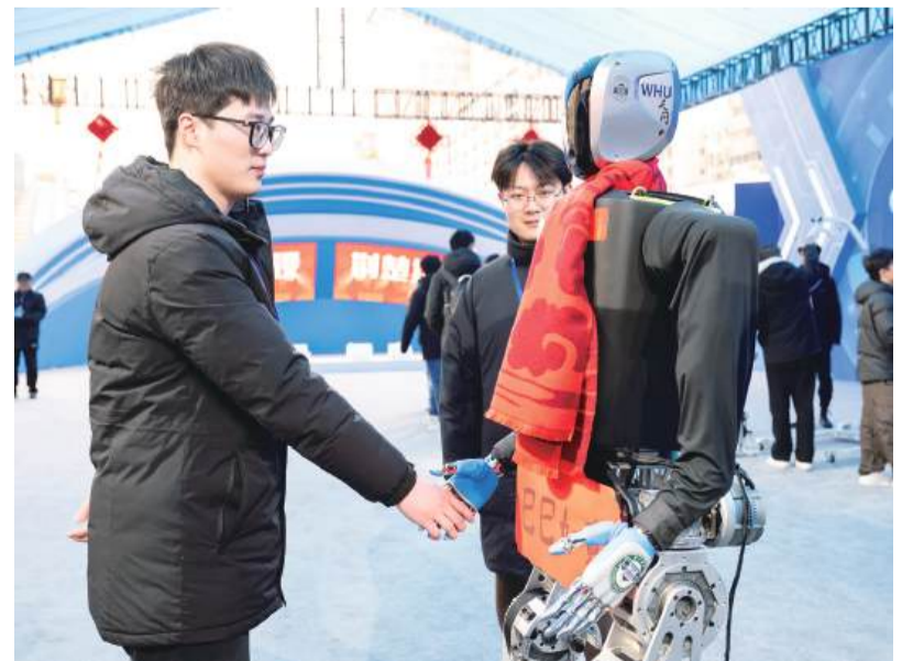
A visitor shakes hands with a humanoid robot on display in Wuhan, central China's Hubei Province, yesterday. Ten humanoid robots of the "Chucui" series were displayed during a conference in Wuhan, showcasing a variety of abilities.

Trump had signalled earlier that the talks with Xi could take place early this week, but addressing reporters at the White House on Tuesday afternoon, he said he was in "no rush."