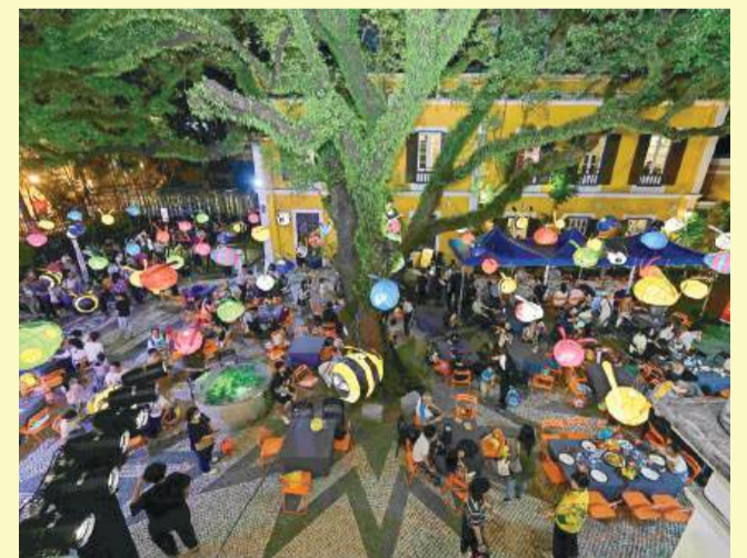
This undated handout photo provided by CAC – Círculo dos Amigos da Cultura de Macau yesterday shows a previous Chinese New Year celebration party taking place at Albergue SCM on Calçada da Igreja de S. Lázaro (瘋堂斜巷).

***According to Wikipedia, A frog or pankou (盤扣;), also called Chinese frog closure and decorative toggle is a type of ornamental garment closure. Made from braiding, cord, fabric, or covered wire, they consist of a decorative knot button (a Chinese button knot for a traditional Chinese style) and a loop. Its purpose is to fasten garments while providing a decorative element on the clothing. It can be used to fasten openings edge-to-edge, avoiding an overlap. It is especially used on the cheongsam, where the pankou represents the cultural essence of the dress.