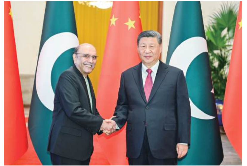
President Xi Jinping shakes hands with Pakistani President Asif Ali Zardari at the Great Hall of the People in Beijing yesterday. Xi held talks with Zardari, who is on a state visit to China, in Beijing yesterday.

China welcomes Pakistan to become one of the first countries to benefit from China's further deepening of reform comprehensively and expanding high-standard opening up, Xi said, adding that China is ready to deepen practical cooperation with Pakistan in various fields, work