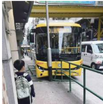
This photo circulating on a social media platform yesterday shows a bus crash in Avenida do Conselheiro Ferreira de Almeida (荷蘭園大馬路), with its front and the roadside railings damaged.

The bus driver faces a charge of "failing to stop safely," and further investigations are underway to determine the exact cause of the incident. ■