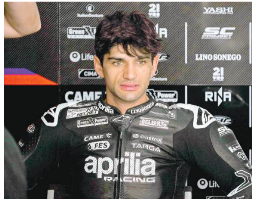
Aprilia Racing's Spanish rider Jorge Martin looks on during the first day of the 2025 MotoGP pre-season test at the Sepang International Circuit in Sepang, Malaysia yesterday.