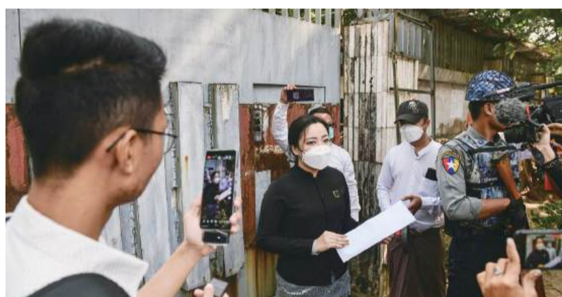
An auction official reads a statement outside the gate of the family house of detained Myanmar civilian leader Aung San Suu Kyi in Yangon yesterday, during an attempt to sell the lakeside mansion.