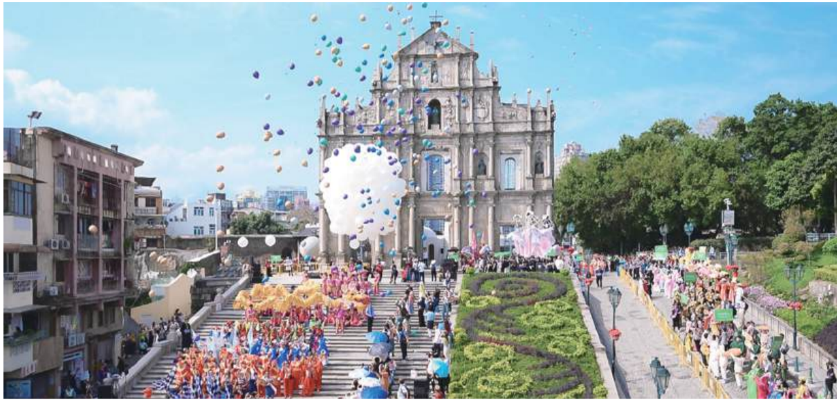
This undated file photo provided by the Cultural Affairs Bureau (IC) shows last year's Macau International Parade.

The route of the parade will start at the Ruins of St. Paul's (大三巴牌坊) and finish in Praça do Lago Sai Van (西灣湖廣場), the