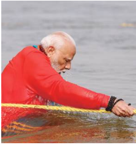
This handout photograph taken yesterday and released by the Indian Press Information Bureau (PIB) shows India's Prime Minister Narendra Modi taking a holy dip in the sacred waters of Sangam, the confluence of Ganges, Yamuna and mythical Saraswati rivers during Maha Kumbh Mela festival, in Prayagraj. India's Hindu nationalist prime minister Modi made a ritual river dip yesterday at the world's largest religious festival, a week after a stampede killed at least 30 pilgrims.