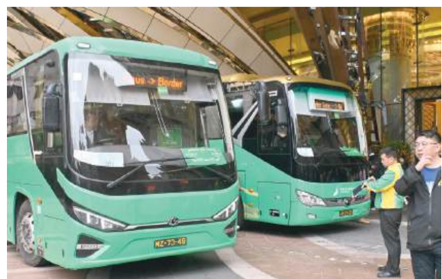
This file photo taken during the Chinese New Year holiday last week shows two electric shuttle buses at the integrated resort Grand Lisboa.

As cited by TDM, the Transport Bureau (DSAT) has noted that as of the end of last month, the city's two public bus operators had put 929 new-energy vehicles (NEVs) into service, accounting for more than 92 percent of the total. As for taxis, there were 210 fully electric taxis in operation, accounting for about 11.9 percent of the total number of taxis, while about 86.2 percent were hybrid taxis. ■