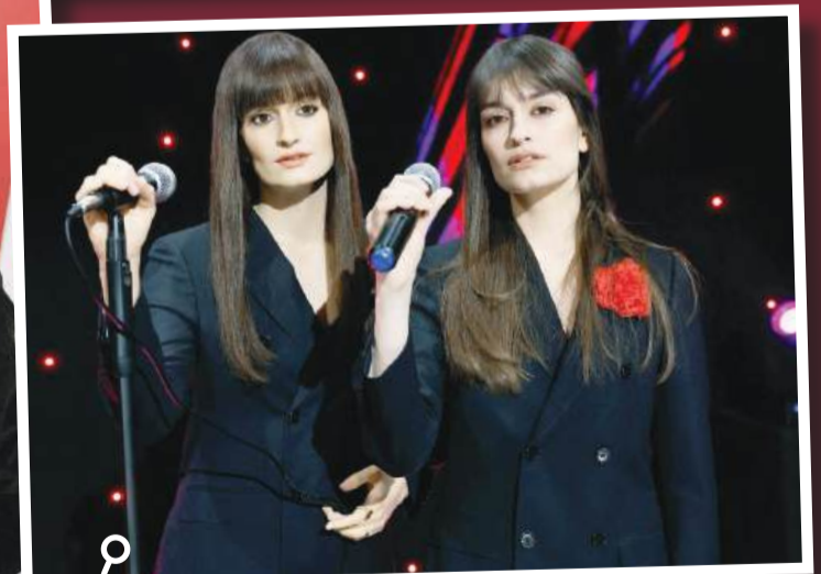
French singer Clara Luciani (right) poses next to her wax statue during its unveiling at the Musée Grévin in Paris on Tuesday.