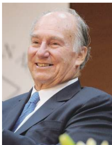
The Aga Khan, chairman of the Aga Khan Development Network, applauds during the inauguration ceremony of The Aga Khan Academy in Hyderabad on September 20, 2013.

A billionaire owner of yachts and jets, the Aga Khan was a regular on the racetrack and continued the family tradition of breeding thoroughbreds.