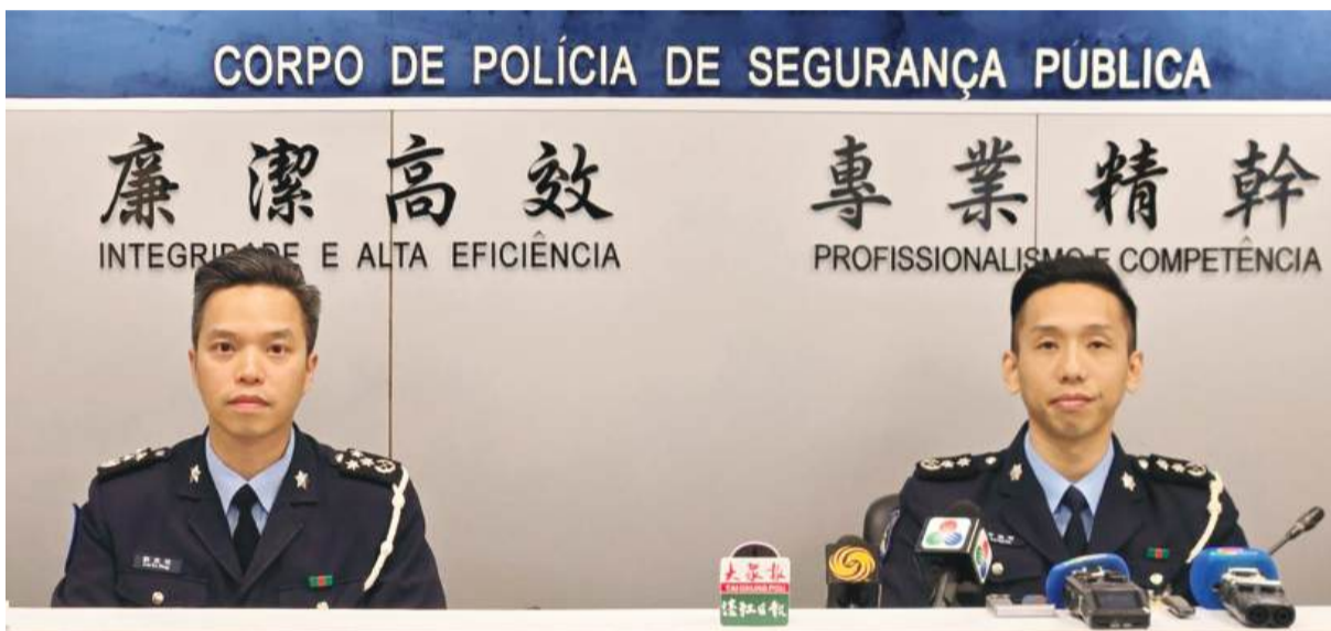
Lei Tak Fai (right), who heads the Public Security Police's (PSP) Public Relations Division, and Border Control Department head Lao Ka Weng look on during yesterday's press conference at a PSP press room in Zape.

Lao pointed out that the Hengqin Port checkpoint recorded 659,000 border crossings, representing a relatively large period-on-period increase of 16.4 percent. Meanwhile, the Macau