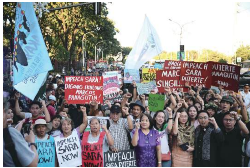
Protesters including legislators France Castro (centre, in purple dress), Arlene Brosas (front third right, with shawl), and Raoul Manuel (front second right), who filed one of the four impeachment complaints, shout slogans as they carry placards during a rally in front of the House of Representatives in Manila yesterday, as members of congress voted to impeach Philippine Vice-President Sara Duterte.