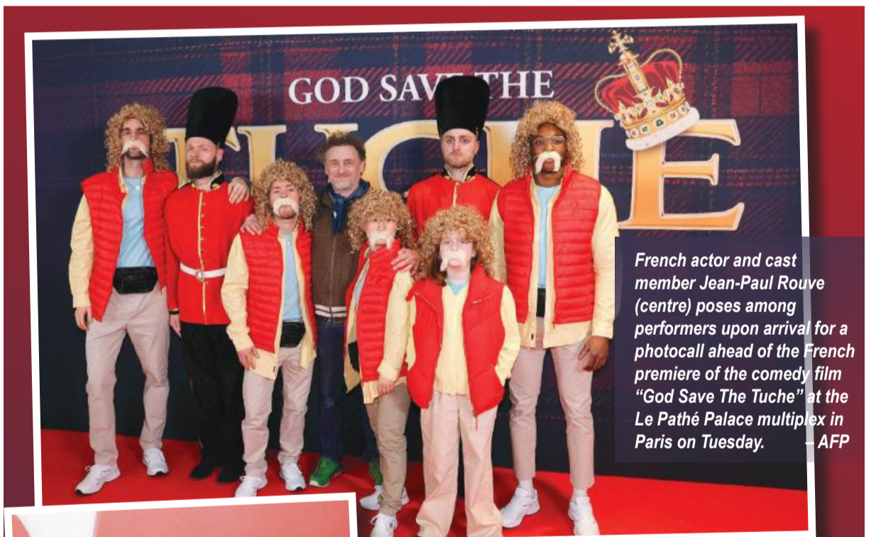
French actor and cast member Jean-Paul Rouve (centre) poses among performers upon arrival for a photocall ahead of the French premiere of the comedy film "God Save The Tuche" at the Le Pathé Palace multiplex in Paris on Tuesday. – AFP