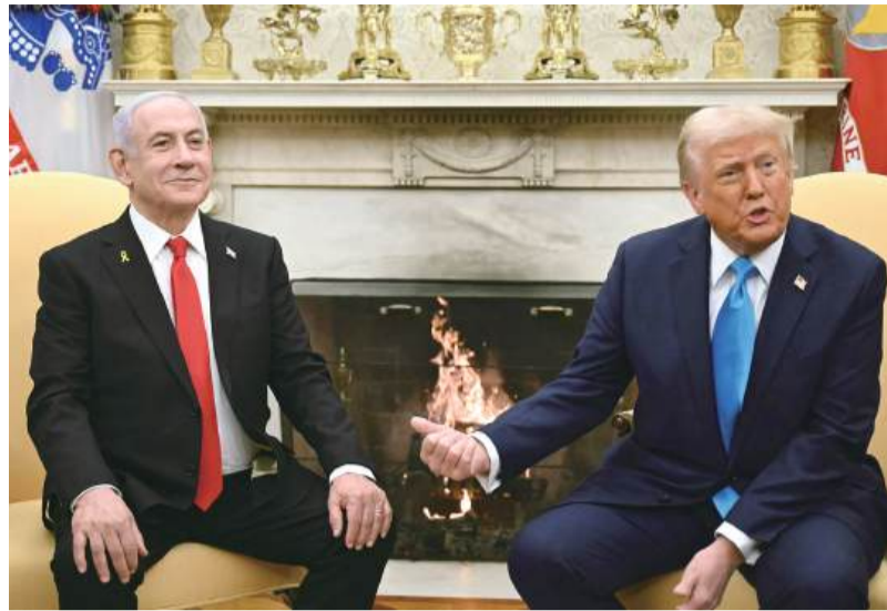
US President Donald Trump (right) meets with Israel's Prime Minister Benjamin Netanyahu in the Oval Office of the White House in Washington, DC, on Tuesday.

the destroyed buildings, level it out, create an economic development that will supply unlimited numbers of jobs and housing for the people of the area."