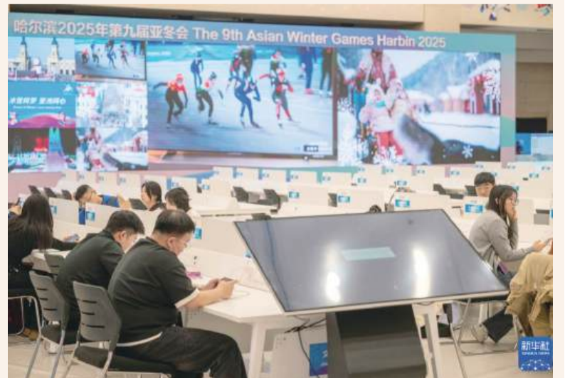
This photo taken last week shows staff members preparing the operation of the main press centre for the 9 th Asian Winter Games in Harbin.

This is the second time that the Asian Winter Games is held in Harbin, the other being in 1996, and the third time in China, with Jilin's provincial capital Changchun in 2007 being the third. (More on p.14) ■