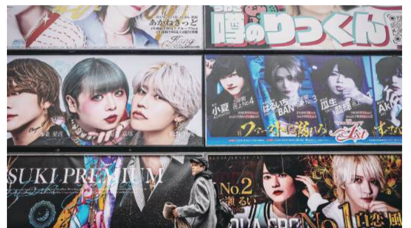
A man (bottom centre) walks past advertising hoardings for "host clubs" in the Kabukicho area of Tokyo yesterday.