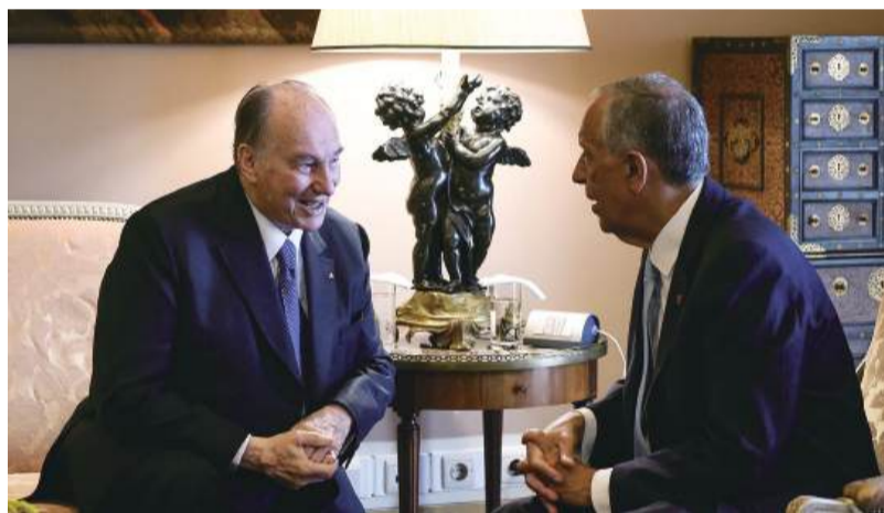
Portuguese President Marcelo Rebelo de Sousa (right) meets with Prince Karim Aga Khan IV at Belém Palace in Lisbon on July 9, 2018.

It is used in situations which are “essentially political, but which are presented, for various reasons, in a theological context. This is simply not correct,” he said.