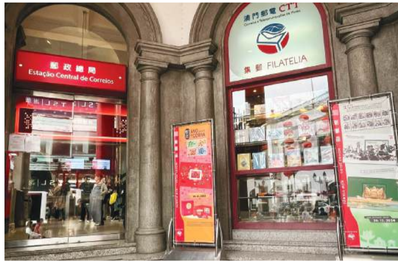
This photo taken yesterday shows the main entrance to the Macao Post and Telecommunications Bureau (CTT) headquarters in Largo do Senado.

However, according to a CTT statement yesterday, express shipments to Illinois, USA (ZIP code IL60004-IL62903) are also suspended due to the fact that the