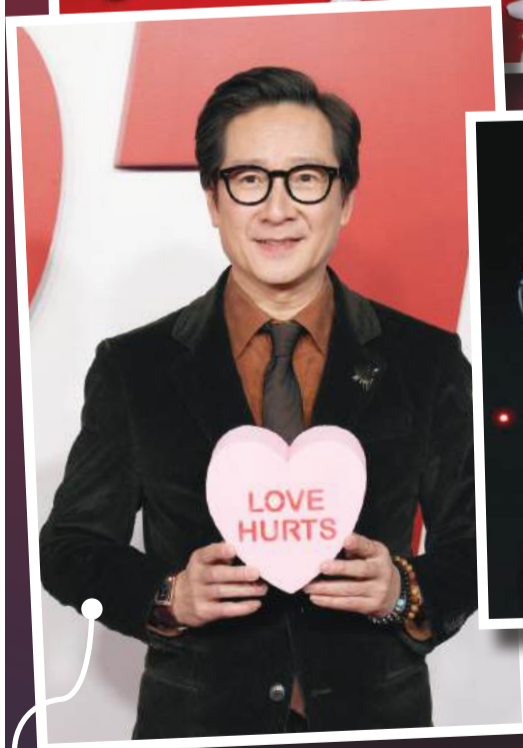
Vietnamese-American actor Ke Huy Quan poses upon arrival for the premiere of romantic action comedy film "Love Hurts" at the TCL Chinese Theatre in Los Angeles on Monday. As a child actor, Quan rose to fame playing Short Round in "Indiana Jones and the Temple of Doom" (1984) and Data in "The Goonies" (1985).