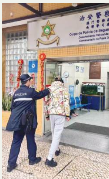
This undated handout photo provided by the Public Security Police (PSP) yesterday shows a PSP officer escorting the Moroccan suspect to a police station.

A man from Morocco was arrested on Sunday for stealing and damaging goods in a supermarket in the city centre, Public Security Police (PSP) spokesman Wong Chi Weng said at a regular press conference yesterday.