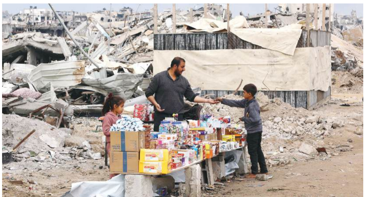
A man sells goods in front of the rubble of destroyed buildings along Saftawi Street in Jabalia in the northern Gaza Strip yesterday during a ceasefire deal in the war between Israel and Hamas. Palestinian militant group Hamas lashed out yesterday at President Donald Trump's shock proposal for the US to take over the Gaza Strip and resettle its people in other countries, seemingly whether they want to leave or not.

Macau's most popular English-language newspaper - Your trustworthy source of news & views