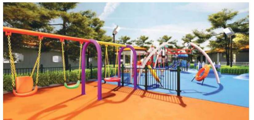
This artist's rendition provided by the Municipal Affairs Bureau (IAM) yesterday shows the children's playground in Flower City Park after its revamp, including new facilities and mats.

This project will include installing climbing and balancing equipment suitable for children aged between 2 and 12 years, providing a diverse range of fun facilities. The upgrade will also include seamless safety mats, while an accessible