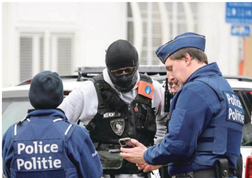
Belgian police discuss the situation outside the Clemenceau metro station following a shooting, in Brussels yesterday. Brussels police searched for at least two gunmen yesterday, after shots were fired outside a metro station, authorities said.