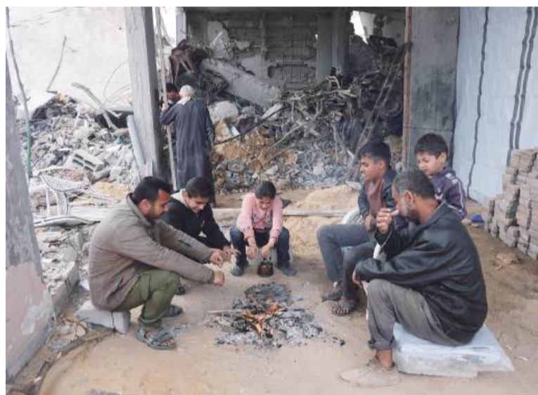
Palestinians warm themselves by a fire inside a heavily damaged building in Jabalia, in the northern Gaza Strip, yesterday during a ceasefire deal in the war between Israel and Hamas.

"A government, such as the Palestinian Authority, cannot give this consent on behalf of a people. People have a right to