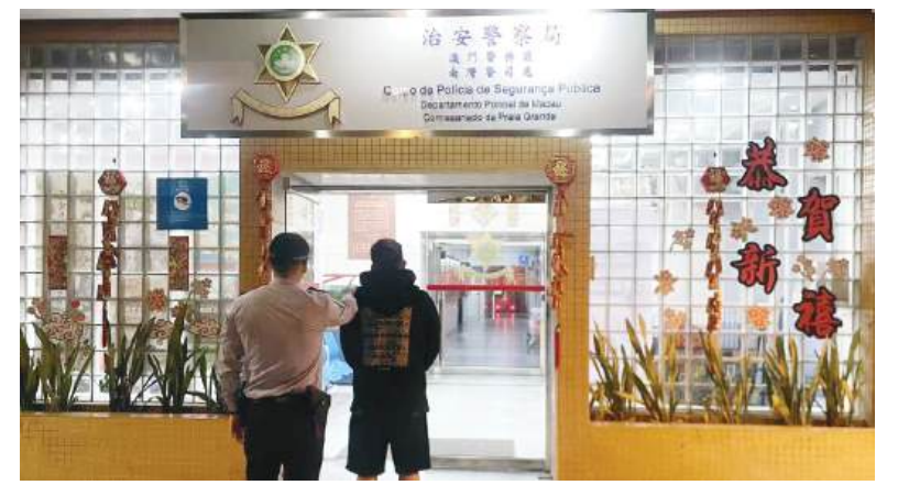
This undated handout photo provided by the Public Security Police (PSP) yesterday shows the drunk-driving suspect being escorted to a PSP station in

Ho, who told the police that he's The Public Security Police (PSP) admitted to having drunk alcoholic unemployed, has been transferred beverages in Rua do Visconde to the Public Prosecutions Office (MP), facing a drunk-driving charge. ■