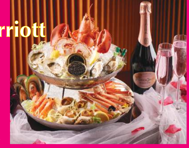
This undated handout photo provided by JW Marriott Hotel Macau earlier this week shows the Valentine's Day Menu to be available at The Lounge.

Moreover, at The Lounge, the Valentine's Day