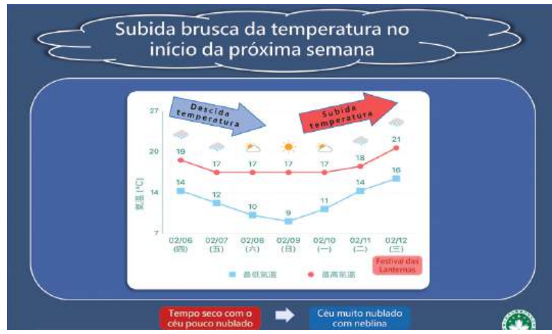
This graphic released by the Meteorological and Geophysical Bureau (SMG) yesterday forecasts cold weather for the next few days.

Residents are advised to keep abreast of the possibly rapid changes of the weather and alerts from the government and to prepare for potential temperature fluctuations, the bureau said, adding that special attention should be paid to the health of the elderly, children, and those with underlying health conditions during the expected cold spell.