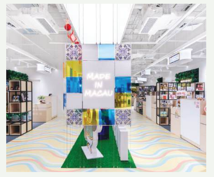
This undated handout image recently provided by SJM Resorts shows the revitalised and reimagined "Made in Macau" retail space at Grand Lisboa Palace (GLP).