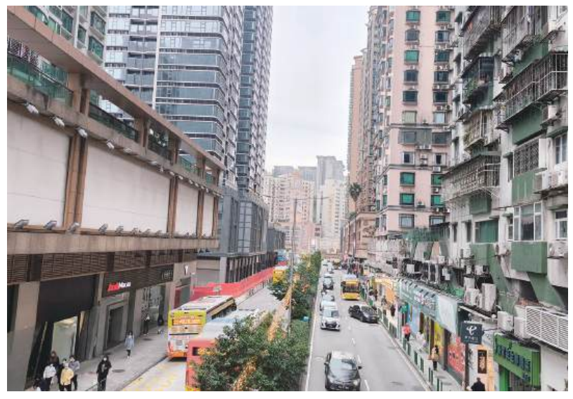
Public buses, cars and taxis drive along Avenida Dr. Sun Yat Sen yesterday where a newly completed residential building (far, left) is located.

According yesterday's to statement, the upcoming roadwork project will be carried out on the section between Rotunda Dr. Sun Yat Sen and Rotunda Ouvidor