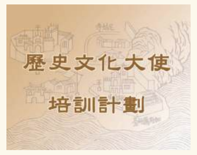
This poster provided by the Macao Foundation (FM) yesterday promotes the upcoming 9th History and Culture Ambassador Training Programme.

Since 2018, eight editions of this programme have been held, training nearly 1,000 ambassadors