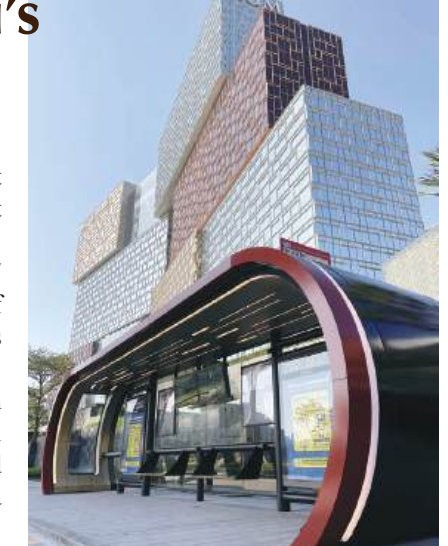
This undated handout photo recently provided by integrated resort operator MGM shows Macau's first distinctive bus shelter outside MGM COTAI.

The statement said that the bus shelter's design was generated using artificial intelligence (AI), drawn from crafted prompts from the MGM Design Team. The statement added that after the initial concept generation, further testing and validation were conducted in collaboration with JCDecaux (Macau) Limited to ensure the structural integrity, safety and overall functionality.