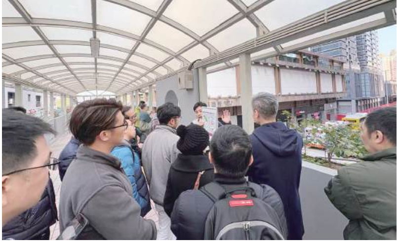
This undated handout photo released by the Transport Bureau (DSAT) yesterday shows a DSAT official briefing members of the Traffic Consultative Council on site about the avenue's upcoming roadwork project, on the footbridge on the avenue's section between Rotunda Dr. Sun Yat Sen and Rotunda Ouvidor Arriaga.

In addition, the statement noted, the three public bus stops on Avenida Dr. Sun Yat Sen's section between Rotunda Dr. Sun held several sessions briefing Yat Sen and Rotunda Ouvidor Arriaga, namely outside the Chun Leong Garden, Chun U Villa, and adverse impact of the project's Treasure Garden residential estates