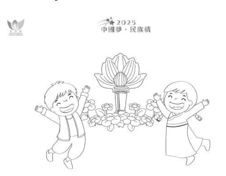
This image provided by the Municipal Affairs Bureau (IAM) yesterday shows one of the colouring sheets for its upcoming Children's Creative Colouring Competition themed "Chinese Dream, Homeland Ties".

There will be one first prize, one second prize, one third prize, three merit prizes and 10 selected prizes in each of the two categories, the statement said, adding that winners will receive shopping coupons, book coupons and trophies, and the winning entries will be displayed at the