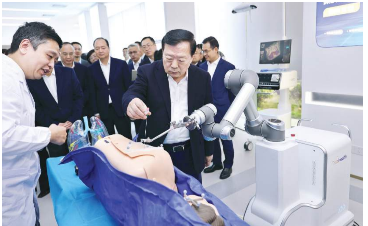
State Council's Hong Kong and Macao Affairs Office (HKMAO) Director Xia Baolong (centre) tries out medical equipment at a health tech company in Hengqin on Friday.