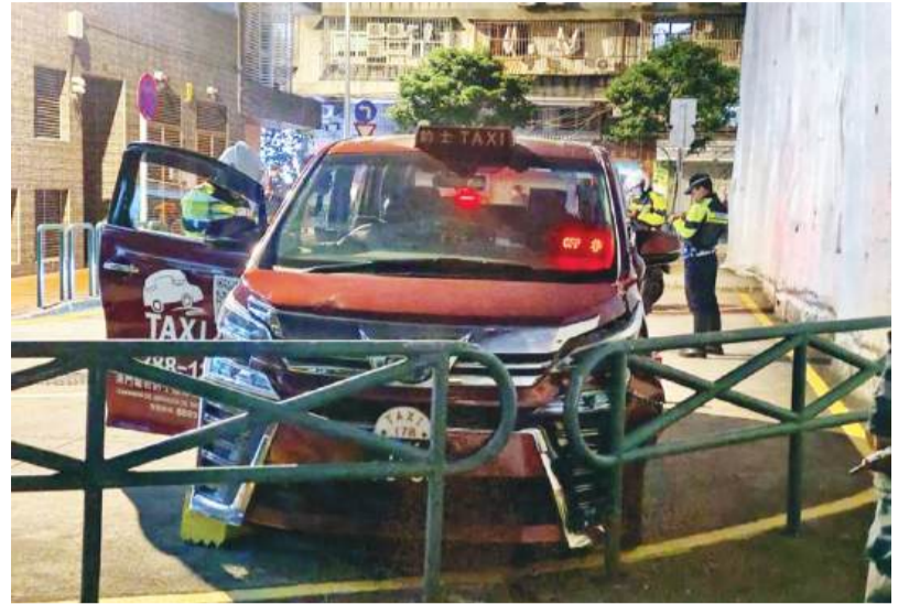
This photo taken on Friday night shows a taxi that hit a railing at the entrance to the public car park on Rua de Francisco Xavier Pereira (俾利喇街) near Mong In Building (望賢樓).

In addition, a 63-year-old local bus driver hit the kerb at the section