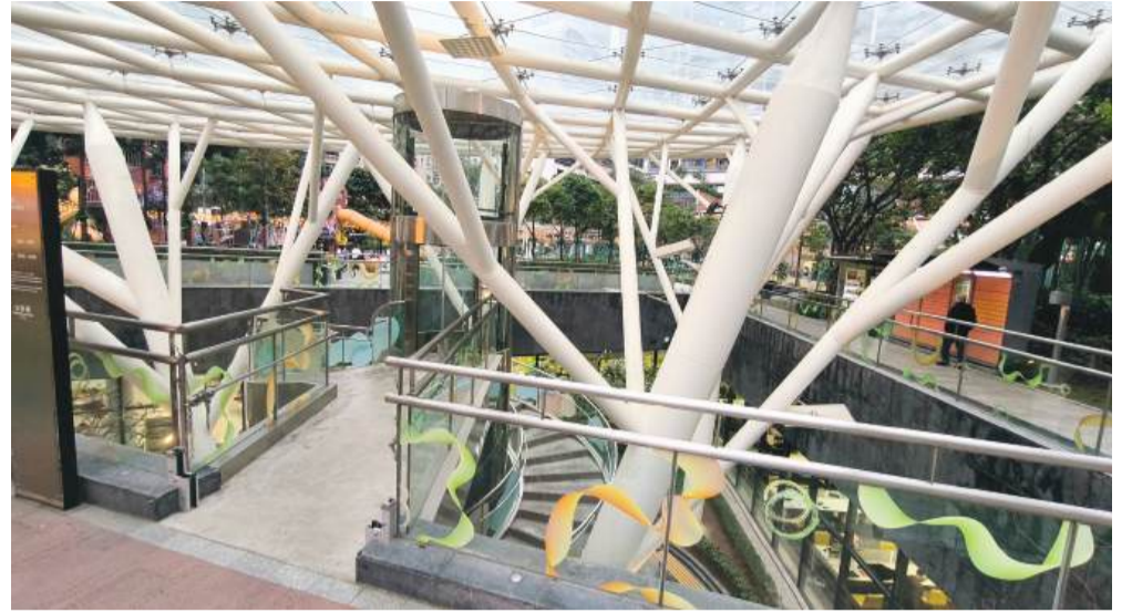
This photo taken on Saturday shows the entrance to the public library in Taipa Central Park.

The findings noted that the libraries’ borrowing systems were generally appreciated, but still 25.25 percent of the respondents expressed