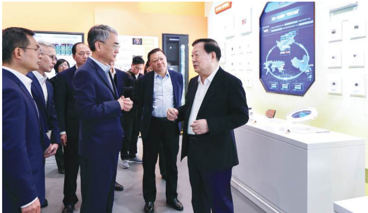
State Council's Hong Kong and Macao Affairs Office (HKMAO) Director Xia Baolong (right) talks with Secretary for Administration and Justice André Cheong Weng Chon (front, second from left) at the "Music on the TM River" complex in Hengqin on Friday. Cheong heads the zone's executive committee.