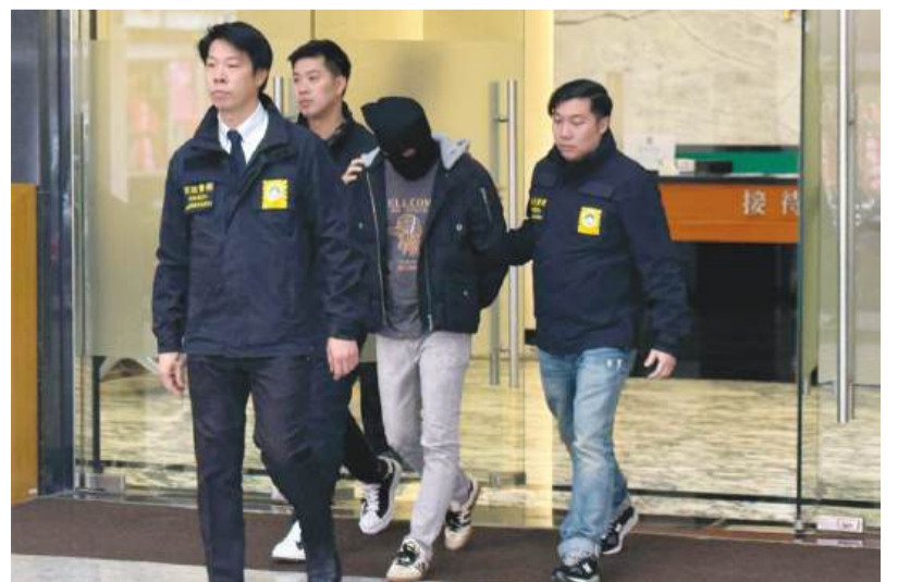
The hooded suspect from the mainland is escorted by Judiciary Police (PJ) officers from the PJ headquarters in Zape to a police vehicle on Friday.

As noted by Ho, the other two suspects were still at large at the time of Friday's press conference. ■