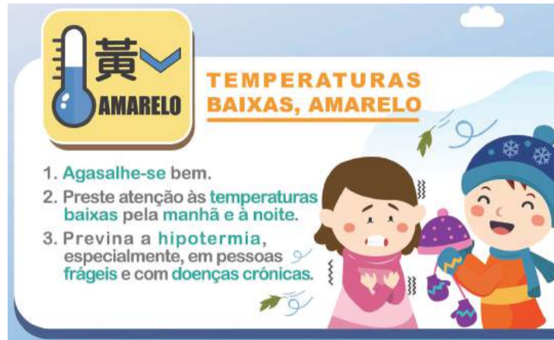
This image taken from the Macau Meteorological and Geophysical Bureau's (SMG) website last night urges residents to bundle up when the Yellow cold weather alert has been issued.

The statement stressed that family members and relatives should care for and assist the elderly and encourage and remind them to take