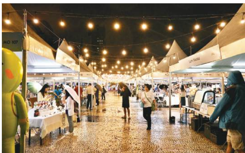
This photo taken in November last year shows stalls and fairgoers at Tap Siac Craft Market in Autumn.

**The post had also reported on IC's call for stall operators and workshops on Thursday. ■