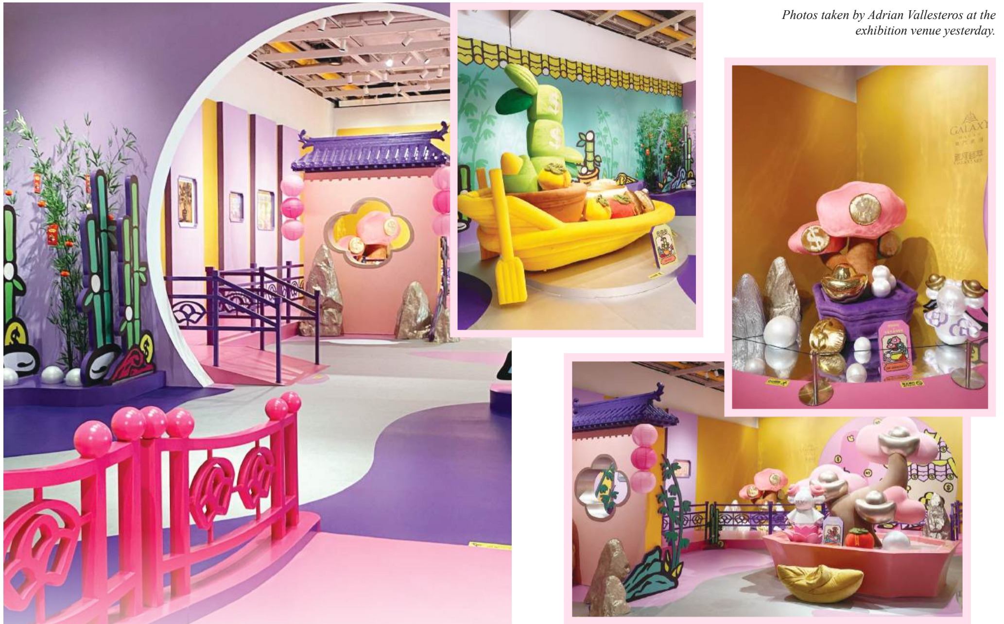
at the exhibition venue yesterday.