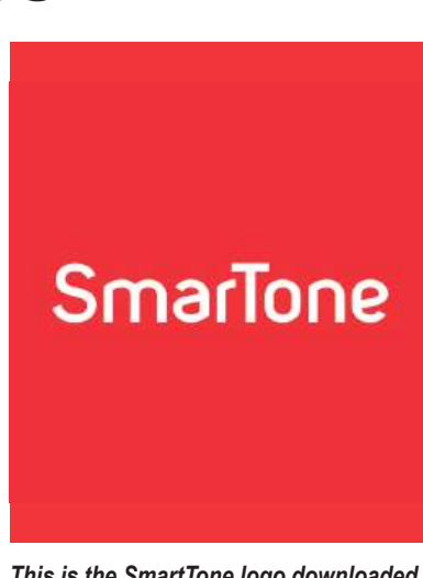
This is the SmartTone logo downloaded from the telecom operator's FaceBook account last night.

After SmarTone's exit from the local telecom market, there will be only three telecom operators running 4G services, namely CTM, and China Telecom (Macau) Company Limited and 3 Macau, with the former two running 5G services as well. ■