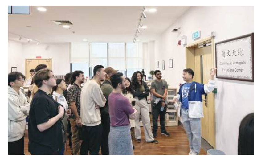
This undated handout photo taken from the website of the University of Macau (UM) yesterday shows international students taking part in a campus tour conducted by a UM Student Ambassador (right).

According to the statement, "international students agree that the campus tours have helped them quickly familiarise themselves with the campus environment". The statement noted that the tour is not limited to international students but also available by appointment for groups, organisations, families, prospective students, and academic staff visiting exchange for programmes. "A Day at UM" is a free tour organised by the university's Office (CO). Communications which has led over 2,300 such tours, according to the statement. Groups of 10 or more members can attend per session. Two sessions of the tours, each lasting about an hour and a half, are offered from Monday through Saturday. The tours are available in English, Putonghua, and Cantonese. The tours are guided by UM's Public Relations (PR) Student Ambassadors, being "docents* to introduce the campus facilities and a brief history of UM, and