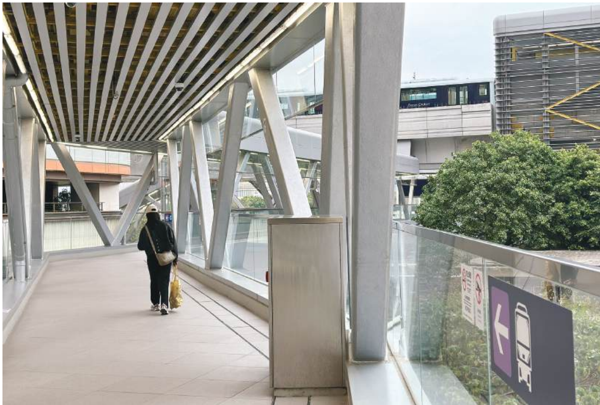
A passenger walks towards the entrance to the LRT Seac Pai Van Line in Coloane yesterday.

The government-appointed Taipa and Coloane Community Service Consultative Council held a regular closed-door meeting yesterday at the Islands District Public Services Centre in Seac Pai Van, during which officials from the LRT operator, Macau Light Rapid Transit Corporation Limited (MLM), as well as the Transport Bureau (DSAT) were invited to brief members of the council on the optimisation of the carrying capacity and public transport frequency at the Macau side of the Hengqin joint checkpoint to be able to handle the increase in passengers under the mainland’s new policies of “One-Week, One-