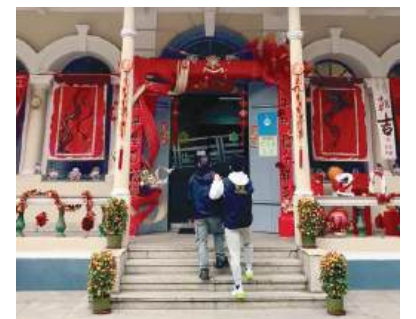
This undated photo provided by the Public Security Police (PSP) yesterday shows a police officer escorting the local suspect to a police station in the northern district.