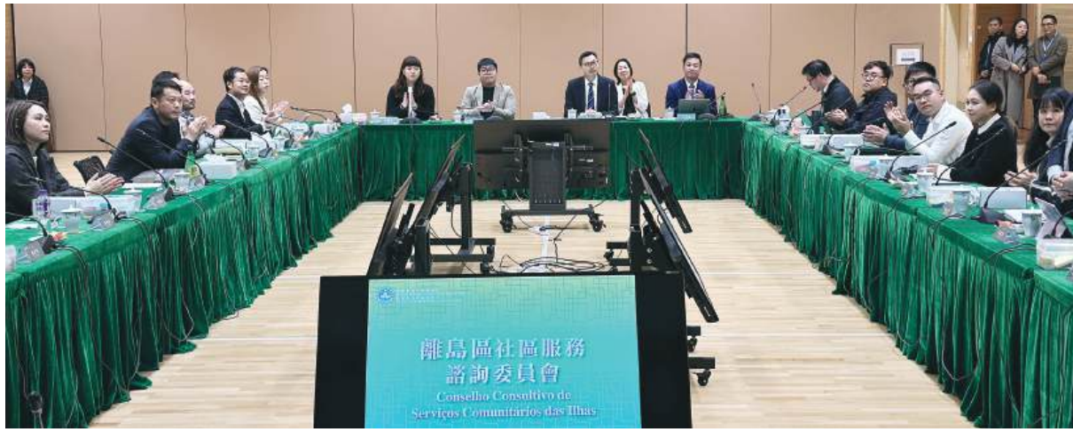
The government-appointed Taipa and Coloane Community Service Consultative Council holds a regular meeting at the Seac Pai Van Community Complex in Coloane yesterday.