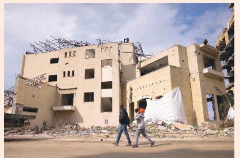
Palestinians walk past the heavily-damaged Roots Hotel in western Gaza City yesterday, amid the current ceasefire deal in the war between Israel and Hamas. – AFP

Under the current ceasefire, which took effect on January 19 after 15 months of war, 21 hostages – 16 Israelis and five Thais – were released from Gaza in exchange for hundreds of Palestinian detainees freed from Israeli jails. During the first phase of the agreement, which spans six weeks, 33 Israeli hostages and about 2,000 Palestinian detainees are expected to be released. (More on p. 10) – Xinhua