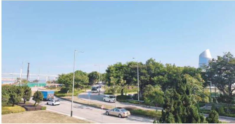
Vehicles drive along Avenida Dr. Sun Yat-Sen on the Nape waterfront near the Macau Science Centre (MSC) on Monday where construction of a sea-crossing flyover linking with Zone A (left) started late last year.