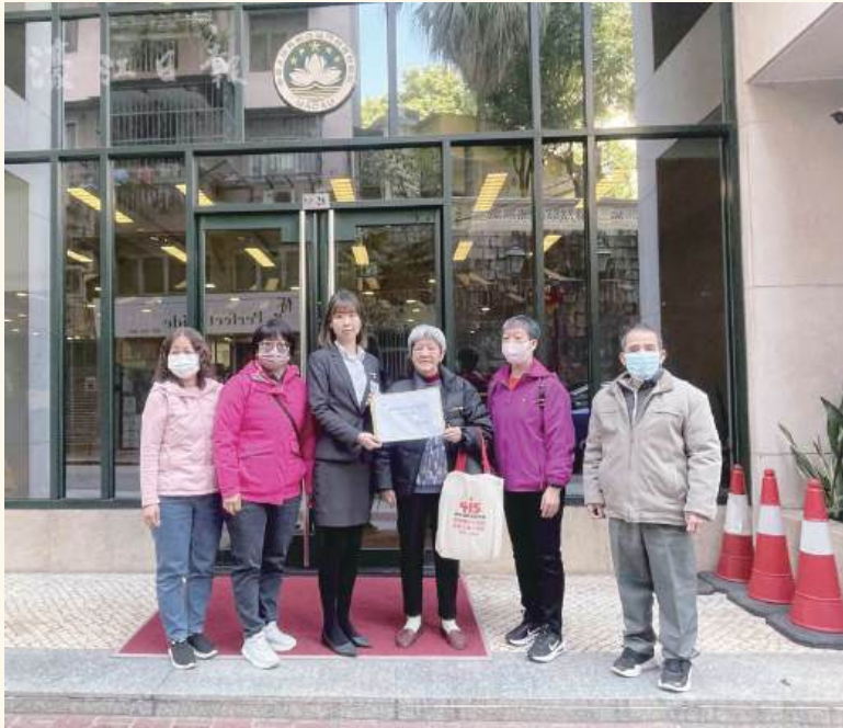
Several Ilha Verde residents hand a petition addressed to the Chief Executive to an official (third from left) in front of Government Headquarters yesterday.

Therefore, the group petitioned the government to relax the area’s height restrictions, allowing buildings to be reconstructed with seven or more floors so that lifts can be installed, thereby improving accessibility for older residents. ■