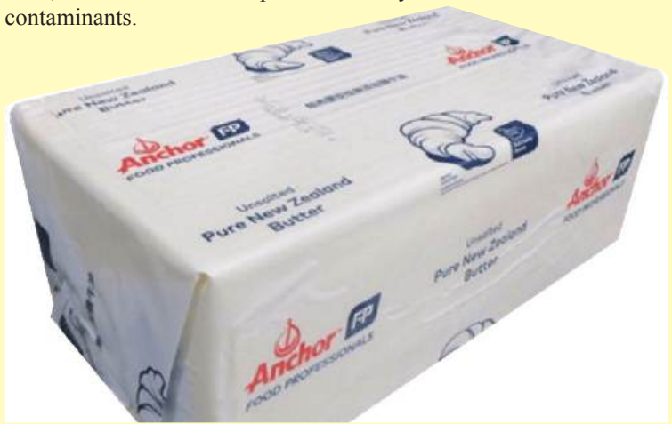
This undated handout photo provided by the Municipal Affairs Bureau (IAM) yesterday shows the problematic New Zealand-made unsalted butter product marketed by the "Anchor" brand.

Anyone who has food-related enquiries may call the IAM's Food Safety Hotline on 2833 8181. ■