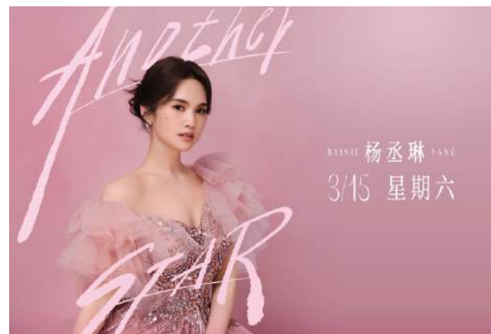
This poster recently provided by The Venetian Macao promotes the “Rainie Yang Another STAR Concert”, which will take place at The Venetian Arena on March 15.

The concert is set to start at 8 p.m. and tickets are priced between 480 and 1,680 patacas, with ticketing details available on www.cotaiticketing.com and www.macauticket.com . ■