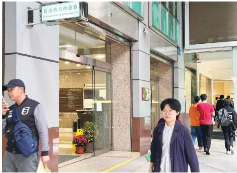
Pedestrians walk past the Financial Services Bureau (DSF) on Avenida da Praia Grande yesterday. The bureau handles the government's annual "wealth-sharing" handout payments.

He also said that the handout scheme could enhance people's sense of gain, yet he also pointed out that it might lead to rising prices, which would be detrimental to the overall interests of Macau, "due to the fact that certain groups – such as people not residing in Macau who choose to save the amount in local banks until they return specifically to Macau to withdraw it, resulting