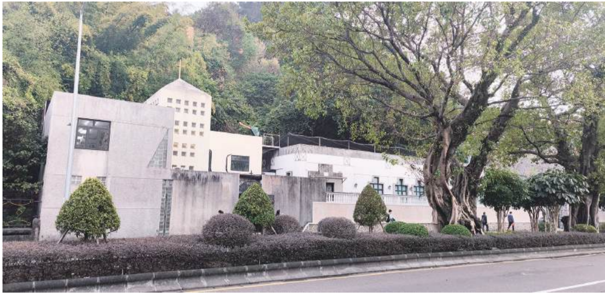
This photo taken yesterday shows part of the Diocesan Funeral Parlour, including its columbarium (left), on Avenida do Almirante Lacerda.

Urban condition draft plans must be discussed and approved by the government-appointed Urban