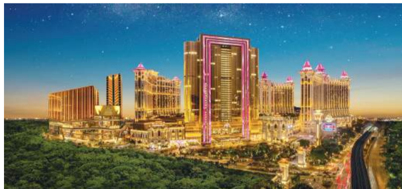
This image provided by Galaxy Macau yesterday shows its sprawling property in Cotai.