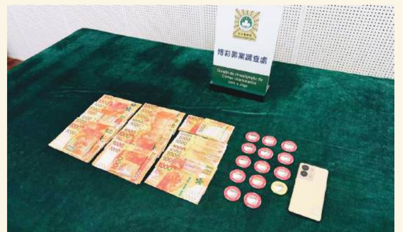
This handout photo provided by the Judiciary Police (PJ) yesterday shows evidence such as HK dollar banknotes and casino chips displayed during yesterday's special press conference at the PJ headquarters in Zape.