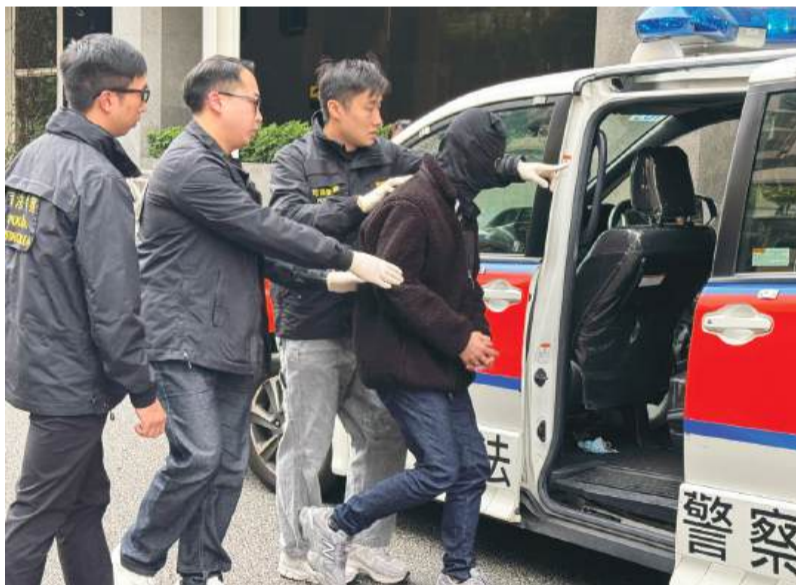
Judiciary Police (PJ) officers escort the drug suspect from the PJ headquarters in Zape to a PJ vehicle after yesterday's special press conference.

The police found 108 packs of cocaine which weighed 44.2 grams, with an estimated street