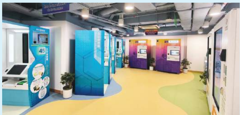
These photos taken yesterday show the new 24/7 government self-service centre on the ground floor of the Three Lamps Complex Building on Rotunda de Carlos da Maia (colloquially known as "Three Lamps" roundabout - 三盞燈).