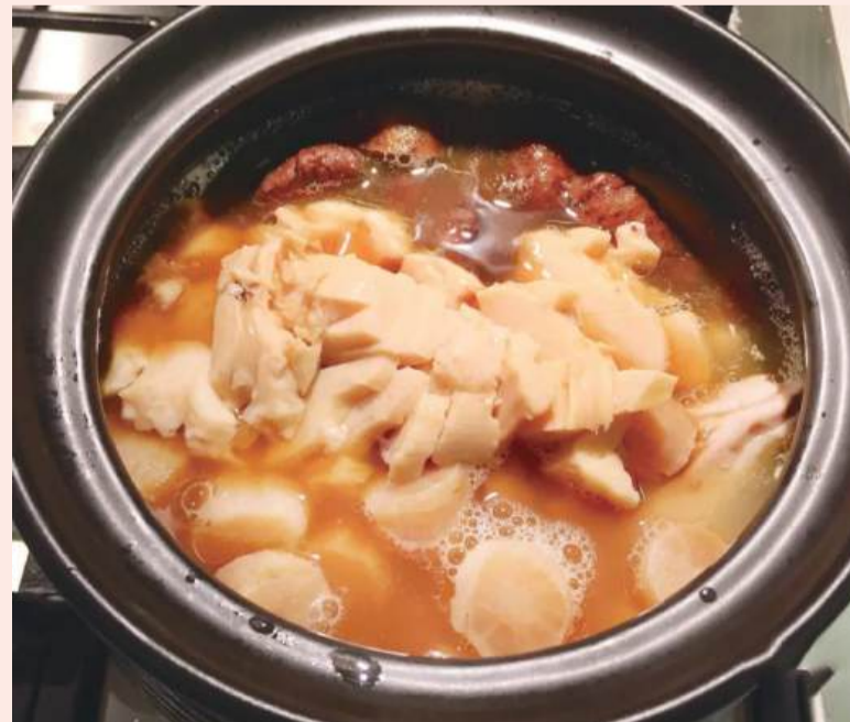
This undated file photo shows a bowl of "Buddha Jumps Over the Wall" stew.