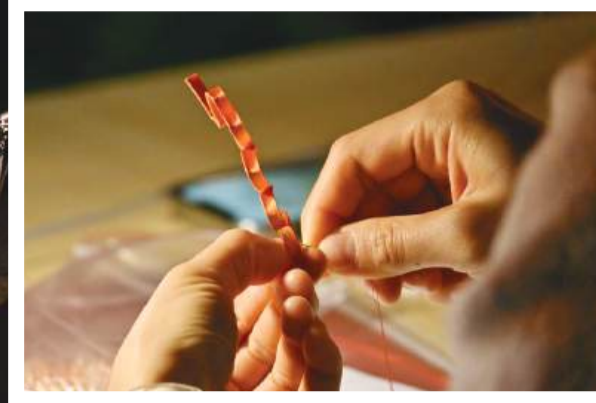
Revellers take part in the different activities in last night's "Celebration of the Chinese New Year of the Snake" at Albergue SCM.