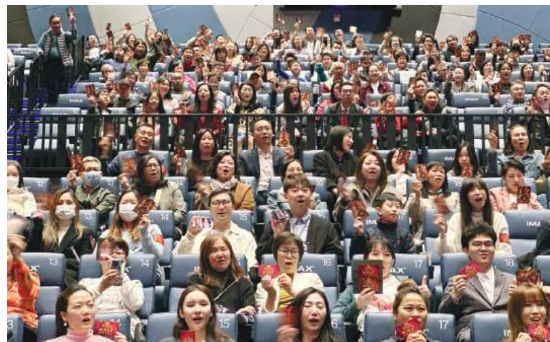
This photo taken yesterday shows "Ne Zha 2" audience members waving their tickets before the start of the movie.