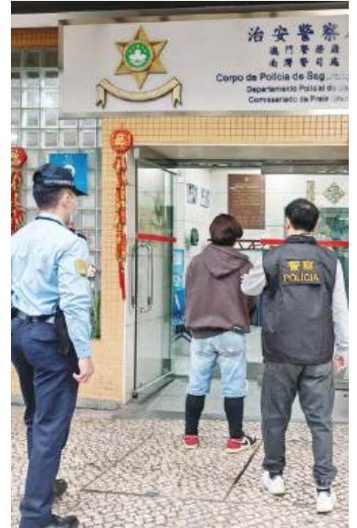
This undated photo provided by the Public Security Police (PSP) yesterday shows PSP officers escorting the Philippine theft suspect to a police station.

After scrutinising the police forces' citywide CCTV camera system, the Public Security Police identified the suspect and arrested him on Monday near Rua de Santo António (花王堂街) and found the phone in his pocket, the