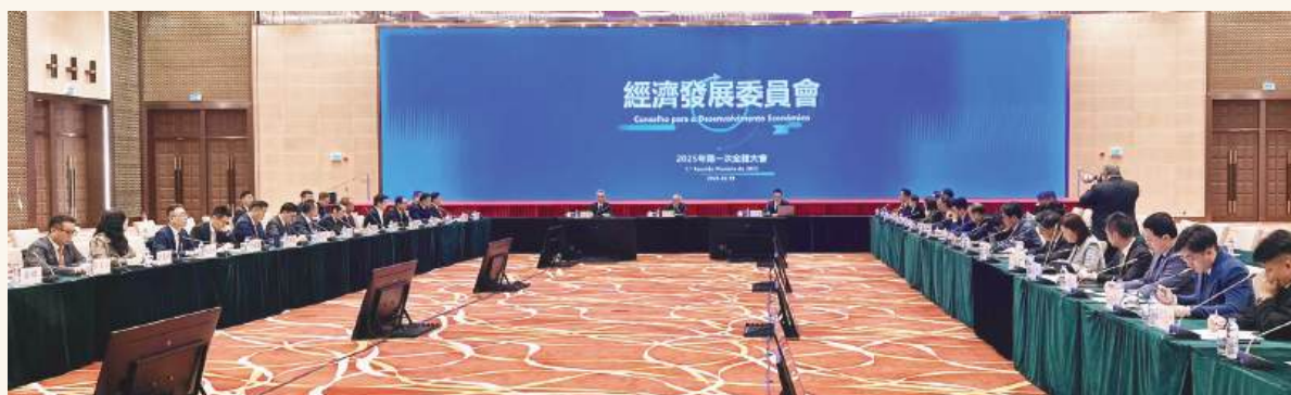
37 members of the Economic Development Council attend yesterday's plenum.

** Appropriately diversified development refers to the framework of the government's "1+4" appropriate economic diversification model, which aims to consolidate and diversify the development of the city's tourism and leisure industry while putting special emphasis on promoting the development of four diversified industries, namely 1) big health, 2) modern finance, 3) high-tech, and 4) MICE as well as culture and sports.