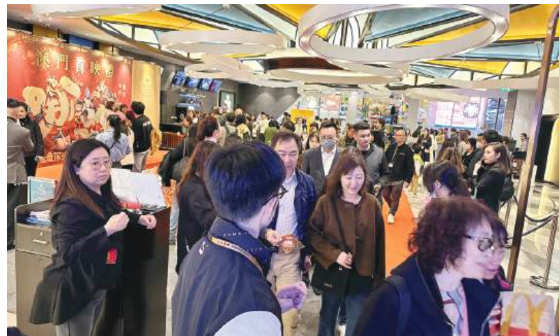
Filmgoers for "Ne Zha 2" mega-blockbuster queue while entering Emperor Cinemas at Lisboeta in Cotai before the film's premiere yesterday evening.