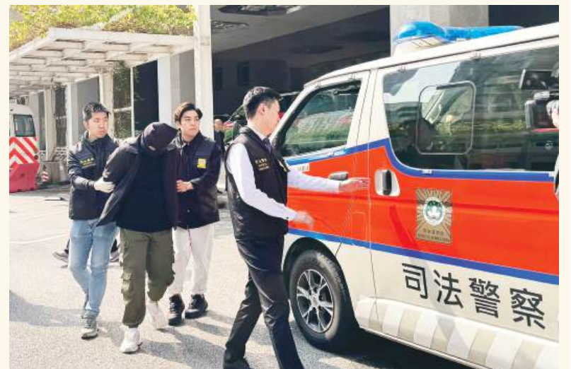
Judiciary Police (PJ) officers escort the suspect from the PJ headquarters in Zape to PJ vehicle after yesterday's special press conference.