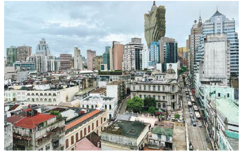
This file photo taken last year gives a bird's eye view of part of the city centre.

Citing figures from the Financial Services Bureau (DSF), the report also noted that "the number of new home sales remained at a low level", with a transaction volume of 3,057 in the local residential market and pre-sale transactions recorded last year. It added that while new home sales increased in the second half of the year due to the launch of