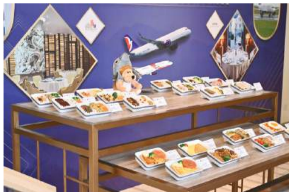
This photo shows some of the dishes to be on offer for Air Macau's in-flight dining experience.