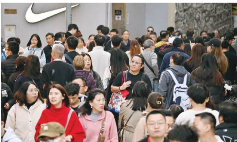
Visitors walk near the UNESCO World Heritage-listed Ruins of St. Paul's earlier this month.

Foreign visitors rose by 21 percent to 241,131, or 6.6 percent of the total number of visitor arrivals in January, mostly from South Korea (65,659) and the Philippines (48,499). ■