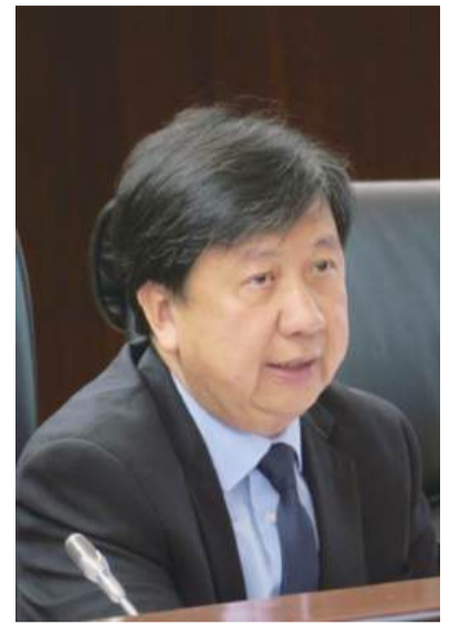
Secretary for Transport and Public Works Raymond Tam Vai Man addresses yesterday's plenary session in the Legislative Assembly's (AL) hemicycle.

Moreover, Tam also pledged that the government will study the