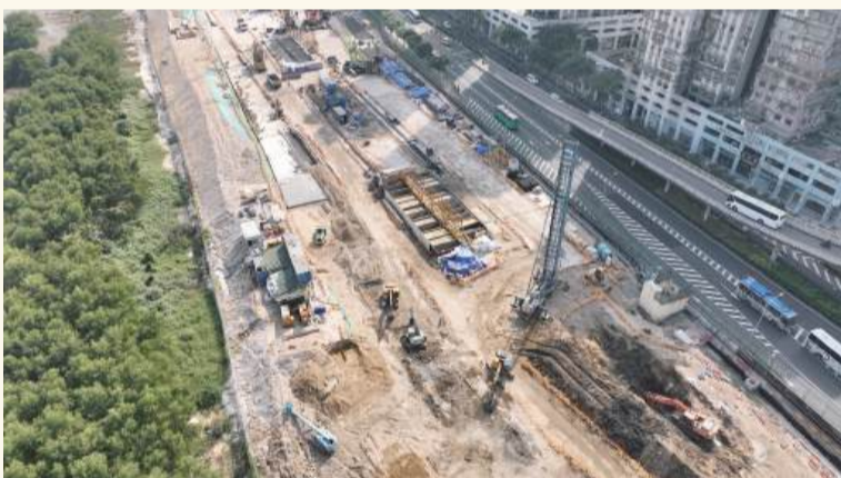
This handout photo downloaded from the Public Works Bureau's (DSOP) website yesterday shows the ongoing LRT East Line project next to the Barrier Gate checkpoint in December last year.

The ongoing LRT East Line project, without the projected extension to the Qingmao checkpoint, is scheduled to be