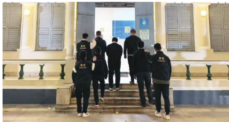
This undated photo provided by the Public Security Police (PSP) yesterday shows the Mark Six quintet being escorted to a police station in the northern district.