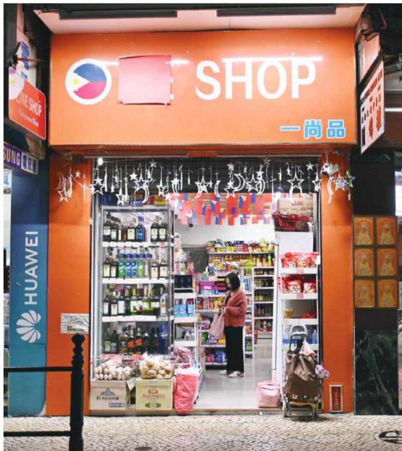
A customer buys products from a shop in the city centre that mainly sells Filipino products.

In the statement, members of the public who find stranded dolphins are urged to inform the bureau by calling the hotline on 2833 7676. ■