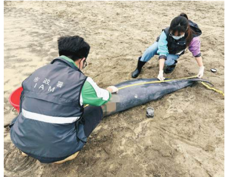
This handout photo provided by the Municipal Affairs Bureau (IAM) on Saturday shows two IAM officials measuring the dolphin carcass washed ashore at Hac Sa Beach in Coloane.