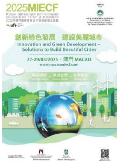
This poster provided by the organisers on Friday promotes next month’s 2025 Macao International Environmental Co-operation Forum & Exhibition (2025MIECF).

*The Robot Dog B2 is produced by Unitree Robotics , a Chinese company specialising in the development and manufacturing of advanced robotics, particularly quadruped robots. Unitree Robotics is known for its innovative and high-performance robotic products, including the B2 model, which is designed for various applications such as research, education, and industrial use. – DeepSeek