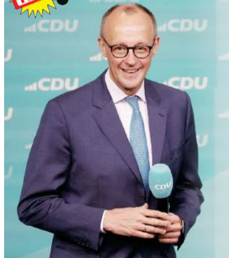
Friedrich Merz, leader of Germany's victorious Christian Democratic Union (CDU) and likely next chancellor, addresses supporters in Berlin after the first exit polls in the German general election yesterday.

BERLIN – Germany's conservatives won yesterday's elections, with their leader Friedrich Merz set to become the next chancellor, followed by the far-right AfD in second place after record gains, according to exit polls.