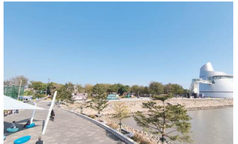
This photo taken earlier this month shows the Macau Science Centre (MSC) and its nearby Kun lam Statue Waterfront Leisure Area.

also the legislature’s vice-president, suggested during the plenary session that the government use an undeveloped plot next to the Macau Science Centre complex for its future expansion, adding that the future phase two of the Macau Science Centre would become a new landmark in the future, attracting more visitors to the facility