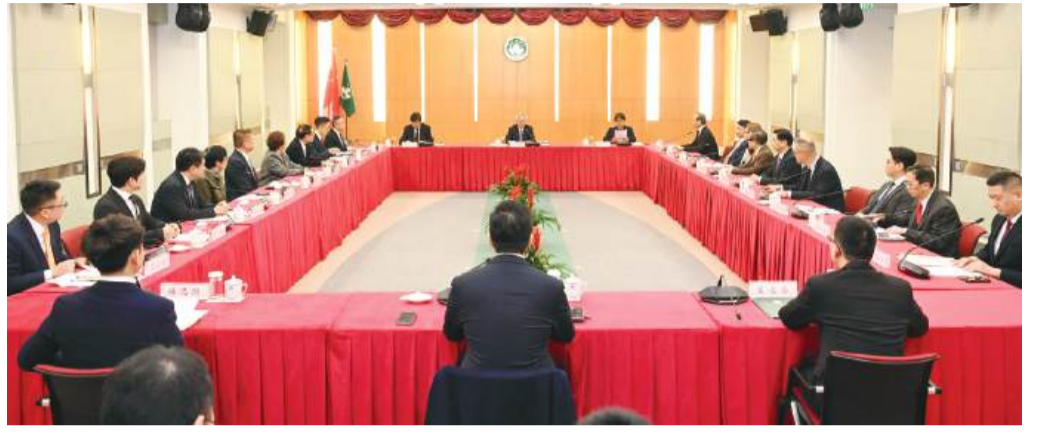
These handout photos provided by the Government Information Bureau (GCS) on Friday show Chief Executive Sam Hou Fai (centre) addressing separate meetings with members of the Macau General Union of Neighbourhood Associations (left) and the Association of Returned Overseas Chinese Macau.