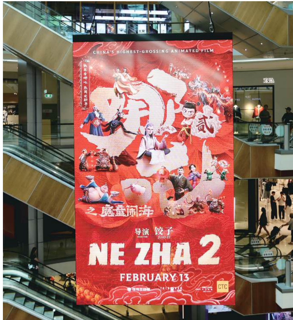
This photo taken on February 13 shows a huge poster for the Chinese mega-blockbuster "Ne Zha 2" displayed at a shopping mall in Sydney, New South Wales, eastern Australia.

"The film is breaking records worldwide at exceeding levels, but it hasn't really been marketed at all in the West – there wasn't even a poster up and the trailers cannot be seen anywhere. The only people that know about this are those in the Chinese community or those who know people in the Chinese community... Just imagine how this film