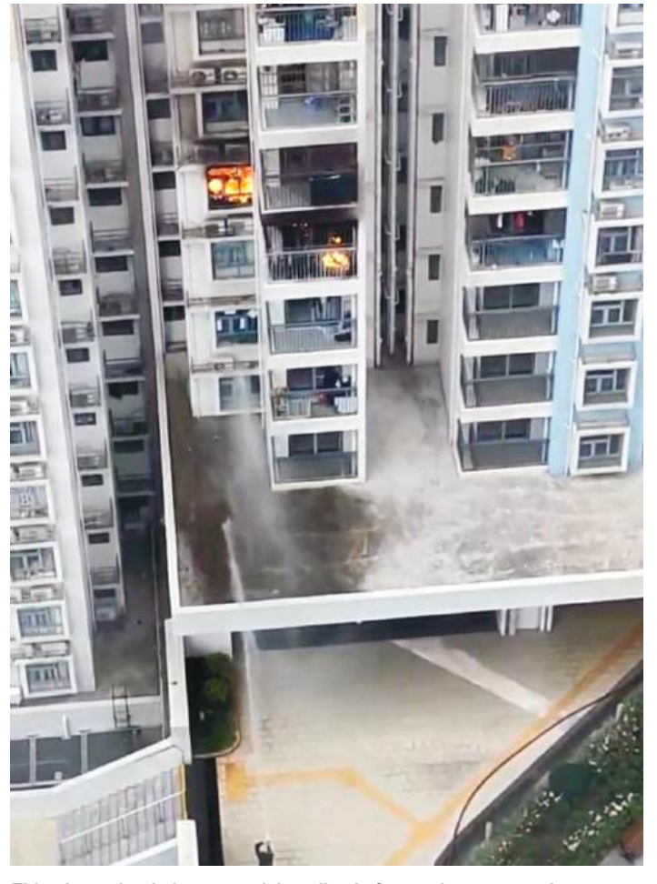
This photo circulating on social media platforms shows yesterday morning's fire in a flat of Block 5 of Lago ("Lake") Building in Taipa.

* An open hose and airway rescue refers to a specialised rescue technique used in emergency situations, particularly in confined spaces or environments where people are trapped and require immediate access to breathable air. This method involves deploying a hose or similar device to provide a continuous supply of fresh air to the victims while rescuers work to extricate them safely. – DeepSeek