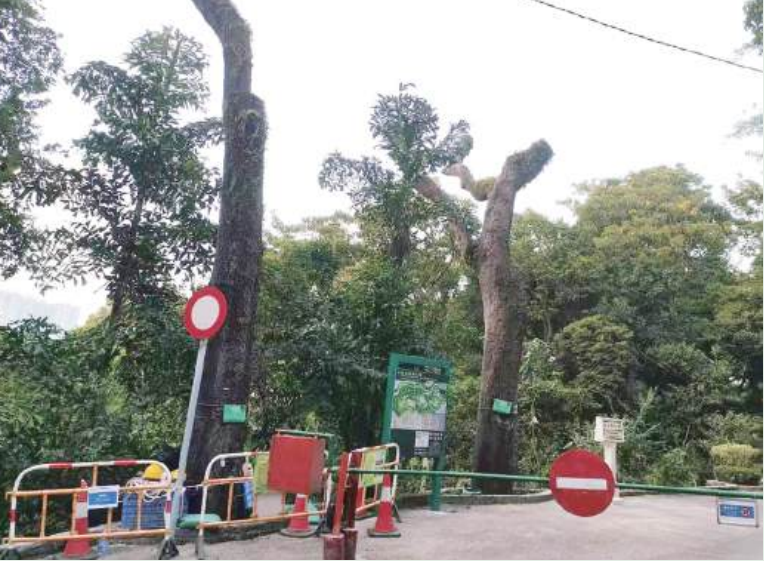
This undated handout picture provided by the Municipal Affairs Bureau (IAM) yesterday shows the two sick candlenut trees that are about to be removed.

Kong's stock market ended 23,341.61 points. points, and the Hang Seng Tech lower yesterday with the The Hang Seng China Index fell 1.19 percent to end at benchmark Hang Seng Index Enterprises Index fell 0.55 5,789.52 points.