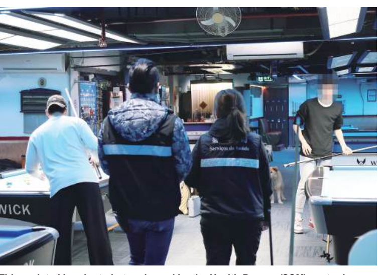
This undated handout photo released by the Health Bureau (SSM) yesterday shows its anti-smoking staff inspecting a snooker hall.

In addition to the 3,941 cases of illegal smoking, according to yesterday's statement, the bureau, in conjunction with inspectors from other relevant public entities, last year fined 138 travellers for bringing e-cigarettes