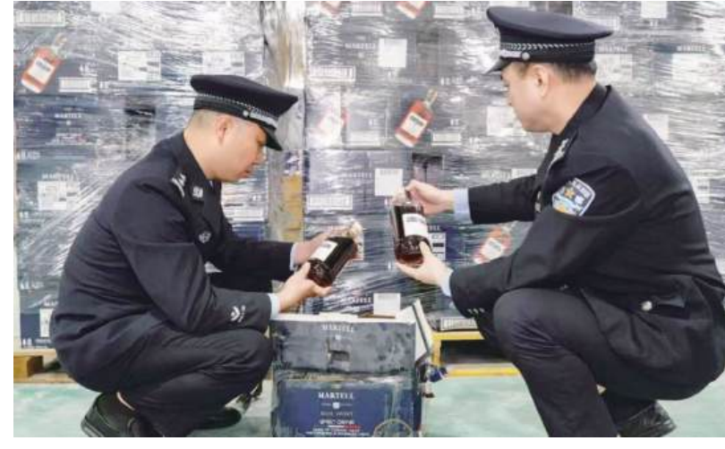
This undated handout photo provided by the Gongbei Customs yesterday shows customs officers checking contraband alcohol.

In June 2024, the anti-smuggling department of Gongbei Customs, in conjunction with the anti-smuggling departments of Haikou and Jinan customs, carried out arrests by sending 419 police officers to carry out the anti-contraband operation in Haikou, Jinan, Zhuhai, and other places, and successfully seized a series of cases of smuggled imported