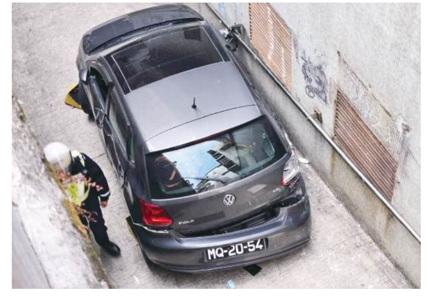
A police officer stands near the damaged car involved in vesterday's film-shoot accident in Calçada de Francisco António, with glass scattered in the lane.