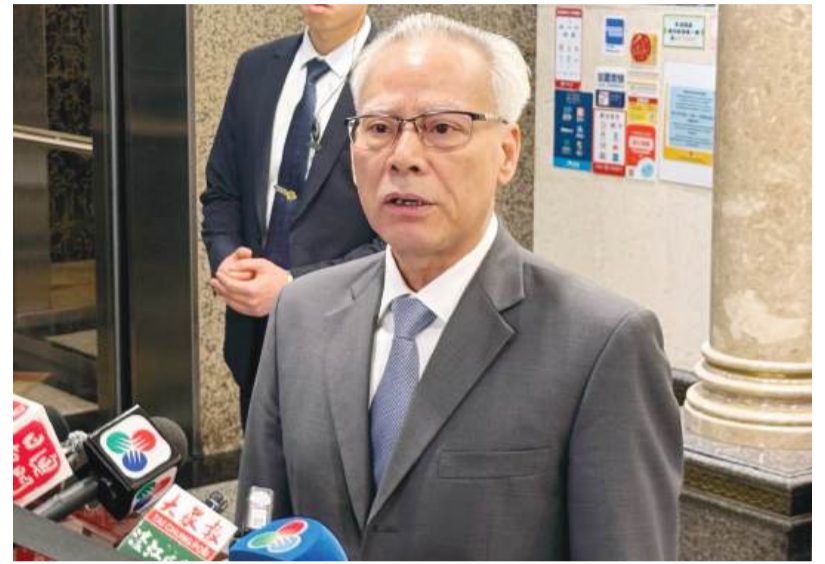
Chief Executive Sam Hou Fai speaks to the media on the sidelines of the Macau Chinese Enterprises Association's Spring Gala at The Plaza Restaurant in Zape yesterday.

Sam made the remarks on the sidelines of the Macau Chinese Enterprises Association's Spring Gala at The Plaza Restaurant in Zape. ■