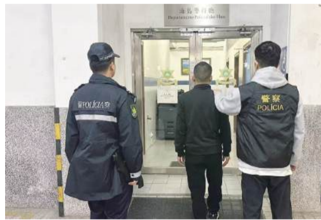
This undated photo provided by the Public Security Police (PSP) yesterday shows PSP officers escorting the mainland theft suspect to a police station.

The suspect has been transferred to the Public Prosecutions Office (MP), facing a theft-by-finding charge, according to the spokesperson. ■