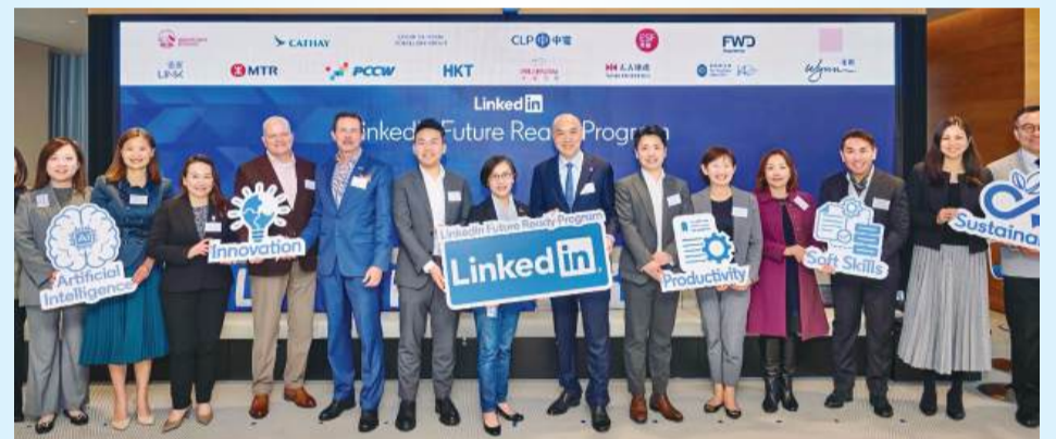
This undated handout photo downloaded from Wynn's website last night shows representatives from various organisations during the recent launch of the Future Ready Programme.

The statement added that the company believes that participation in this programme will help attract and retain top talent, equip staff with the necessary skills and knowledge to thrive in the future and enhance Wynn's "soft power", according to the statement.