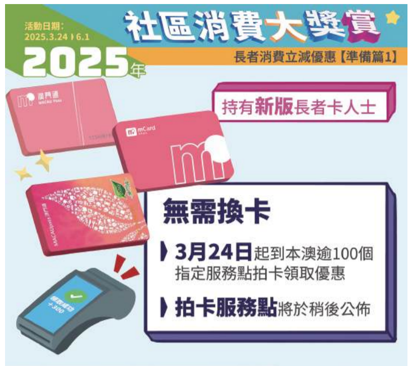
This poster provided by the Economic and Technological Development Bureau (DSEDT) yesterday reminds holders of the latest version of the Senior Citizen Macau Pass to top up their card at designated service points for 300 patacas in discounts.

According to the statement, the service points for card renewals include the Macau peninsula’s Family Service Centre of the Macau