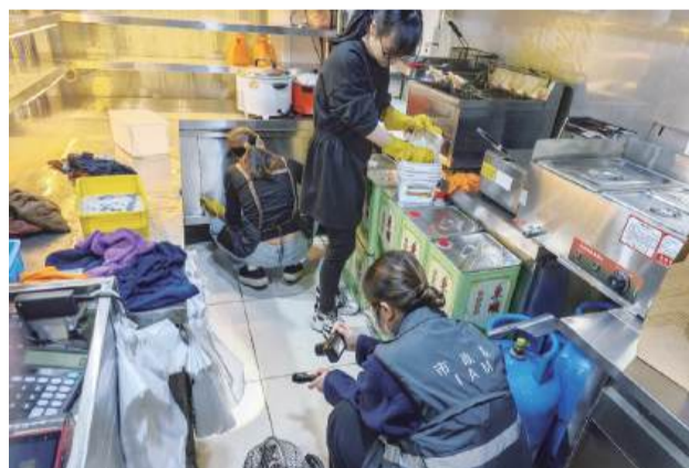
This handout photos provided by the Municipal Affairs Bureau (IAM) yesterday shows IAM inspectors at the "Do Mao Mao Shop" (躲貓貓外賣店) eatery investigating the takeaway's rodent infestation and hygiene issues.

The statement highlighted the responsibility of the food trade to draw up effective pest control plans, conduct regular inspections of pipes and other facilities and equipment, regularly clean and reduce the accumulation of debris on the premises, and properly store foodstuff with the aim of "effectively" preventing rodents and other pests from entering, hiding and reproducing there. ■