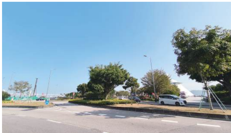
Vehicles drive along Avenida Dr. Sun Yat-Sen on the Nape waterfront near the Macau Science Centre (MSC) earlier this month where construction of a sea-crossing flyover linking with Zone A (left) started late last year.

The government said last year that the Zone A-Nape flyover, with its