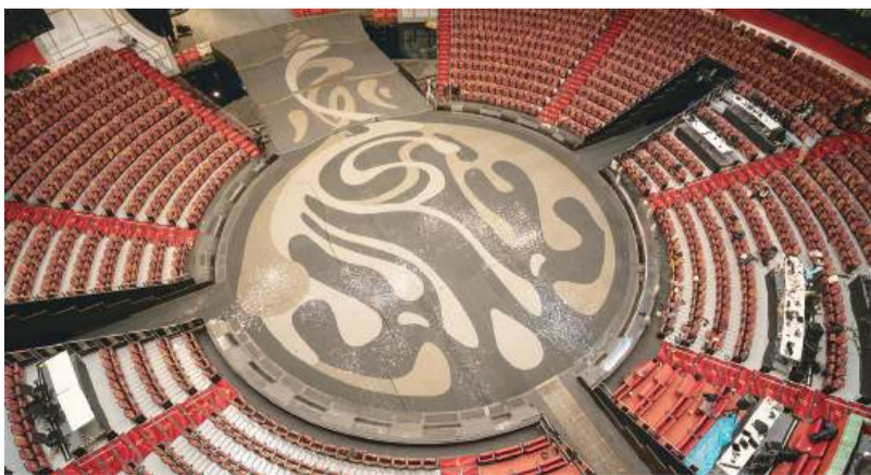
This undated handout photo provided by Melco Resorts & Entertainment last night shows the performance venue for the House of Dancing Water.

Tickets will be available from March 10. ■