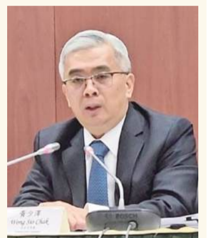
Secretary for Security Wong Sio Chak addresses yesterday's press conference at the S. Francisco Barracks about Macau's 2024 crime statistics.

He also pointed out that due to the Cultural Affairs Bureau's (IC) approval of the film shoot, current laws lack enforcement provisions to lay charges in such incidents. Public Security Police (PSP) Commissioner