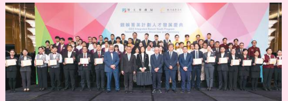
This handout photo taken and provided by Galaxy Entertainment Group (GEG) on Wednesday shows guests and participants posing during the "GEG IR Youth Programme Talent Development Showcase and Ceremony".