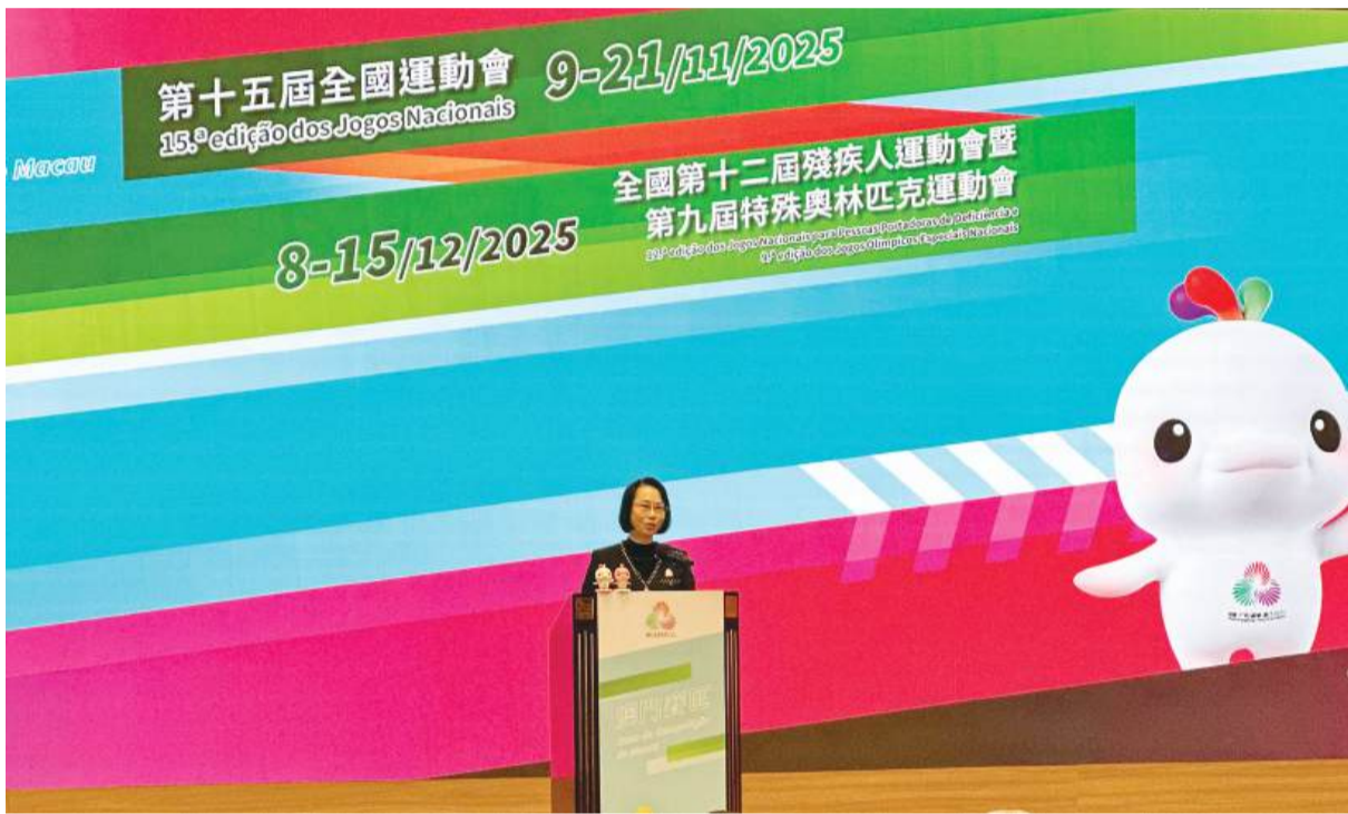
Secretary for Social Affairs and Culture Wallis O Lam delivers a speech during yesterday’s press conference about the upcoming 15 th National Games, the 12 th National Games for Persons with Disabilities (NGD) and the 9 th National Special Olympic Games (NSOG), at the Macau Science Centre in Nape.

According to yesterday’s press conference at the Macau Science Centre in Nape, the schedule for Macau’s competition events is as follows: Table Tennis at Galaxy Arena in Cotai on November 7-20;