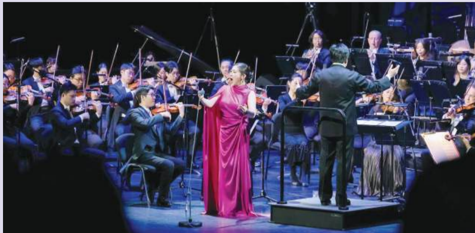
This handout photo provided by Sands China earlier this week shows a performance during the recently held "Concert of Love in Seoul" at The Venetian Theatre in Cotai.