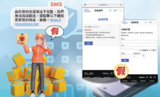
This poster provided by the Judiciary Police (PJ) on Friday warns members of the public of the logistics company “Cai Niao SMS scam”.