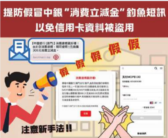
This poster provided by the Judiciary Police (PJ) on Saturday warns members of the public of the “BOC SMS scam”.