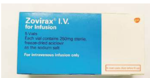
This undated handout photo provided by the Pharmaceutical Supervision and Administration Bureau (ISAF) on Friday shows 'ZOVIRAX IV INFUSION INJ 250MG', produced by Italy-based GlaxoSmithKline Limited.

Residents who are in doubt can seek advice from their attending doctors or call the bureau on 8598 3233 during office hours. ■