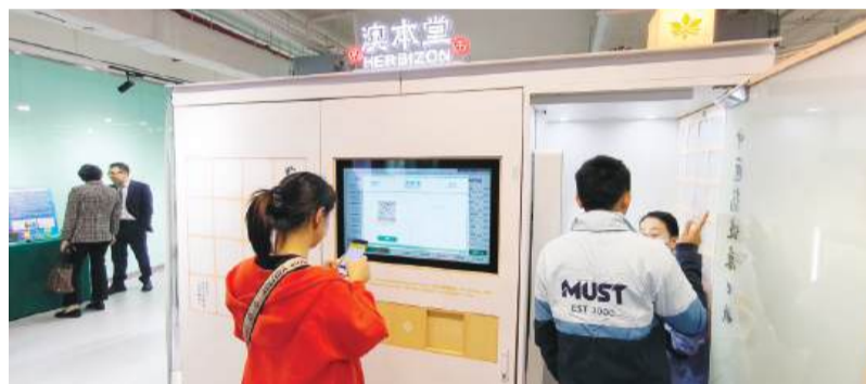
Guests try out the robotic TCM clinic after the session on Thursday.