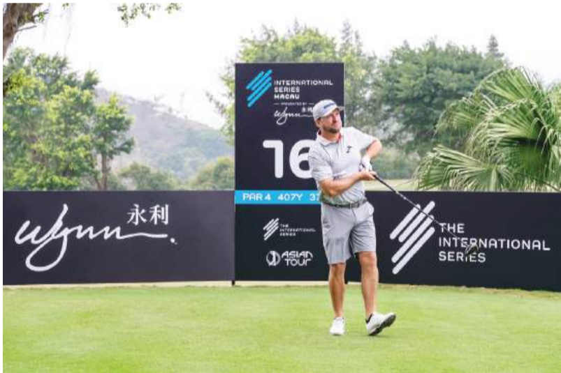
This undated handout photo downloaded from The International Series website last night shows Northern Ireland's Graeme McDowell in action.

Tickets for the event's four-day run are free, with registration available via www.tixr.com ■