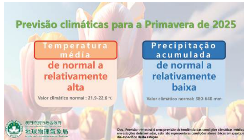
This image provided by the Macau Meteorological and Geophysical Bureau (SMG) on Friday shows its weather forecast for spring.

The bureau also said that the sea surface temperature in the central and eastern equatorial Pacific Ocean has been declining and is in a 'La Niña' state, adding that based on the combined model