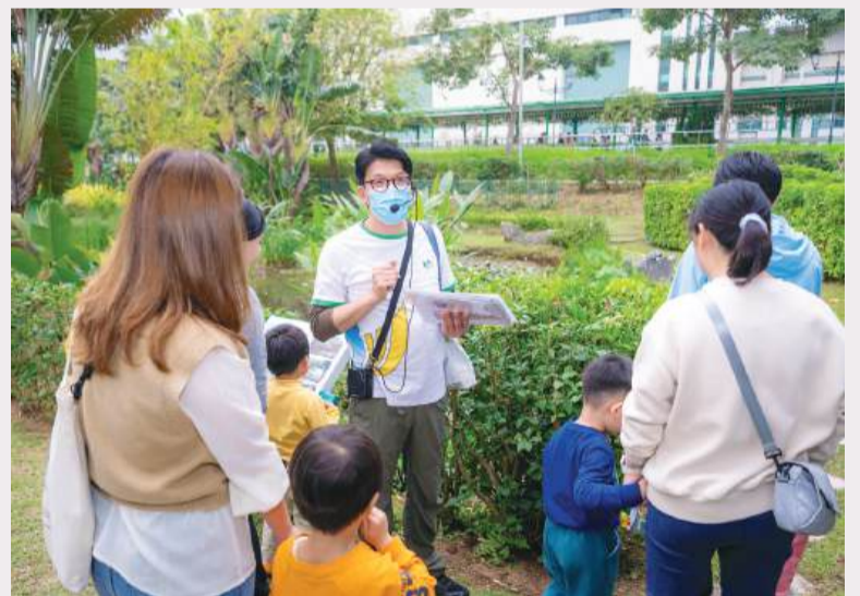
This undated file photo provided by the Municipal Affairs Bureau (IAM) on Friday shows participants taking part in an guided activity during a previous edition of the Macao Green Week.

During the Green Week, the statement said, residents will have the opportunity to participate in a variety of guided eco-tours and hands-on activities designed to showcase Macau's ecological