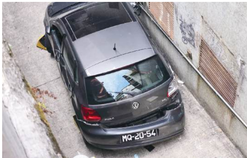
This file photo taken last Monday shows the damaged car involved in the filming accident in Calçada de Francisco António.

Speaking at a press conference about last year’s crime statistics on