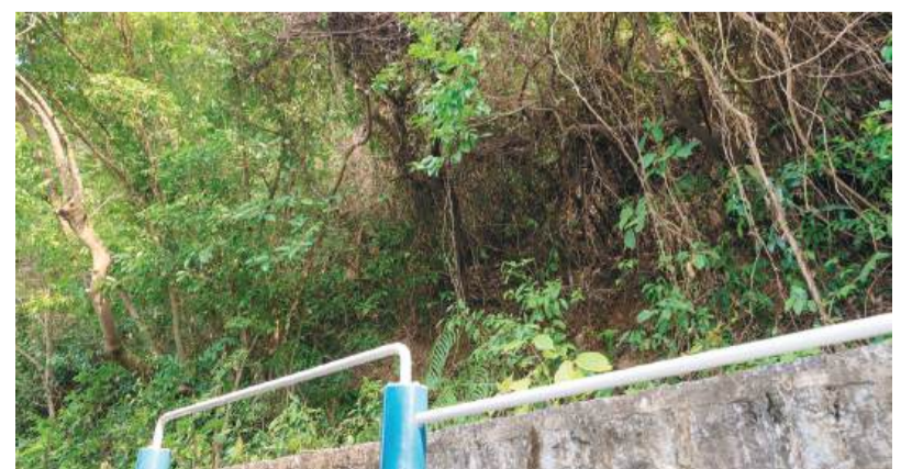
This undated handout photo provided by the Municipal Affairs Bureau (IAM) on Friday shows part of the woodland at the Guia Hill Municipal Park affected by lianas.

**The understory refers to the layer of vegetation in a forest or woodland that grows beneath the main canopy of trees but above the forest floor. – DeepSeek