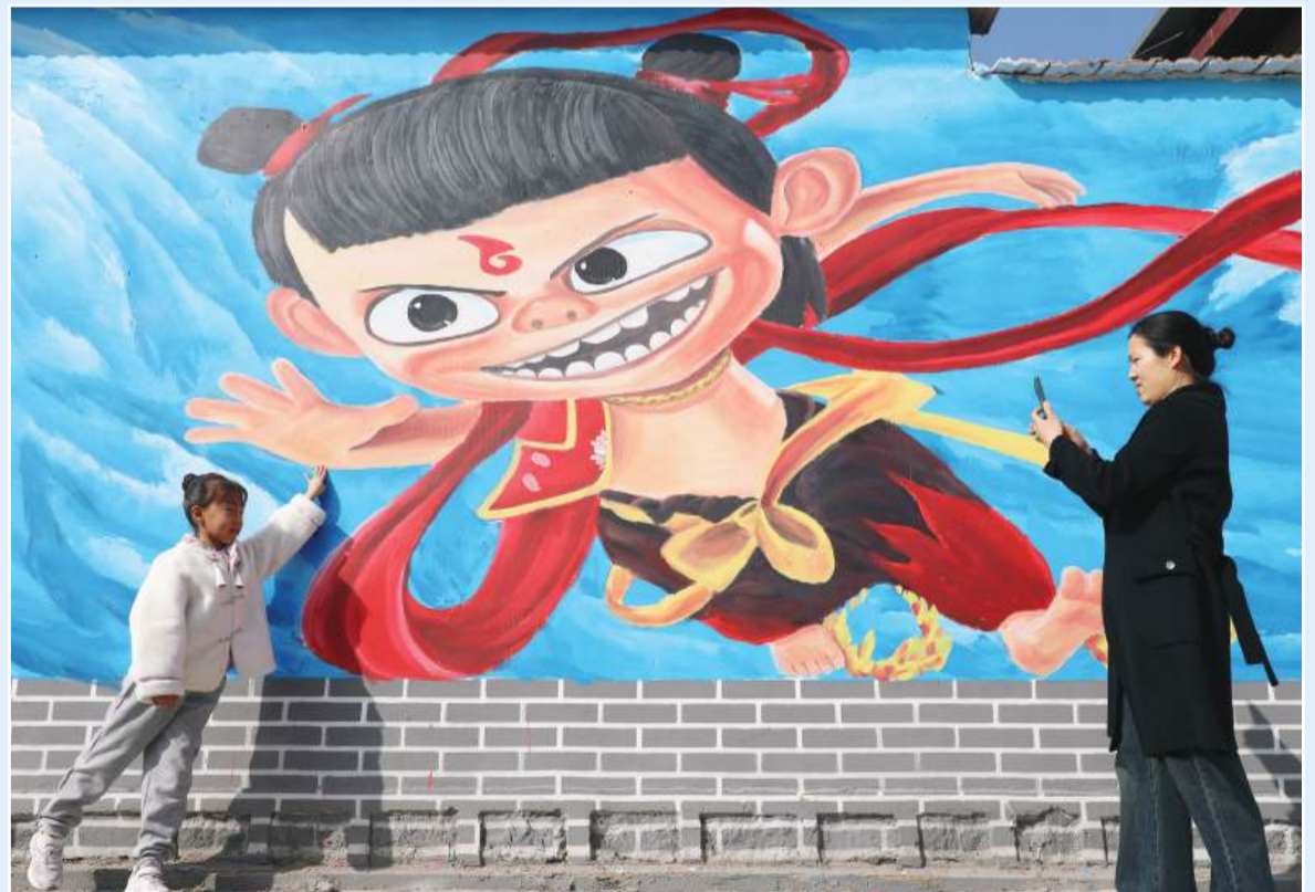
A girl poses for photos with a wall painting featuring the blockbuster animated fantasy adventure film “Ne Zha 2” in Dongfeng Village of Boxing County in Binzhou, Shandong Province, on Saturday.

Xinjiang has long prioritized environmental conservation. In late November, the Taklimakan, China's largest desert and the world's second-largest drifting desert, was completely encircled with a sand-blocking green belt stretching 3,046 km. – Xinhua