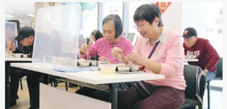
This handout photo released by Hengqin's Livelihood Affairs Bureau on Saturday shows senior citizens having their lunch in the MNN neighbourhood's newly opened canteen on Friday.