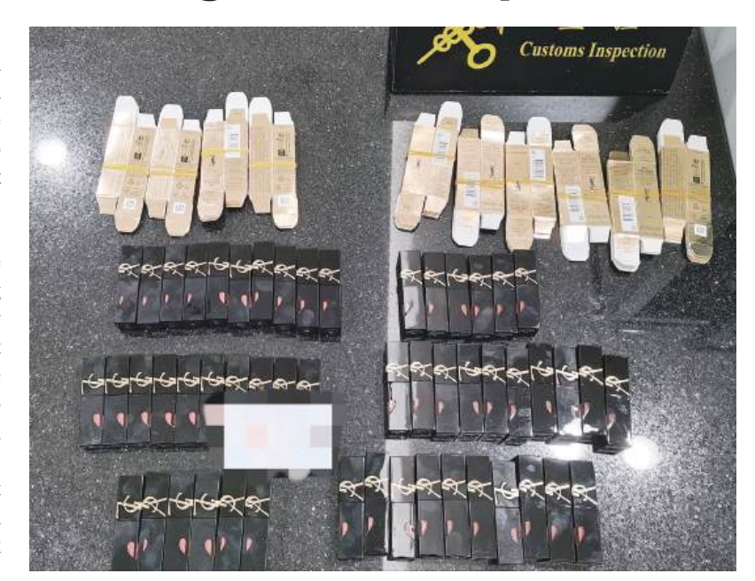
This undated handout photo released by Gongbei customs yesterday shows the seized boxes of lipstick.

The statement underlined that evading customs supervision by concealing items that are subject to duty payments when entering or leaving the mainland constitutes the offence of smuggling, adding that