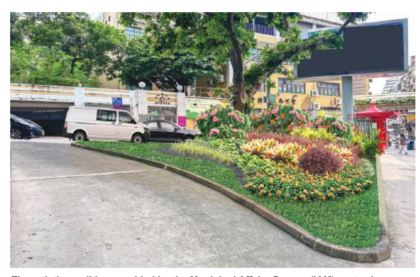
The artist's rendition provided by the Municipal Affairs Bureau (IAM) yesterday shows the future flowerbed at the junction of Rua do Campo and Rua de Pedro Nolasco da Silva.