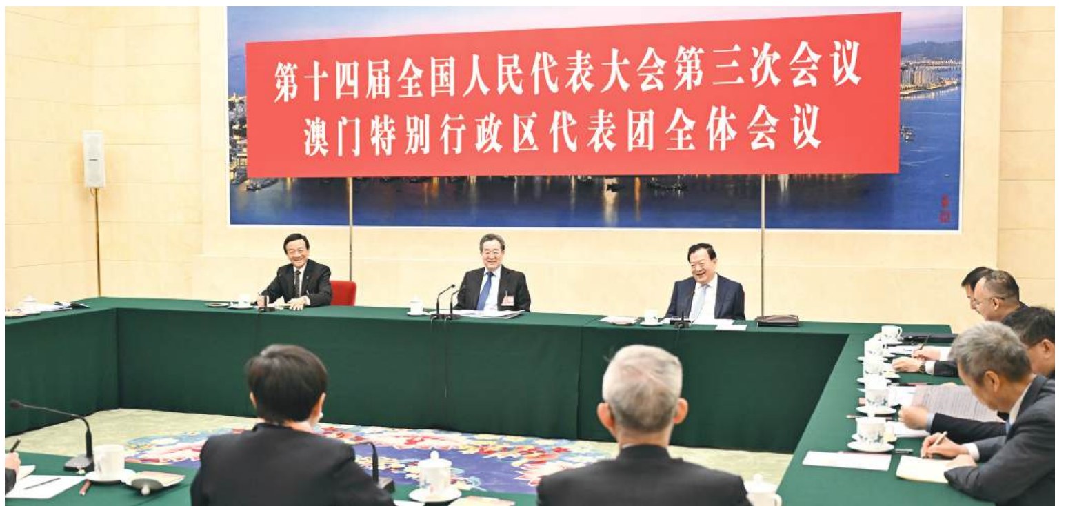
Vice Premier Ding Xuexiang (centre) attends Friday's deliberation meeting of the Macau delegation at the third session of the 14th National People's Congress (NPC) in Beijing, flanked by Xia Baolong (right), who heads both the Hong and Macao Affairs Office of the State Council and Communist Party of China (CPC) Central Committee, and Lao Ngai Leong.

He conveyed the message that local NPC deputies should deeply study and implement the spirit of Xi Jinping's important speeches by embracing the crucial mission of practising the "One Country, Two Systems" principle in the new era, with the aim of making greater contributions to promoting the construction of a powerful country and achieving national rejuvenation, while also ensuring better development for Macau.