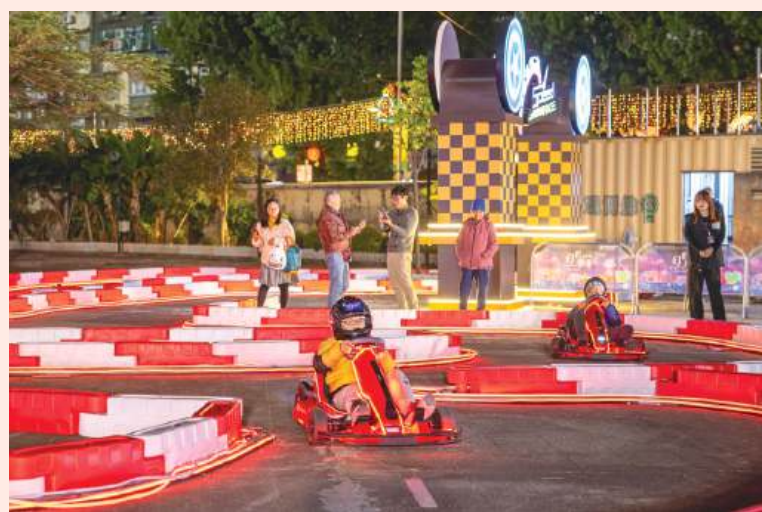
This undated handout photo provided by the Macau Government Tourism Office (MGTO) shows children playing at one of the Light Up Macao installations.

The statement added that a “wide promotional campaign” was held for the event across MGTO’s social media platforms, while key opinion leaders (KOLs) from Macau, the mainland, and elsewhere were also invited. Over 154 million “impressions” were garnered, according to the statement. ■