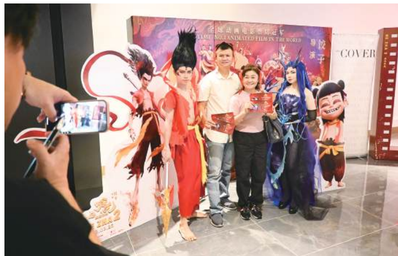
Fans pose for during the premiere of the Chinese animated blockbuster "Ne Zha 2" in Kuala Lumpur, Malaysia, on Saturday. The film will be formally released in Malaysian cinemas on Thursday.

She added that movies are a vital bridge for cultural exchange, and audiences from all walks of life in Malaysia will gain a deeper understanding of Chinese culture through this story and the movie.