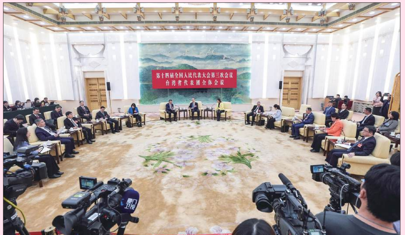
A group meeting of deputies from the Taiwan delegation is held at the third session of the 14 th National People's Congress (NPC) in Beijing yesterday.

Work needed to be done to coordinate carbon emission reduction, pollution mitigation, green development, and economic growth, he added. – Xinhua