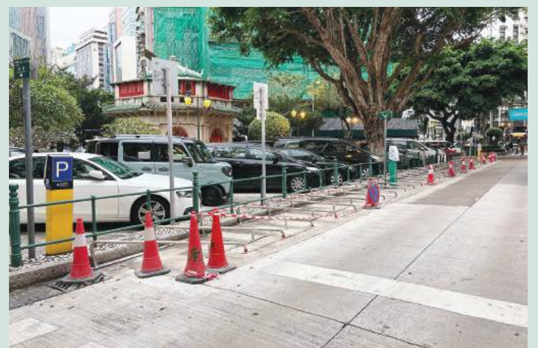
This undated handout photo, provided by the Transport Bureau (DSAT) on Friday, shows the newly set-up angled parking spaces for motorbikes on Rua de Santa Clara.