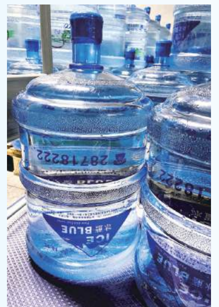
This undated handout photo provided by the Municipal Affairs Bureau (IAM) on Friday shows the problematic locally made "Ice Blue (冰藍)" 18.9 litre bottle of drinking water manufactured by "愛高普飲料廠".

Anyone who has food-related enquiries may call the IAM's Food Safety Hotline on 2833 8181. ■