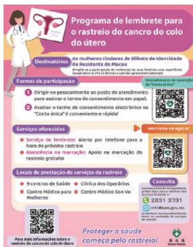
This poster provided by the Health Bureau (SSM) on Friday urges eligible female residents to undergo cervical cancer screening.