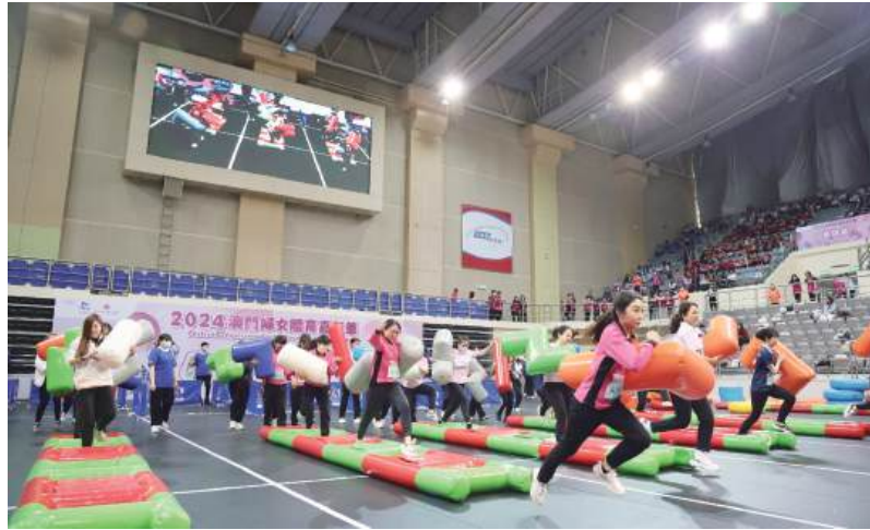
This file photo released by the Sports Bureau (ID) shows participants in the 2024 Macau Women's Sports Carnival last year.

Regarding employment, the statement said that with Macau's level of education among women