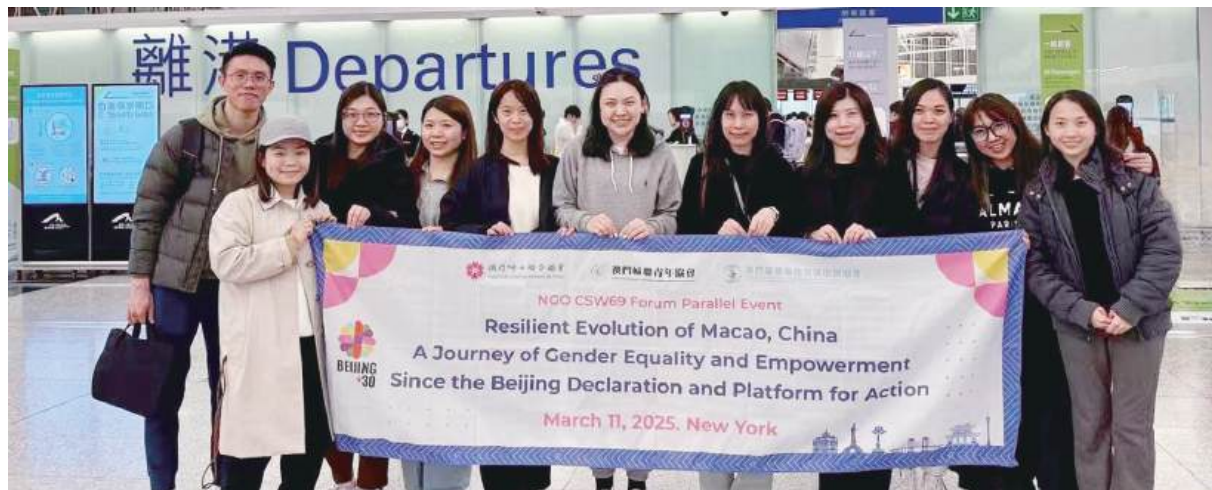
Representatives from the Women's General Association of Macau (commonly known as Fu Luen in Cantonese) pose before flying to New York to participate in the 69 th Session of the United Nations (UN) Commission on the Status of Women (CSW69) early Saturday morning at the Hong Kong International Airport (HKIA).

A statement provided by Fu Luen yesterday stated that, with the aim of playing a key role in global discussions regarding advancing gender equality and women's empowerment, the CSW69 will be held at the UN Headquarters from today to March 21, comprising young