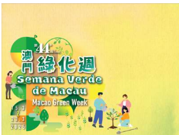
This image provided by the Macao Post and Telecommunications Bureau (CTT) shows the Commemorative Envelope of "World Forest Day".

*Established by the United Nations (UN), world forest day is internationally known as the International Day of Forests (IDF) and is annually observed on March 21. It is aimed towards raising "awareness about the importance of forests and trees in sustaining life on Earth" and focuses on themes related to forests. —Source: Poe