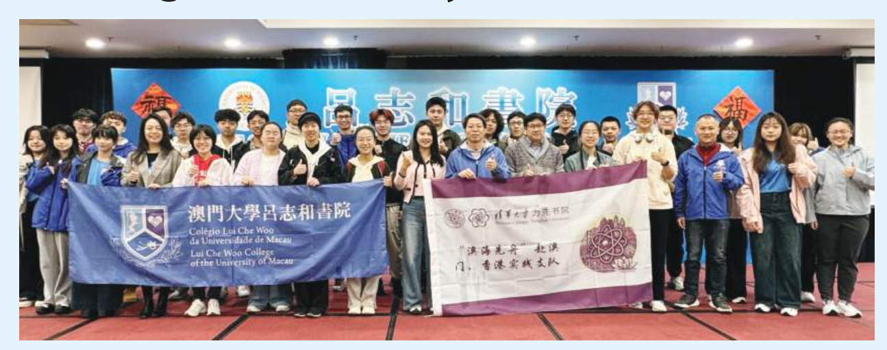
This undated handout photo provided by the University of Macau (UM) on Friday shows a group photo of the participants of the recent UM-Tsinghua exchange programme.