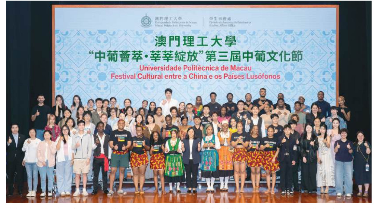
on Friday shows the participants in its recently held third edition of its China-Portuguese-speaking Countries Cultural Festival.