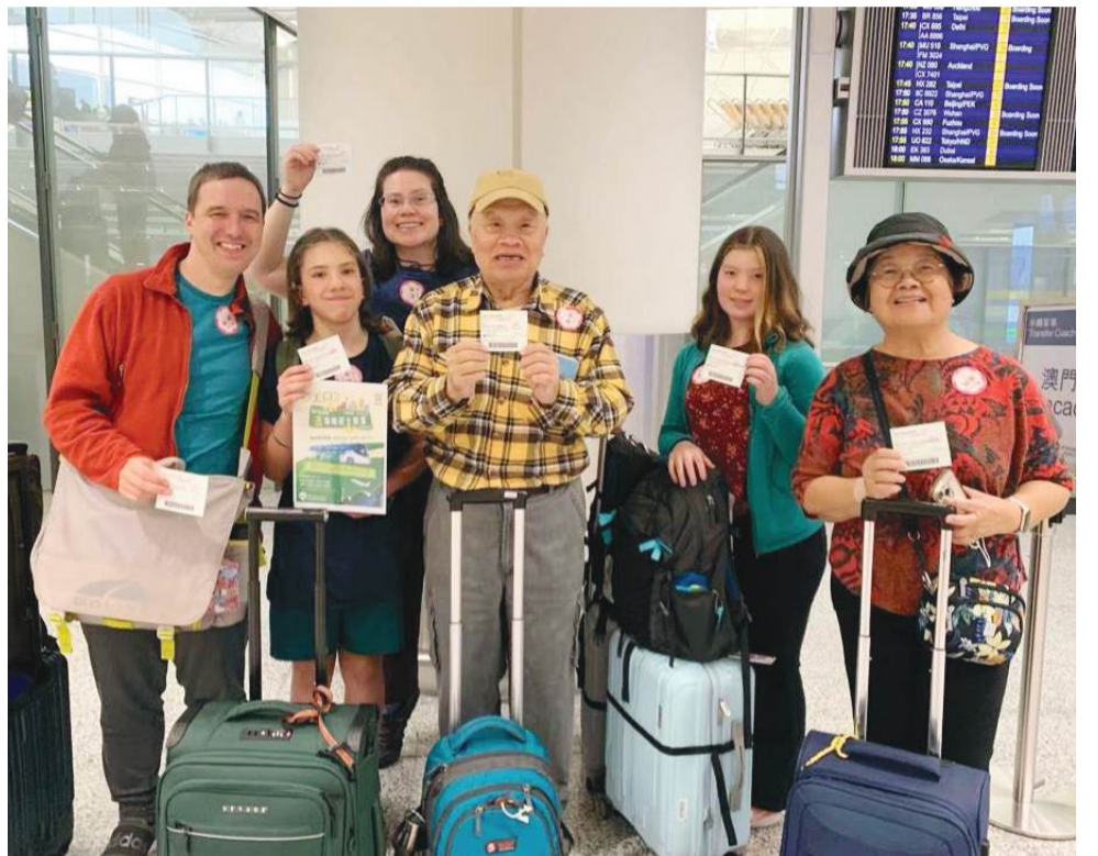
This undated and unlocated handout photo by the Macau Government Tourism Office (MGTO) last year shows a family of foreign visitors posing with their discounted ferry tickets.