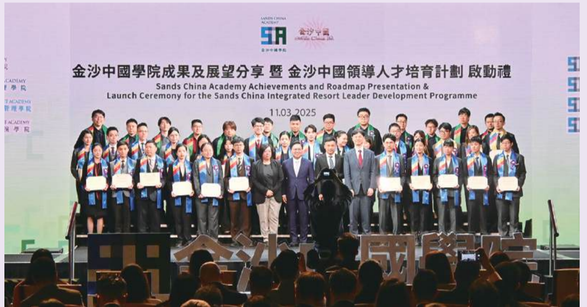
Graduates pose with guests yesterday during the Sands China Academy Achievements and Roadmap Presentation at The Londoner Macao in Cotai.