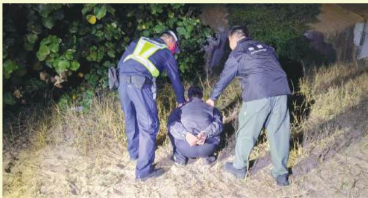
This handout photo provided by the Macau Customs Service (SA) yesterday shows two custom officers holding the illegal immigrant at Hac Sa Beach on Saturday night.

"Snakeheads" are known for arranging transportation, forged documents, and other logistics to help people cross borders illegally. They often charge high fees for their services, and the journeys they organise can be extremely dangerous, sometimes resulting in exploitation, abuse, or even death for the migrants. — DeepSeek