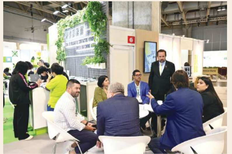
This file photo provided by the Macao International Environmental Co-operation Forum and Exhibition (MIECF) yesterday shows participants in an activity during a previous edition of the event.

*Bonn-based ICLEI stands for International Council for Local Environmental Initiatives. It is now commonly known as ICLEI – Local Governments for Sustainability. ICLEI is a global network of local and regional governments committed to sustainable urban development. Founded in 1990, ICLEI works with cities, towns, and regions to help them achieve their sustainability goals, address environmental challenges, and improve the quality of life for their residents. The organization focuses on areas such as climate change mitigation and adaptation, biodiversity, resource efficiency, and sustainable urban planning. — DeepSeek