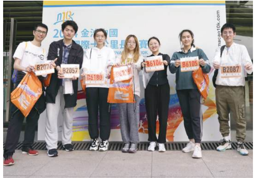
This handout photo provided by the Sports Bureau (ID) last night shows participants in last year's race displaying their number bibs.

The statement added that this year "The FUNkiest Costume Award" is themed "Ocean Run"