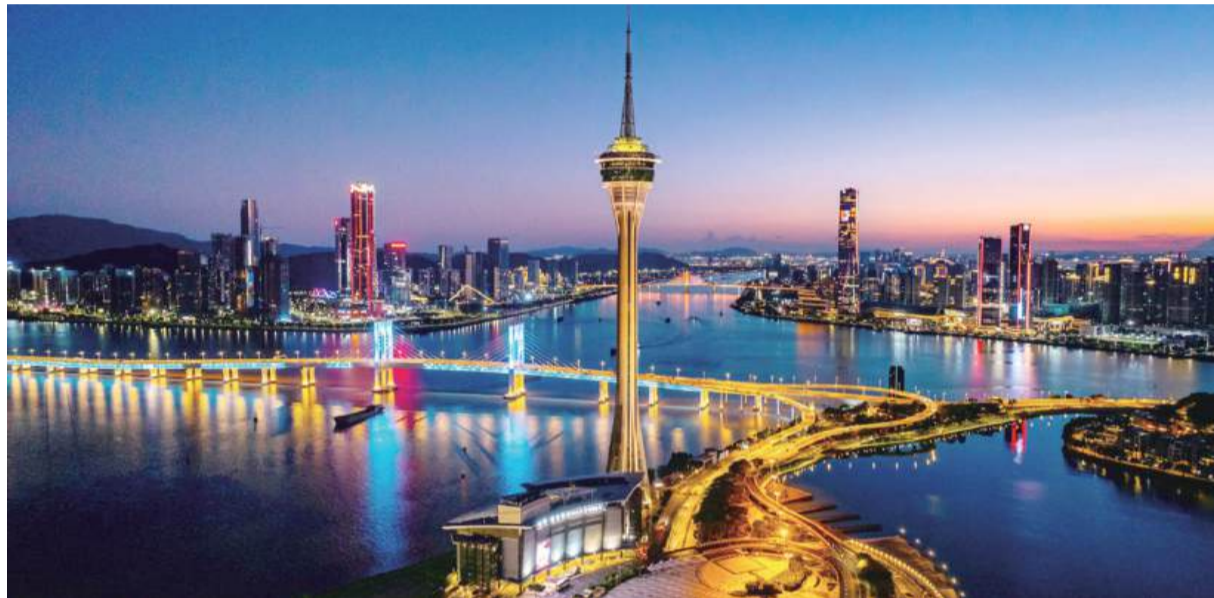
This aerial drone photo taken on July 5, 2024 shows both parts of Macao and Hengqin.