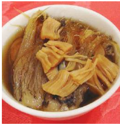
June 2006 file photo of a bowl of "Buddha Jumps Over the Wall"

On Monday morning, the caller claimed that the school's upcoming charity event required the supply