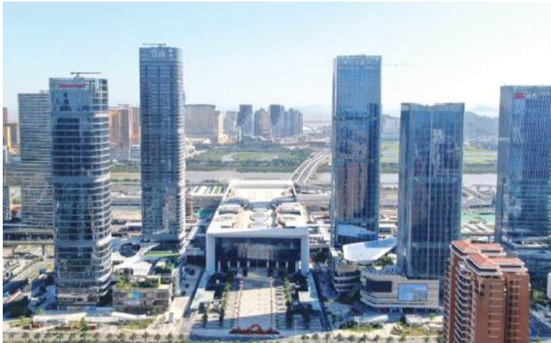
This file photo taken last year shows the Guangdong-Macau In-Depth Cooperation Zone in Hengqin.