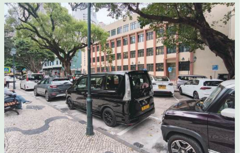
This photo taken yesterday shows cars parked in the lengthened parking spaces on Rua de Santa Clara in Nam Van district.

In the first phase, according to the statement, the bureau will gradually lengthen street parking spaces for cars in different areas in Nam Van district, involving about 130 parking spaces in total. ■