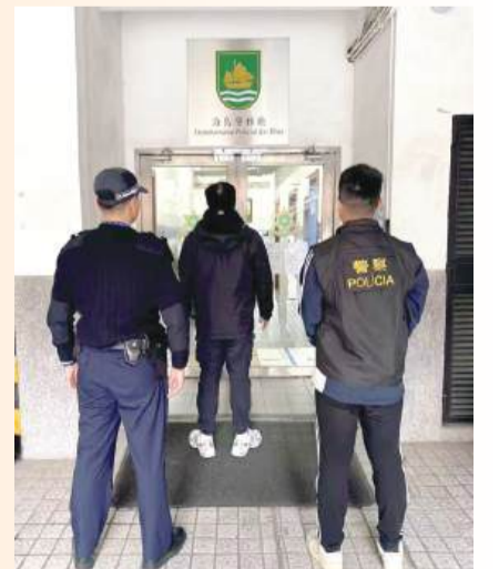
This undated handout photo provided by the Public Security Police (PSP) yesterday shows PSP officers escorting the South Korean suspect to a police station.