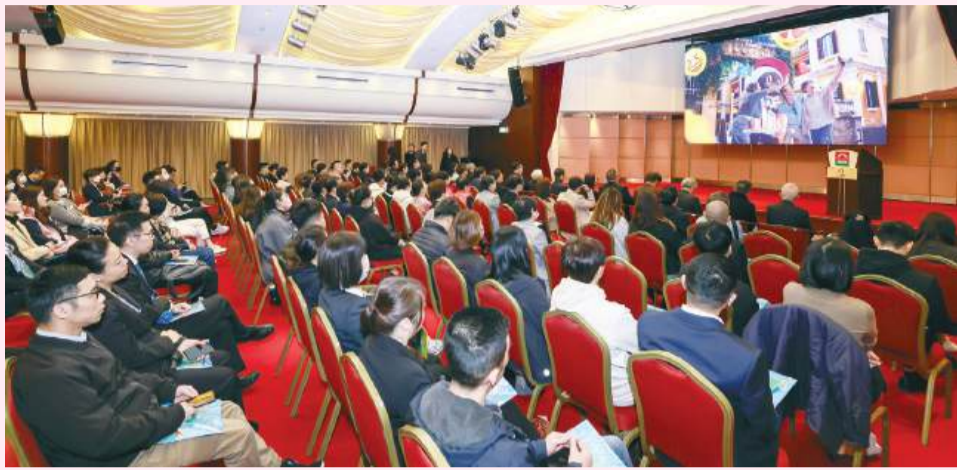
This photo taken and provided by the Macau Government Tourism Office (MGTO) shows the presentation seminar recently held at the Macau World Trade Centre (MWTC) for this year's Quality Tourism Services Accreditation Scheme (QTSAS).