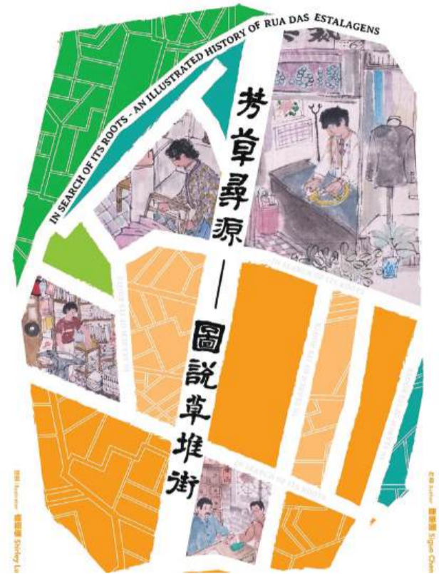
This image provided by Sands China on Wednesday shows the front cover of "In Search of Its Roots – An Illustrated History of Rua das Estalagens".

金沙中國片區活化項目 Sands China's Community Revitalization Programme