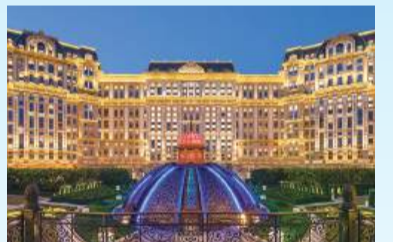
This image downloaded from the Grand Lisboa Palace website last night shows the integrated resort's Jardim Secreto ("Secret Garden").

Ho was also quoted as saying: "The event is not just a competition but a collaborative effort between Hong Kong and Macau to promote national fitness and foster youth