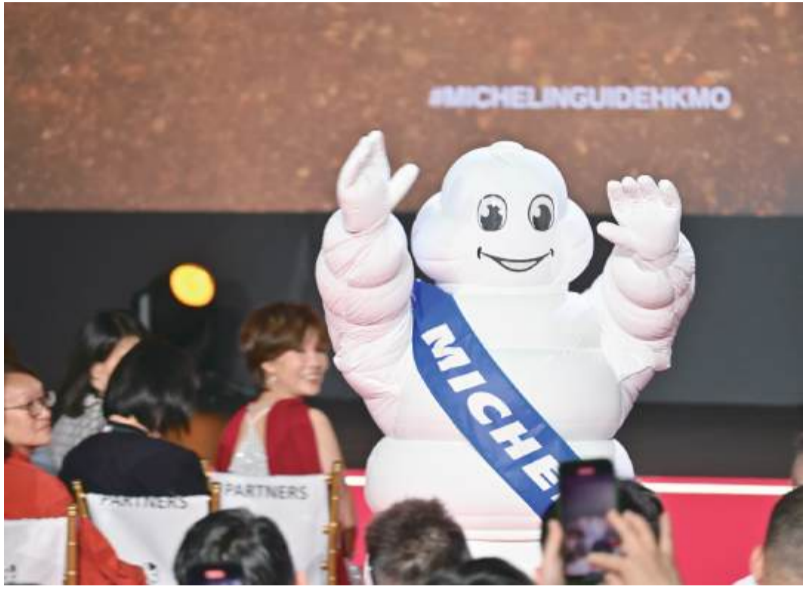
MICHELIN Guide mascot Bibendum, aka the "Michelin Man", waves to guests and attendees at yesterday's 17 th MICHELIN Guide Hong Kong & Macau at Grand Lisboa Palace in Cotai last night.