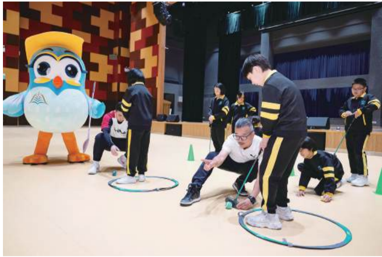
This undated handout photo provided by Galaxy Entertainment Group (GEG) yesterday shows students taking part in training sessions in the "Galaxy Entertainment Group Presents: PGA Tour Dreams, Macau" programme.

The programme is aimed at promoting golf in local schools, stimulating the next generation's interest and understanding of golf, and contributing to the development