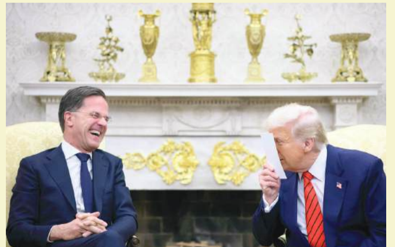
US President Donald Trump (right) and NATO Secretary General Mark Rutte share a laugh before speaking to the press in the Oval Office of the White House in Washington, DC, yesterday.