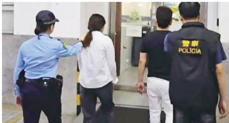
This undated handout photo provided by the Public Security Police (PSP) on Friday shows the two suspected “loan con artists” being escorted to a police station.

The two suspects have been transferred to the Public Prosecutions Office (MP), facing a fraud charge. ■