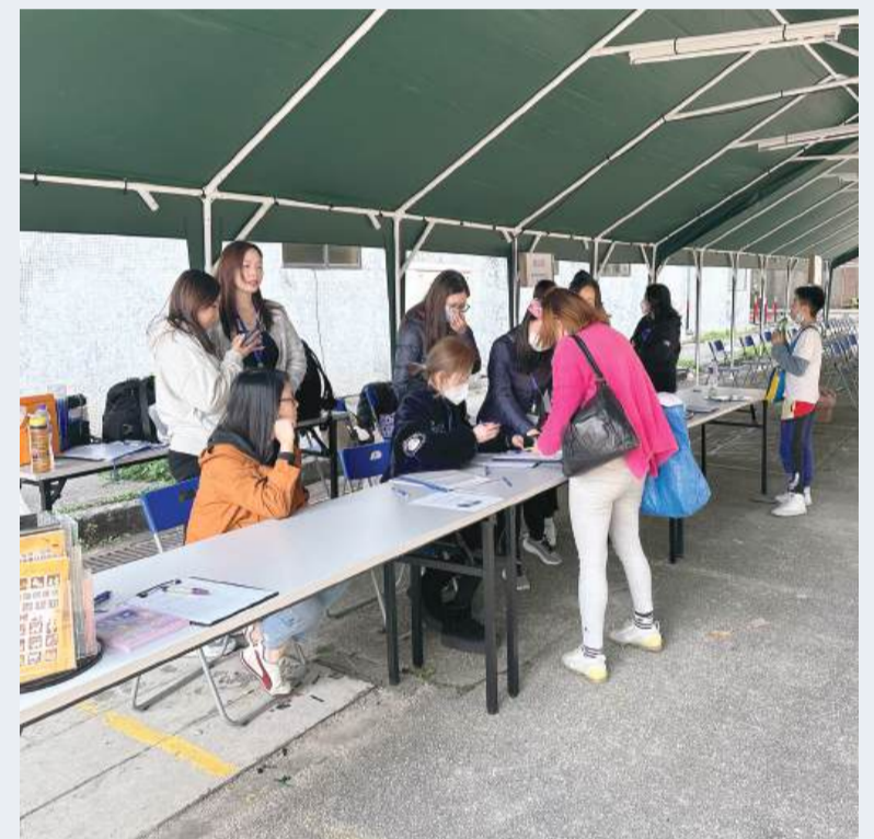
Members of the public wait to see the cats up for adoption yesterday at the Macau Jockey Club in Taipa.

the Macau Jockey Club, the adoption place was still bustling at 1 p.m., with many parents bringing their children to look for their favourite cats. The waiting area was crowded, and potential adopters walked around the dozens of cages, eagerly waiting to choose their preferred cats.