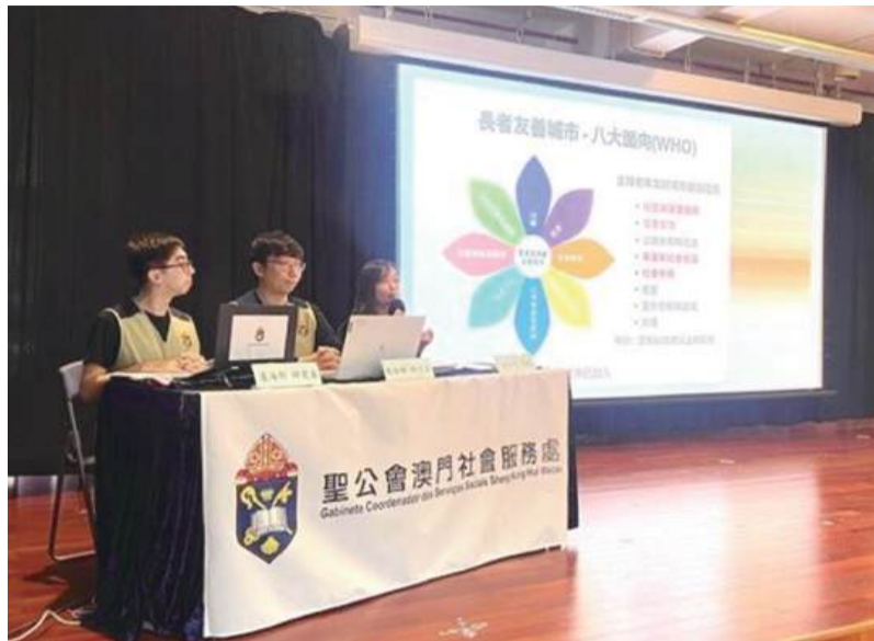
Representatives of the Sheng Kung Hui (SKH) Macau Social Services Centre release the findings of their survey during Friday's press conference on the SKH premises.

According to the findings, the respondents and interviewees also expressed a positive outlook on community and health services, particularly regarding the local government's ongoing investment in optimising healthcare, including initiatives such as home care services, free medical care for