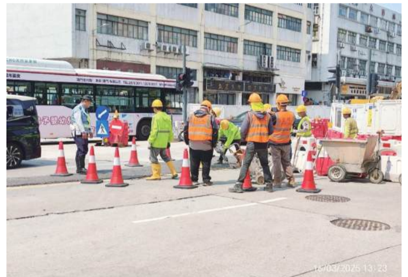
This handout photo released by the Public Works Bureau (DSOP) yesterday shows workers levelling uneven road surfaces outside Praça de Ponte e Horta yesterday.

The statement said that the bureau has been aware of complaints by some residents about the uneven road surfaces, adding that it is urging the respective contractors to take special measures to level the uneven road surfaces. ■