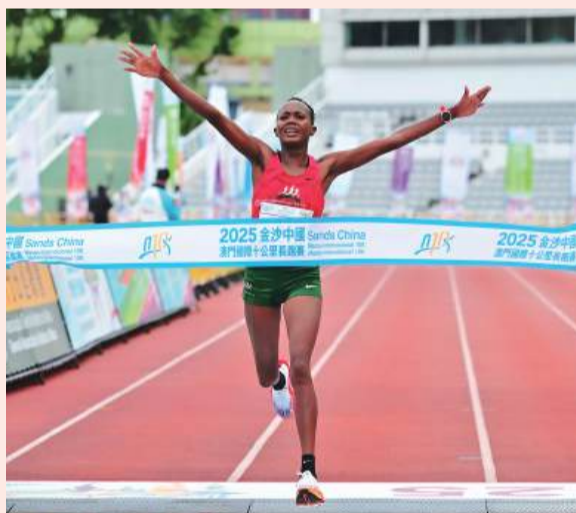
Kenyan athlete Betty Sigei crosses the finish line to win the women's race of the 2025 Sands China Macao International 10K yesterday.