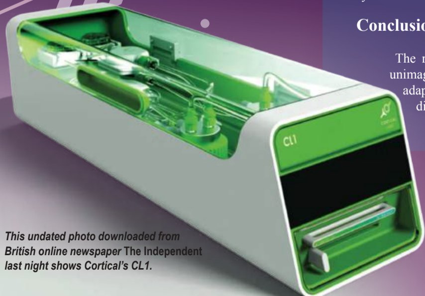
This undated photo downloaded from British online newspaper The Independent last night shows Cortical's CL1.

The rise of quantum processors like Zuchongzhi-3 and Majorana 1 highlights the race to unlock unimaginable computational power, while Cortical's biological computer redefines efficiency through adaptive neural networks. Yet challenges – quantum instability, unproven theories, and ethical dilemmas – demand rigorous collaboration and transparency. The future lies not in one technology, but in merging quantum, biological, and classical systems to transcend today's limits.