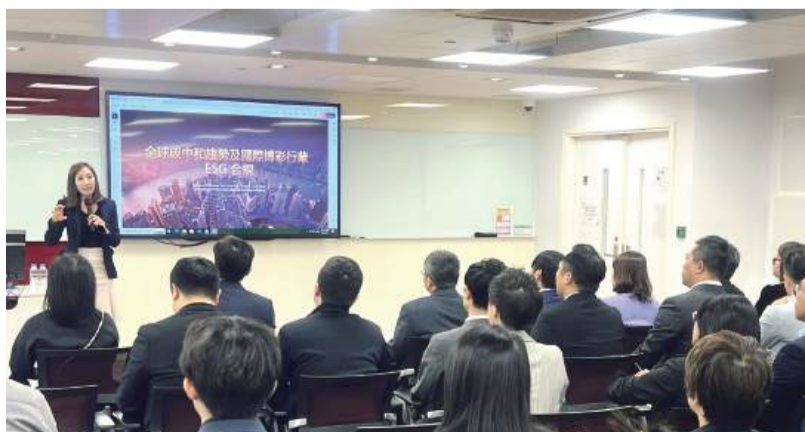
This undated handout photo provided by the Macao Polytechnic University (MPU) on Thursday shows an unidentified speaker addressing the audience during the recent "Global Carbon Neutrality Trends and ESG Compliance in the International Gaming Industry".