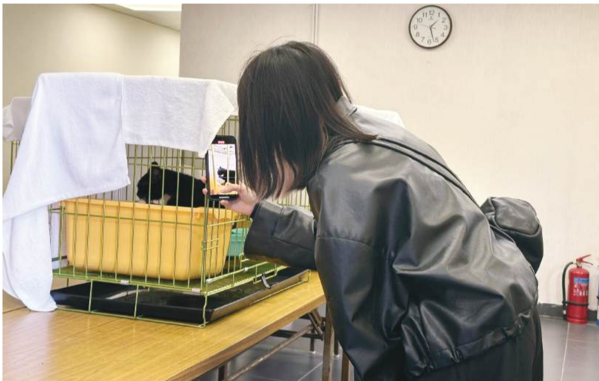
A potential adopter takes a photo of one of the Macau Jockey Club's "working cats" awaiting adoption during yesterday's adoption campaign.

The Facebook post sparked significant public debate online, with many netizens using various channels to voice their opinions and seek assistance, including contacting lawmakers and TVB's information programme "Scoop", in the hope of