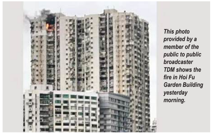
This photo provided by a member of the public to public broadcaster TDM shows the fire in Hoi Fu Garden Building yesterday morning.

The fire was put out by the building’s management. ■