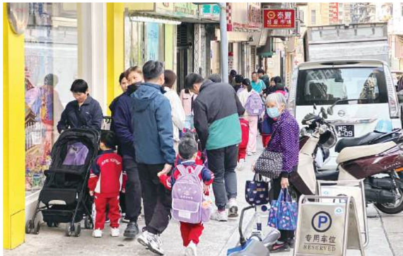
This photo taken yesterday shows parents and guardians picking up their kids from a kindergarten in San Kio district.