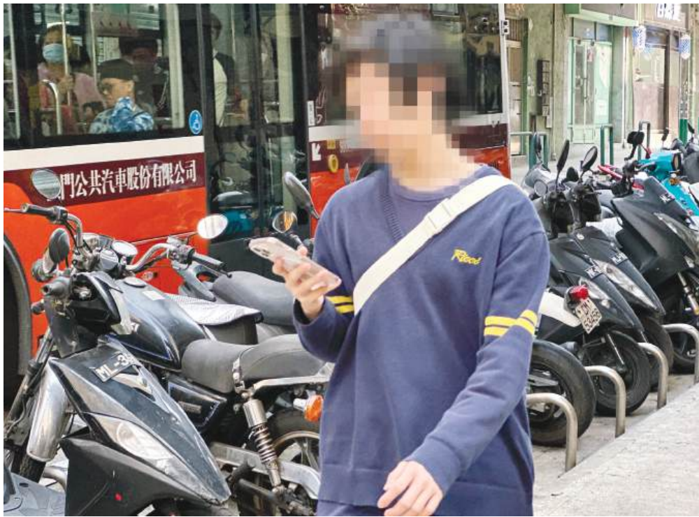
A secondary school student walks along the street in San Kio district looking at his mobile phone.

Citing the Sheng Kung Hui's 2022 Digital Literacy Survey conducted among individuals aged 10 to 35, Ho said that increased time spent