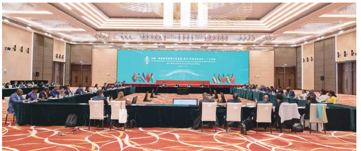
This handout photo released by Forum Macao's Permanent Secretariat yesterday shows its meeting held at its headquarters, the Forum Macao Complex, yesterday.