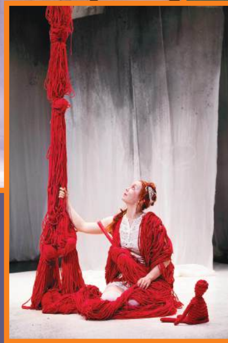
These undated handout photos provided by the Cultural Affairs Bureau (IC) show scenes of "Knitting Peace", which will take to the stage at the Macau Cultural Centre (CCM) tomorrow and Saturday.