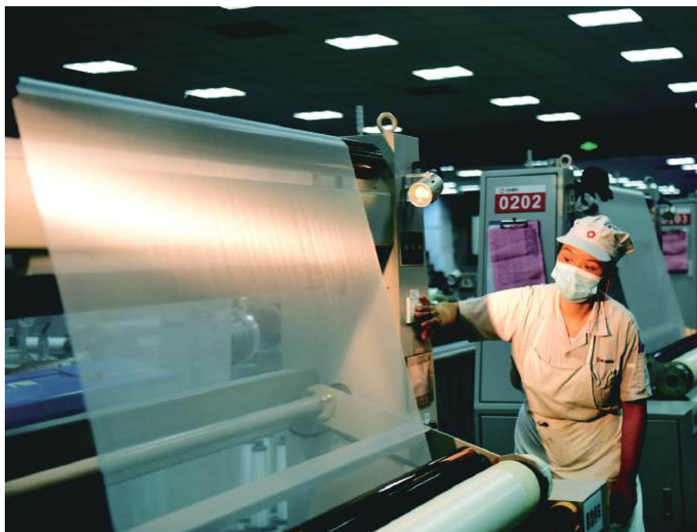
A staff member works at a new materials firm in the Hongqi Canal Economic and Technological Development Zone of Linzhou City, Henan Province, yesterday. In the spring, private enterprises in the Hongqi Canal Economic and Technological Development Zone are operating at full swing to fulfill orders. Thanks to the favorable policies in recent years, the zone has implemented multiple measures to promote high-quality development of the private economy. This has gradually led to the formation of three major industrial systems, including equipment manufacturing, high-quality steel and deep processing, and advanced inorganic non-metallic materials, while nurturing a number of private enterprises already exceeding their designated size.

** When golfers talk about the "back nine," they are referring to the final nine holes of their round. — DeepSeek