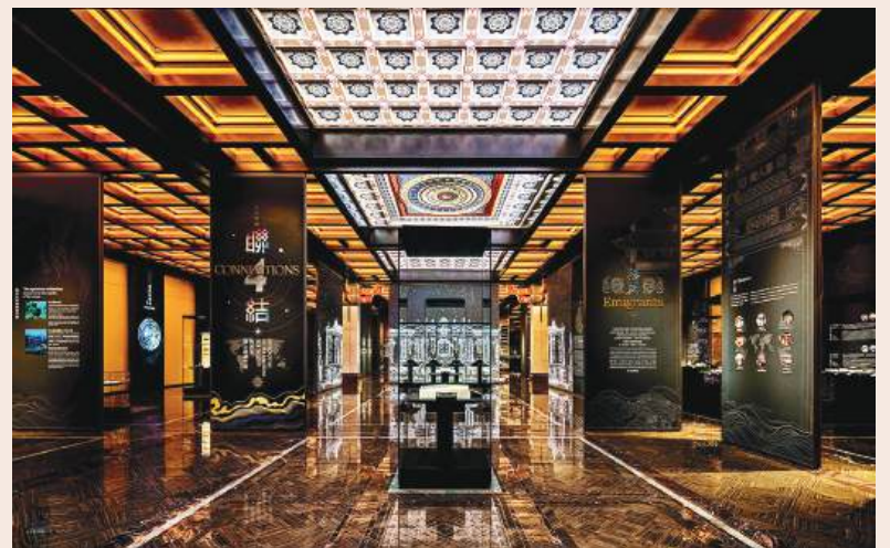
This undated handout photo provided by integrated resort operator MGM yesterday shows a section of the POLY MGM MUSEUM at MGM MACAU.

Winning the iF Design Award, which the statement noted is celebrated as the "Oscars of the design industry" since its inception in 1953, is another milestone for the integrated resort operator, placing the museum alongside respected Chinese institutions such as Kunming's Mountain & Sea Art Museum and the Hunan Museum's "Mawangdui Digital Exhibition", both of which are also fellow recipients. ■