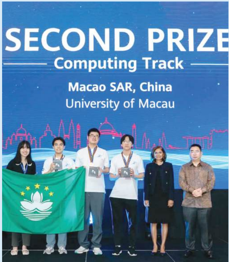
The handout photo released by the public university on Tuesday shows the UM team holding their 2 nd prizes in the Computing Track competition in Kuala Lumpur, Malaysia, on February 27.