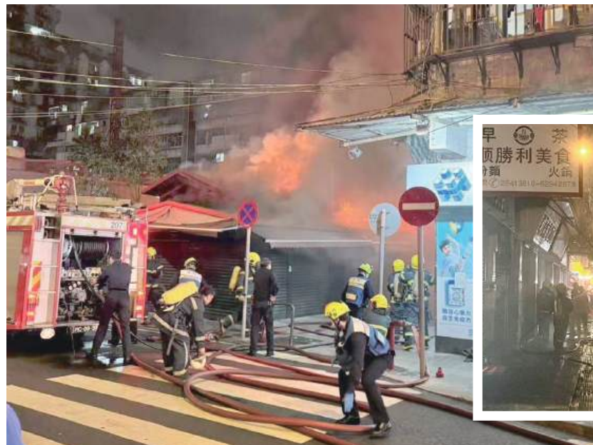
Firefighters battle a blaze at the area of vendor stalls in Iao Hon on Sunday night.

Sunday's blaze came after a number of vendor stalls built in a row located opposite the former greyhound racetrack in Fai Chi Kei were gutted by a fire in January 2023. ■