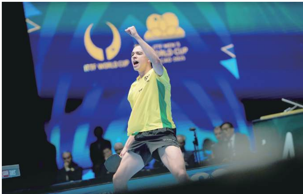
This photo provided by the Sports Bureau (ID) and released on Sunday shows Brazil's Hugo Calderano during the finals for the International Table Tennis Federation (ITTF) Men's and Women's World Cup Macao 2025 presented by Galaxy Entertainment Group at the Galaxy Arena in Cotai.