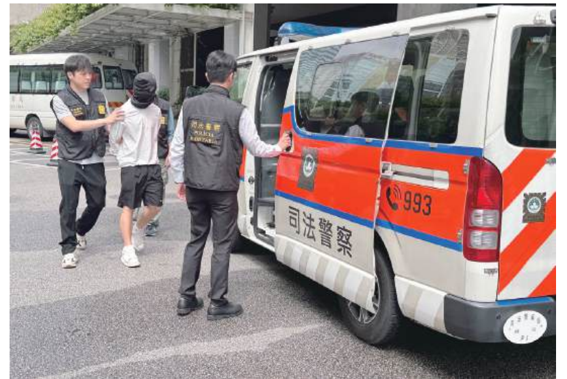
Judiciary Police (PJ) officers escort the hooded suspect to a PJ van outside the PJ headquarters in Zape yesterday.