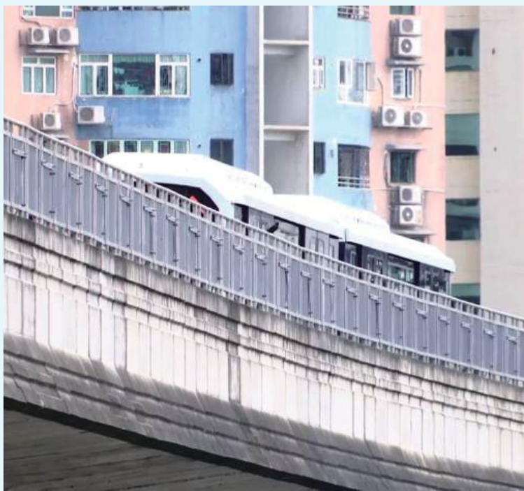
This photo shows the LRT train stalled on the track near the Jockey Club Station on Sunday.

Sunday's malfunction of the LRT system came after it was affected by a breakdown in September last year and another one in October. ■