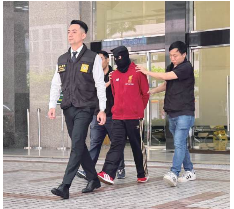
Judiciary Police (PJ) officers escort the hooded suspect to a PJ van outside the PJ headquarters in Zape yesterday.