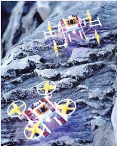
This photo taken on January 2 shows untethered terrestrial-aerial micro-robots developed by a research team from Tsinghua University, in Beijing.

“Developing untethered, ultra-compact micro-robots with complex shape-morphing capabilities is