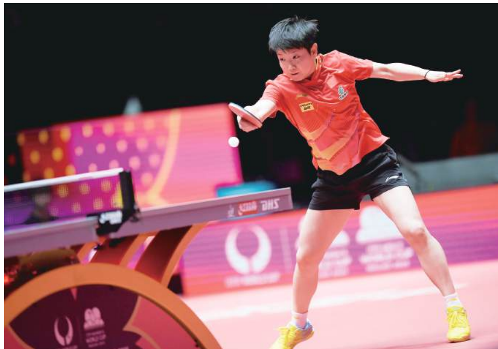
Sun Yingsha competes during Sunday's ITTF finals at Galaxy Arena.

The statement noted that Calderano made history by being the first Brazilian and Pan