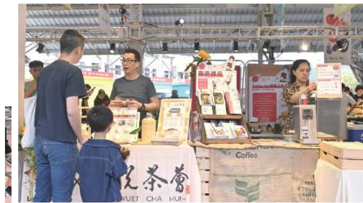
Booths run by local brands showcase their offerings at Barra Mart at Barra Kitchen on Saturday.

The market is open at weekends from 10 a.m. to 7 p.m. ■