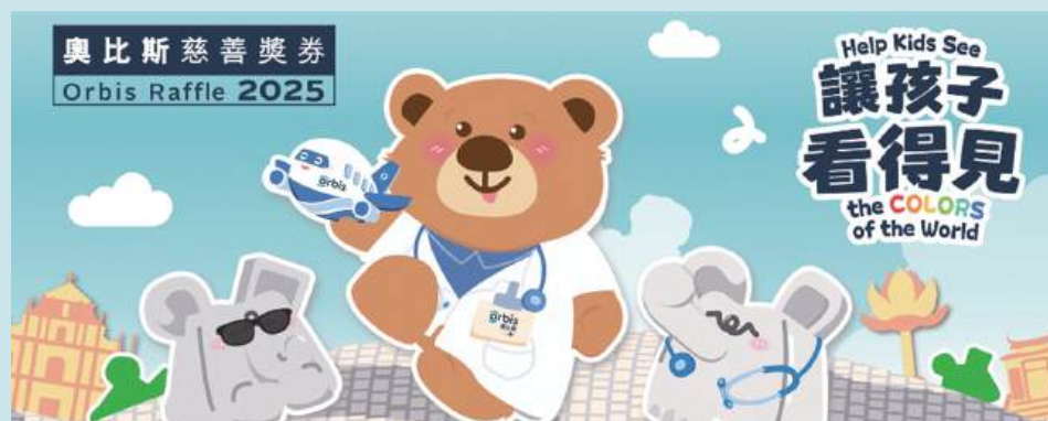
This image downloaded from the Orbis Macau website promotes the Orbis Raffle Charity Sale 2025 that starts today.