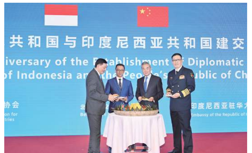
Member of the Political Bureau of the Communist Party of China Central Committee and Foreign Minister Wang Yi (second from right), Chinese Defense Minister Dong Jun (right), Indonesia’s Foreign Minister Sugiono (second from left) and Defense Minister Sjafrie Sjamsoeddin attend a reception marking the 75 th anniversary of diplomatic ties between the two countries and the 70 th anniversary of the Bandung Conference, in Beijing yesterday.

Dong said China is willing to work with Indonesia to implement