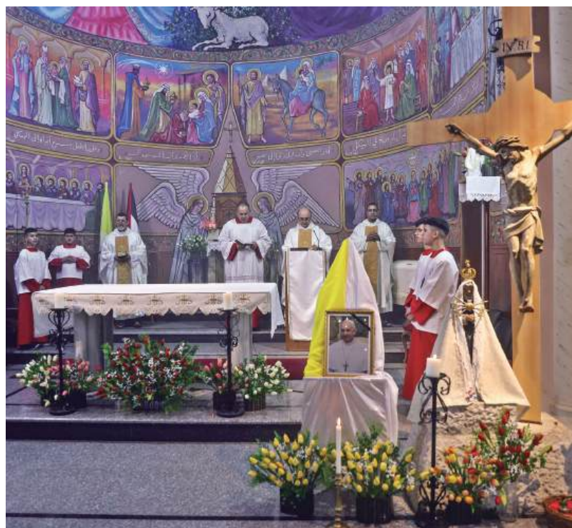
Palestinian clergy members hold Mass for late Pope Francis at the Holy Family Church in Gaza yesterday.