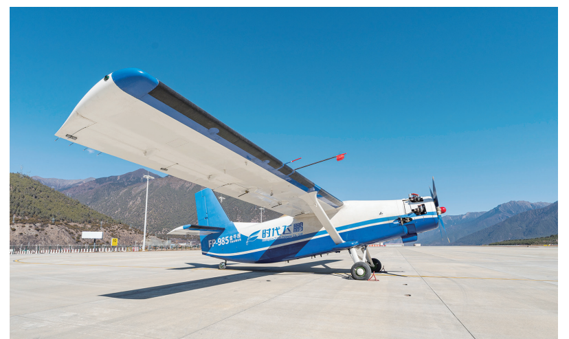
An FP-985 "Taurus" large fixed-wing drone is pictured in Nyingchi city, Xizang Autonomous Region, on December 26, 2025. China's domestically developed large fixed-wing drone, the FP-985 "Taurus," completed a long-distance logistics flight across the high-altitude regions between Sichuan and Xizang yesterday.