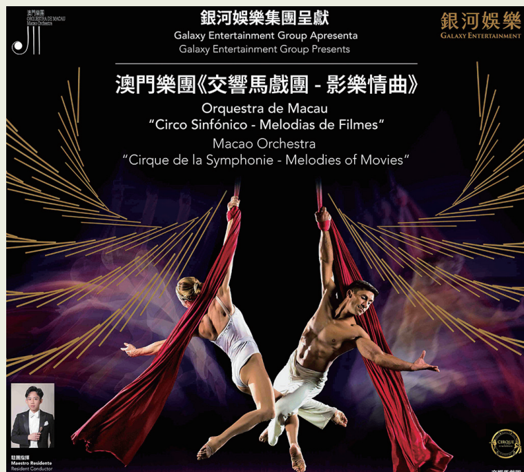
This poster provided by the Cultural Affairs Bureau (IC) yesterday promotes the "Cirque de la Symphonie - Melodies of Movies" which will be held on February 14, Valentine's Day, at Broadway Macau in Cotai

The Macao Orchestra 2025-26 concert season is co-organised by the Cultural Affairs Bureau (IC), Macao Orchestra, and Macau's six integrated resort operators, with support from the Bank of China Macau (BOC) Branch. ■