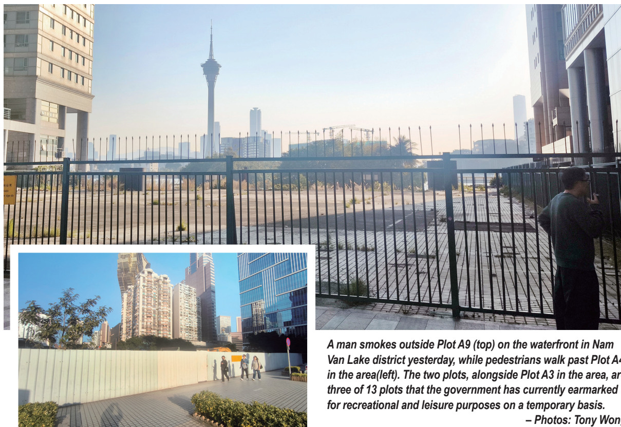
A man smokes outside Plot A9 (top) on the waterfront in Nam Van Lake district yesterday, while pedestrians walk past Plot A4 in the area(left). The two plots, alongside Plot A3 in the area, are three of 13 plots that the government has currently earmarked for recreational and leisure purposes on a temporary basis.