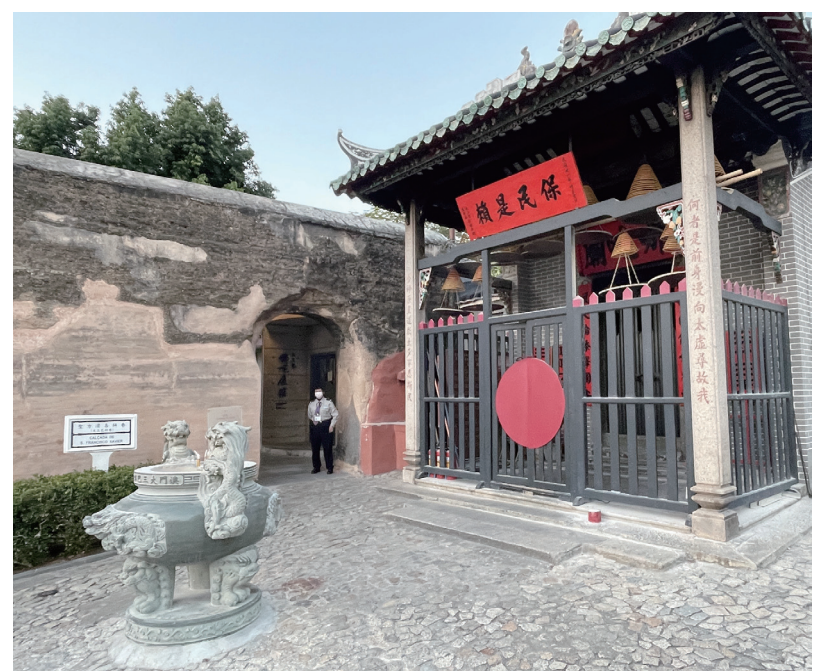
A security guard stands in front of the Na Tcha Exhibition Hall adjacent to the Na Tcha Temple close to the Ruins of St. Paul's and Chi Lam Vai heritage village yesterday afternoon. The Temple and St. Paul's Ruins are UNESCO World Heritage-listed monuments.

Chi Lam Vai (茨林圍) includes a café and souvenir shop dedicated to Na Tcha. ■