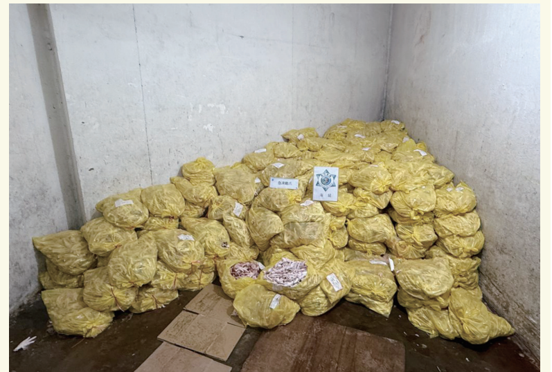
This handout photo released by the Macau Customs Service yesterday shows bags of chicken feet weighing 1.8 tonnes, stored at room temperature, at a parallel trading den in the northern district on Tuesday.