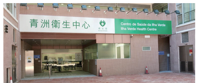
This undated handout photo downloaded from the Health Bureau's (SSM) website yesterday shows its Ilha Verde Health Centre.

levels (such as local hospitals, clinics, or community health programs). This approach aims to ensure that resources are effectively utilised at the grassroots level, addressing specific local needs and improving access to healthcare services for the population. – DeepSeek