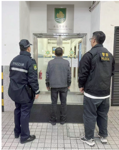
This undated handout photo provided by the Public Security Police (PSP) yesterday shows PSP officers escorting the fraud suspect into a police station.